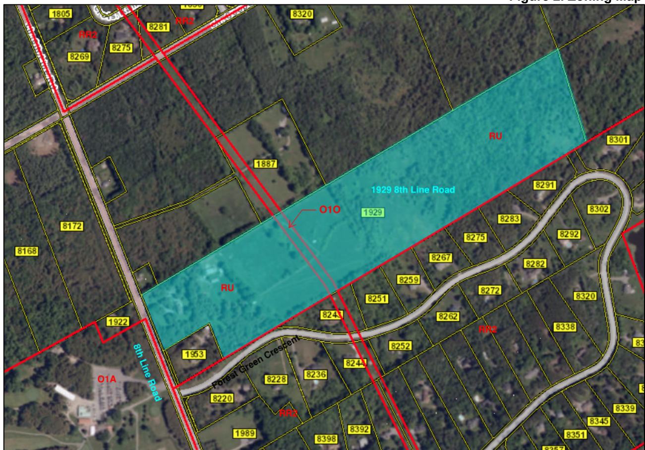
Figure 2. Zoning Map

1929 8 th Line Road is subject to an easement established in 1958 in favour of Trans-Canada Pipe Lines Limited (instrument number OS21743 amended by OS22666). A pipeline corridor crosses the property generally north-south approximately 320 metres east of 8 th Line Road. The pipeline corridor is zoned Parks and Open Space, Subzone O [O1O] (see Figure 2).