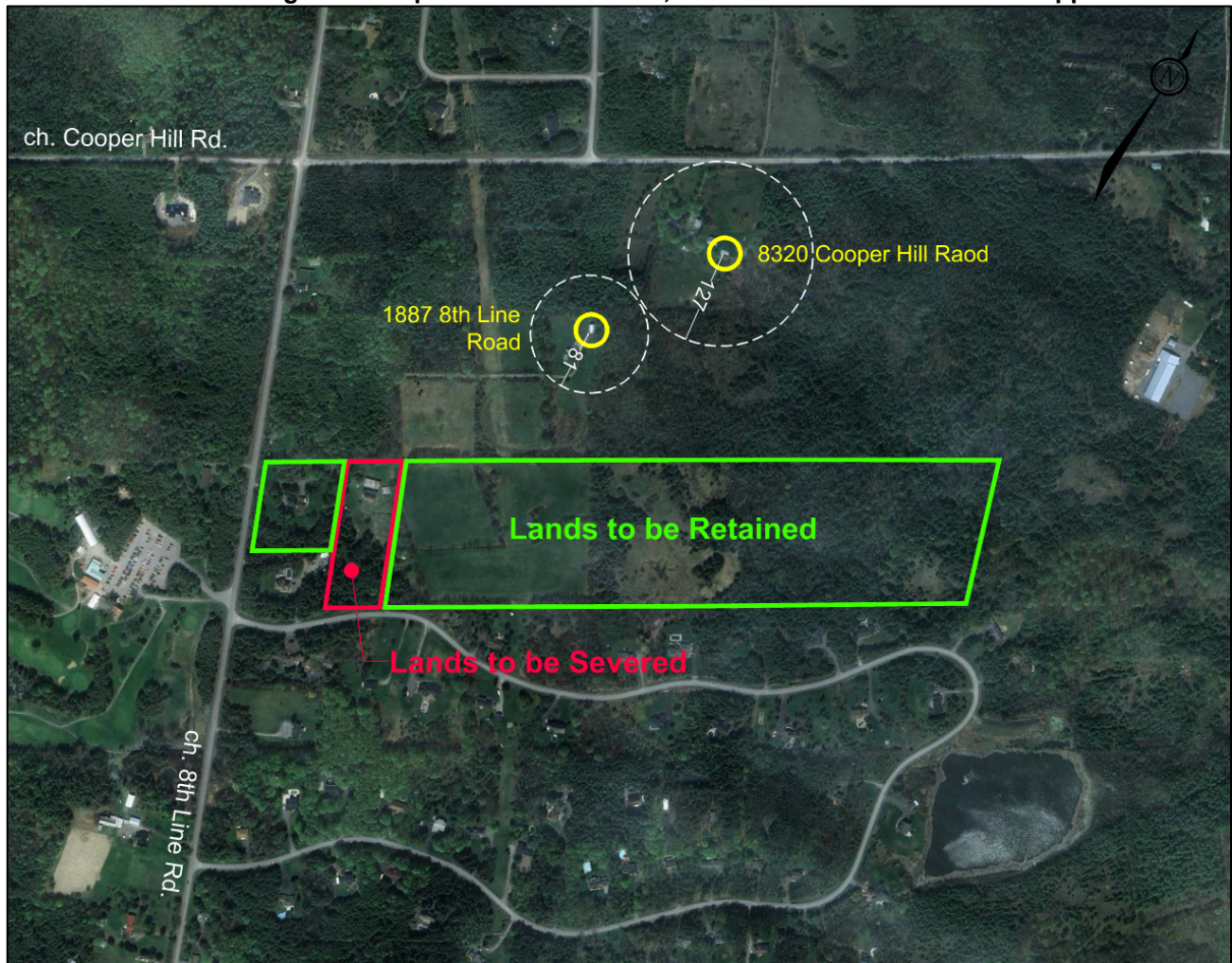
Figure 5. Required MDS Setbacks, 1887 8 th Line Road and 8320 Copper Hill Road

The required MDS setbacks from the livestock facilities at 1887 8 th Line Road and 8320 Copper Hill Road were calculated using a conservative set of assumptions regarding the habitable area of the barns, type of livestock housed, and type of manure storage. The proposed severed and retained parcels meet the required MDS setbacks from the livestock facilities at 1887 8 th Line Road and 8320 Copper Hill Road (see Figure 5).