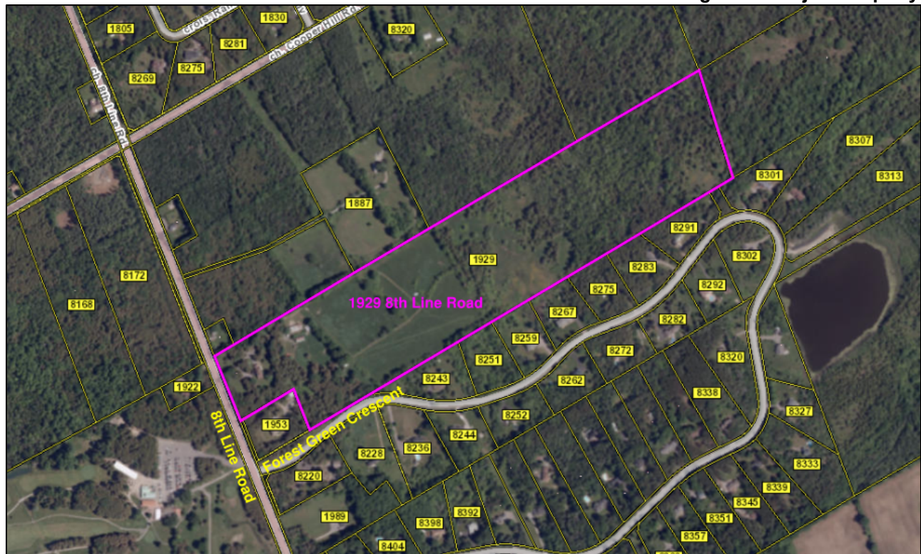
Figure 1. Subject Property

1929 8 th Line Road is located in the Osgoode Ward (Ward 20) of the City of Ottawa, east of 8 th Line Road and north of Forest Green Crescent (see Figure 1). The Subject Property has approximately 123 metres of frontage along 8 th Line Road, 131 metres of frontage along Forest Green Crescent, and an approximate area of 19.97 hectares.