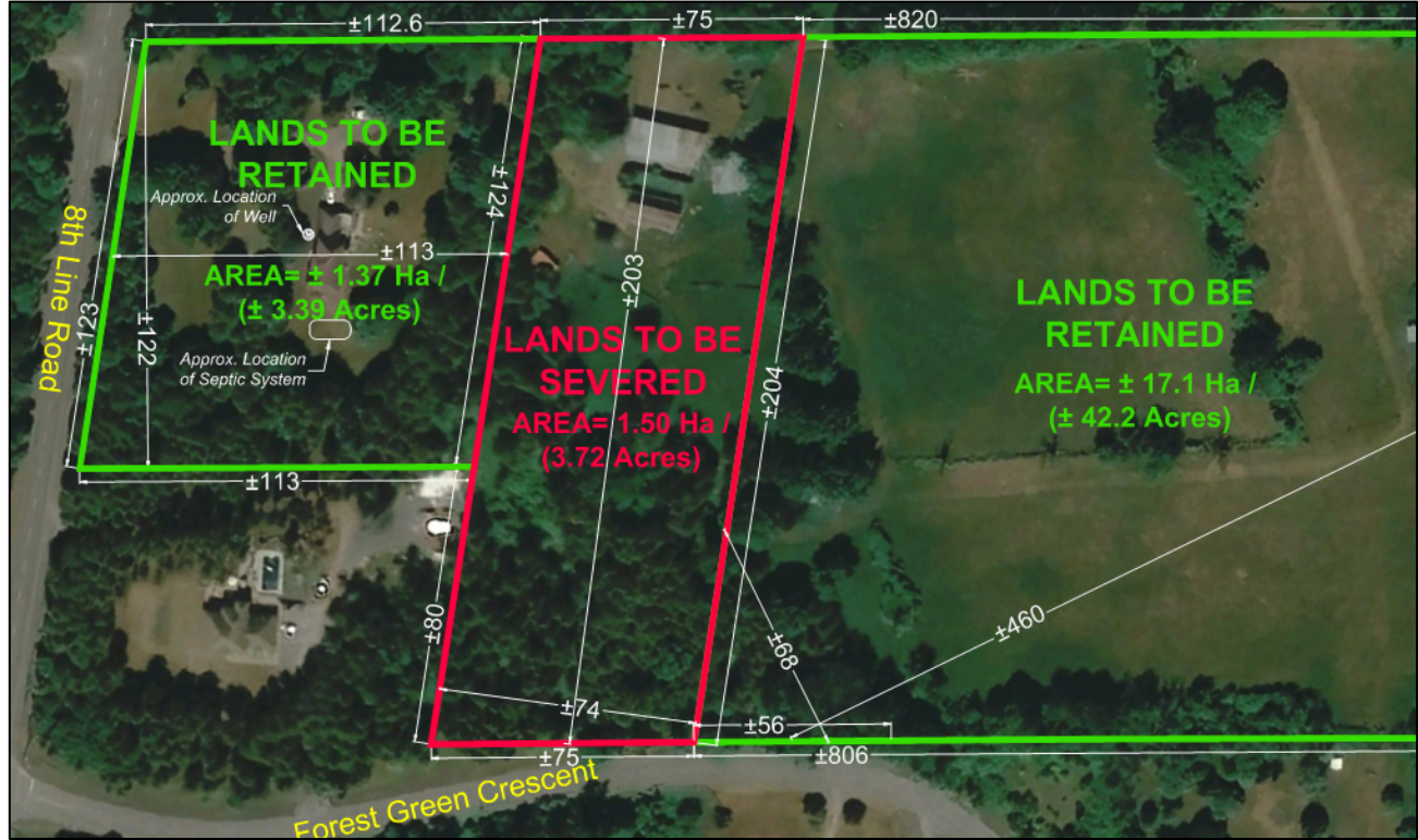
Figure 4. Consent Sketch 2 Excerpt