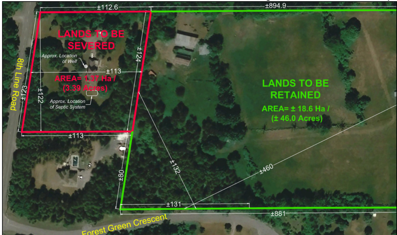
Figure 3. Consent Sketch 1 Excerpt

Consent application 1 will sever a new parcel (the “western severance”) that will accommodate an existing detached dwelling near 8 th Line Road. The severed parcel will have approximately 123 metres of frontage along 8 th Line Road and an approximate area of 1.37 hectares. The retained parcel will have approximately 131 metres of frontage along Forest Green Crescent and an approximate area of 18.6 hectares (see Figure 3).