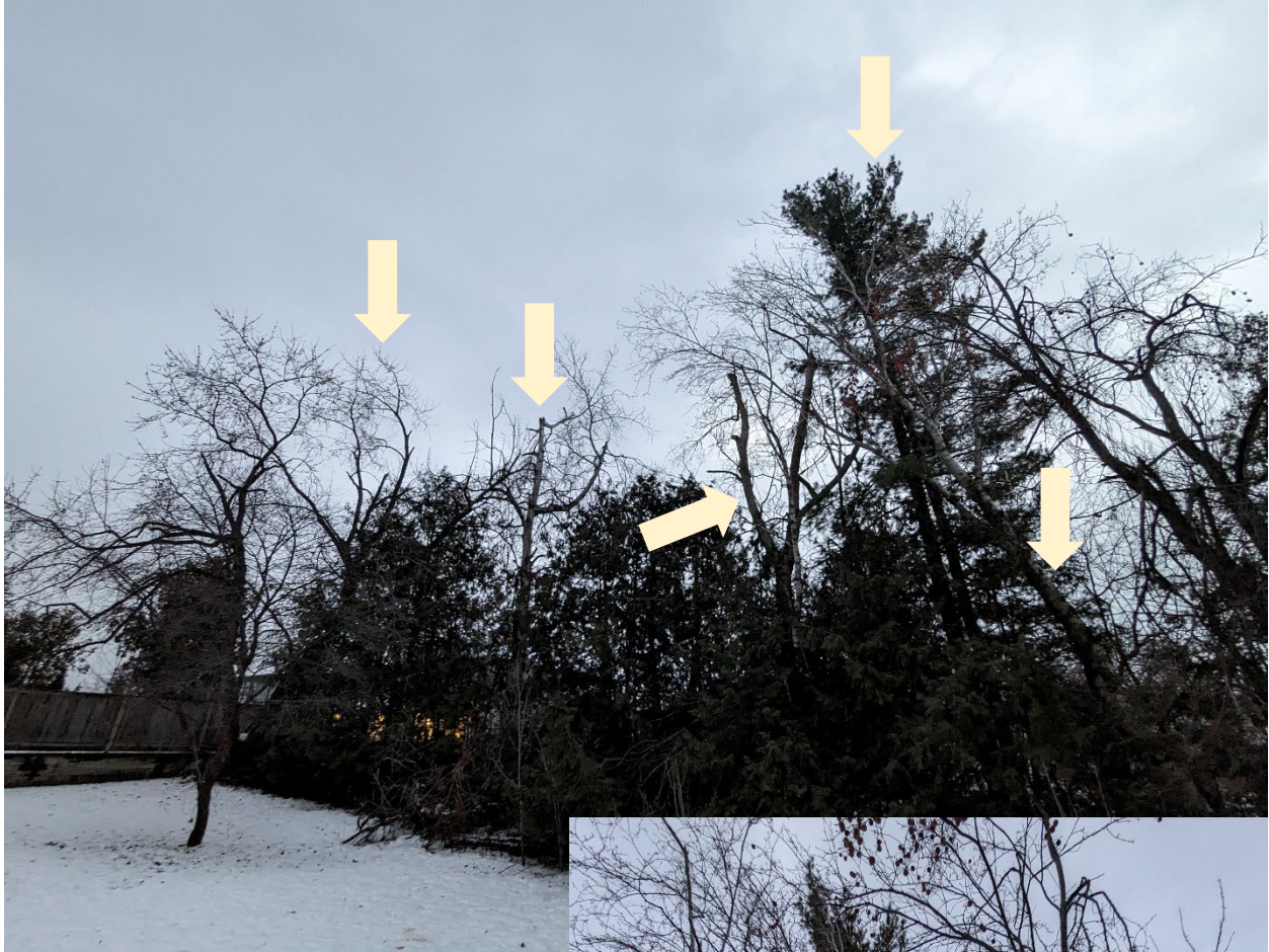
Above: (arrows right to left) Trees 2, 4, 3, 5 and 6.