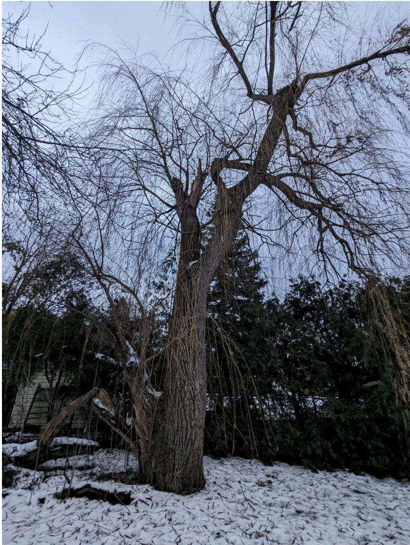
Tree 1 - private willow to be retained.