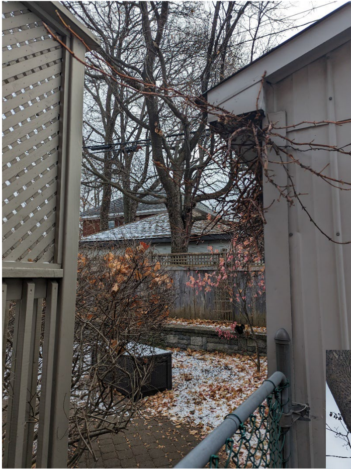
Above: Tree 1 - private maple to be retained.