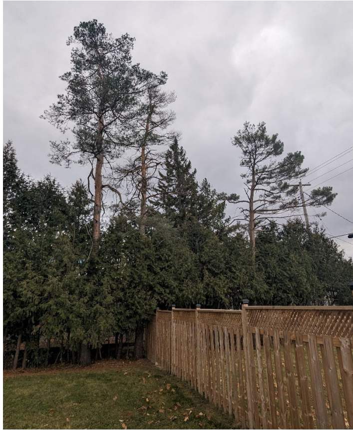
(emergent pines left to right) Trees 5-7 - Private pines to be retained.