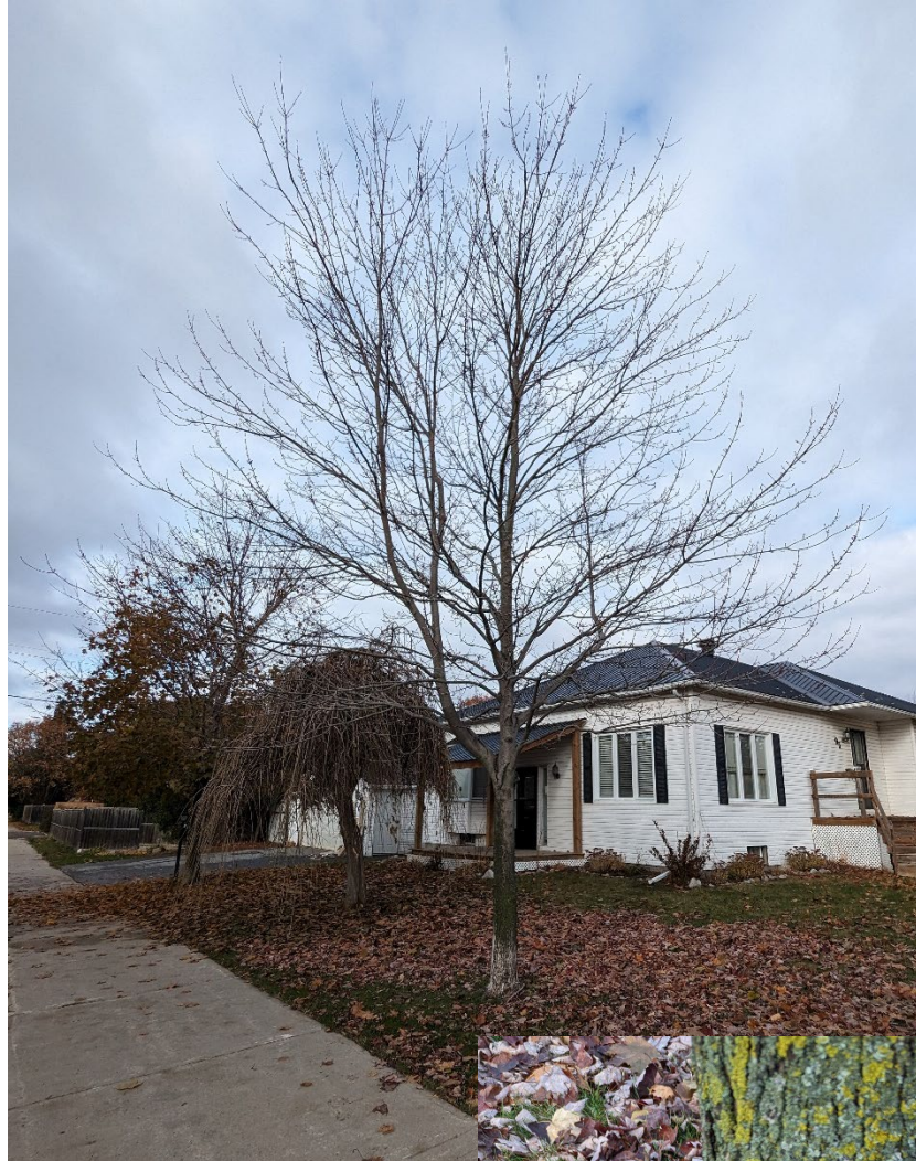
Above: Tree 5 - city maple to be retained.