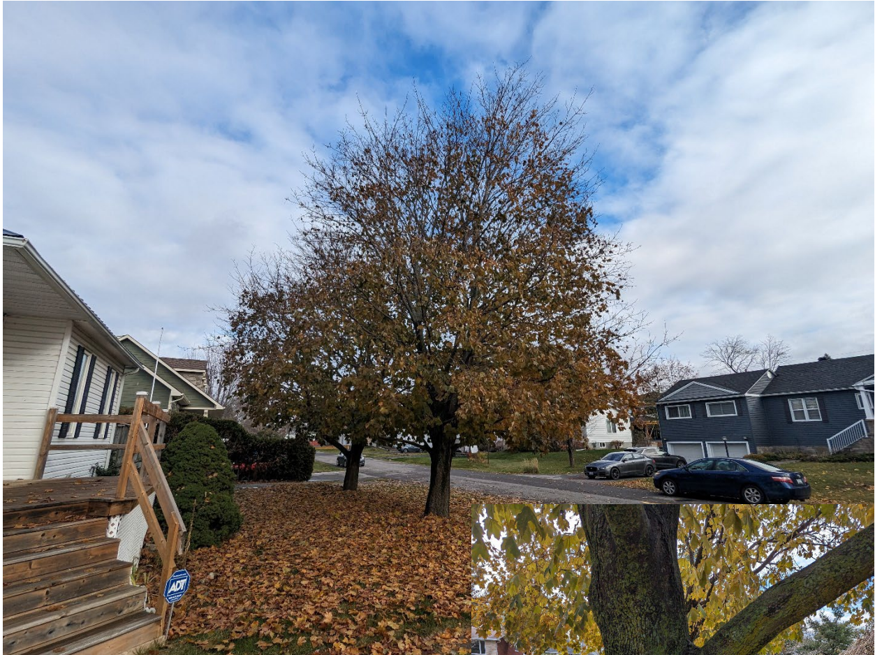
Above: Tree 1 and 2 in the front yard of the subject property.