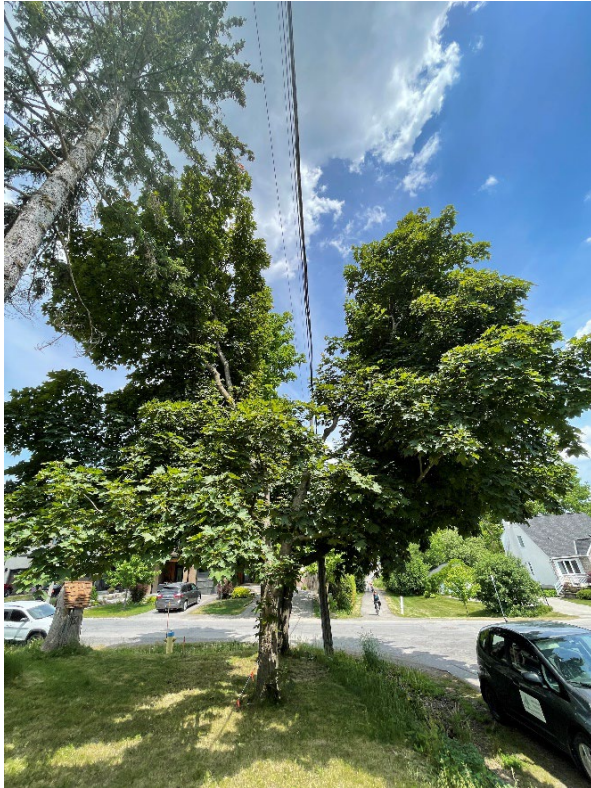
Figure 3: Tree 2, city owned Norway maple to be retained