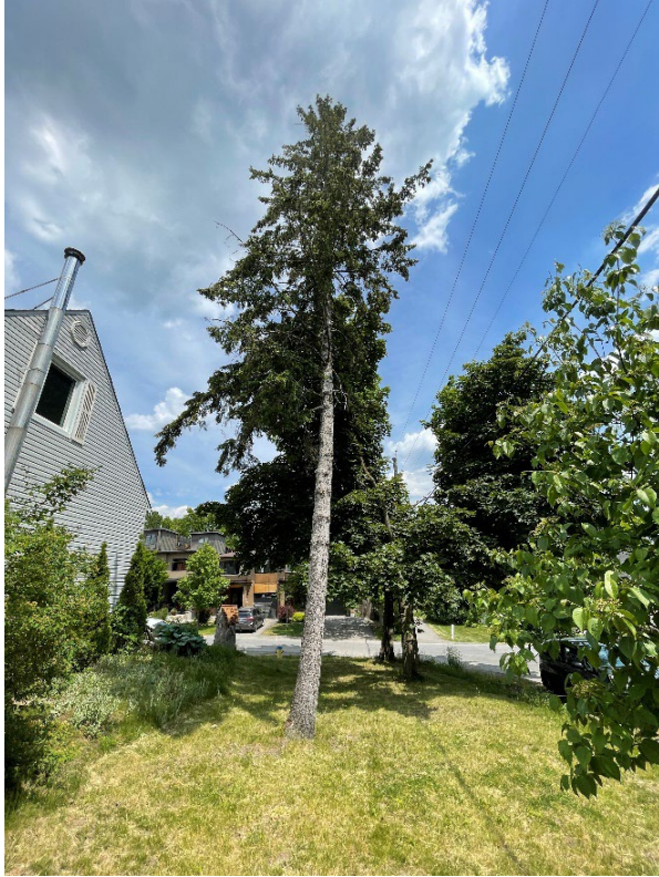
Figure 4: Tree 3, city owned white spruce to be retained