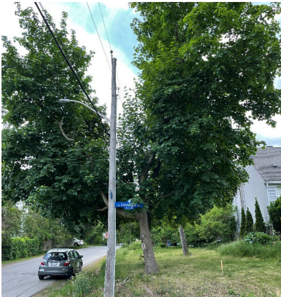
Figure 1: Tree 1, city owned Norway maple to be retained