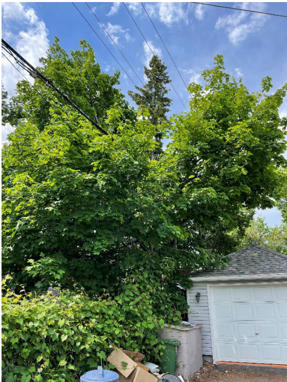
Figure 7: Tree 6, Norway maple on adjacent property at 836 Tavistock