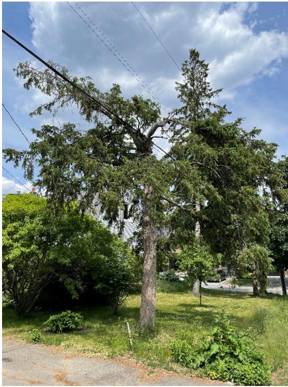
Figure 6: Tree 5, city owned white spruce in poor condition