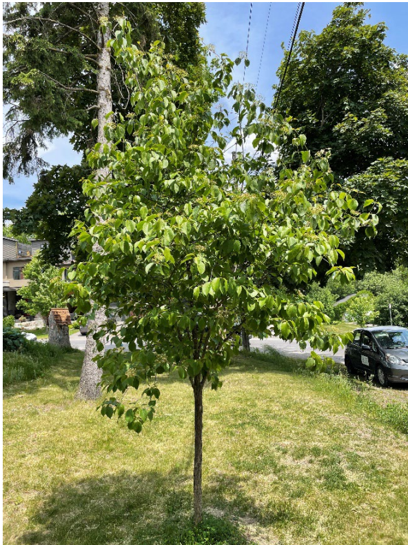
Figure 5: Tree 4, city owned Viburnum