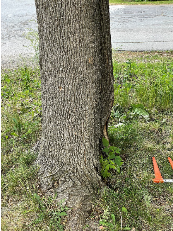
Figure 2: Canker at base of tree 1