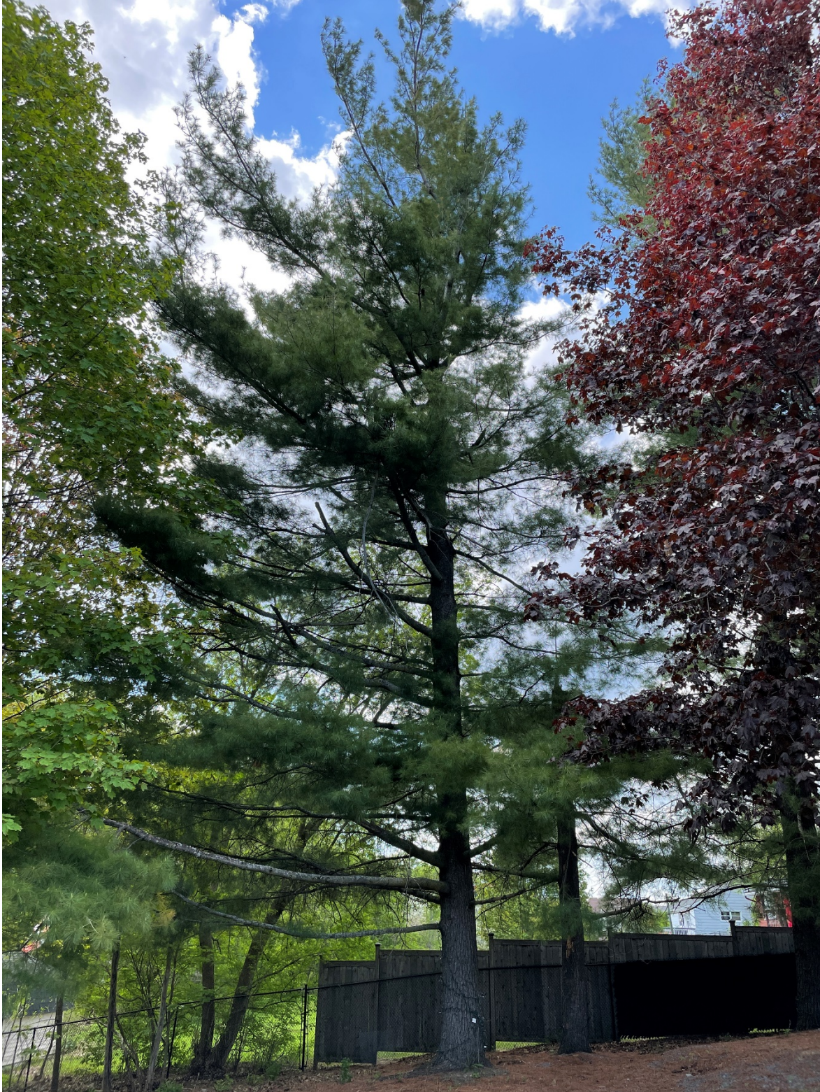
Figure 2: Tree 2, white pine to be retained