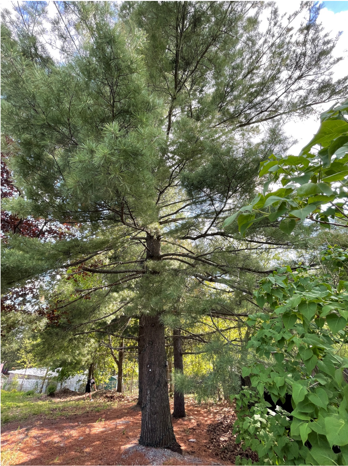
Figure 1: Tree 1, white pine to be retained