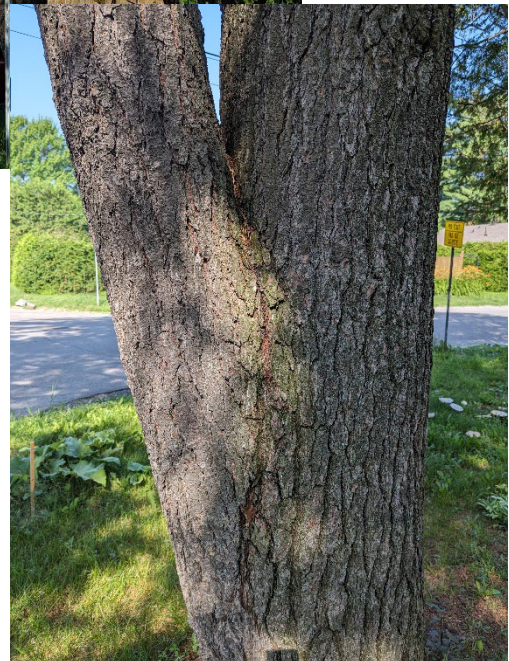
Right: seam at main union of Tree 3.