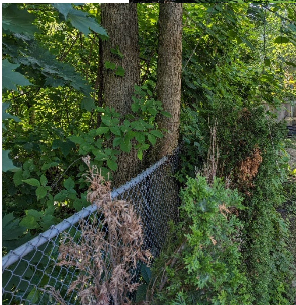
Above: Tree 7 (left) and Tree 8 (right) - NCC elms to be retained.