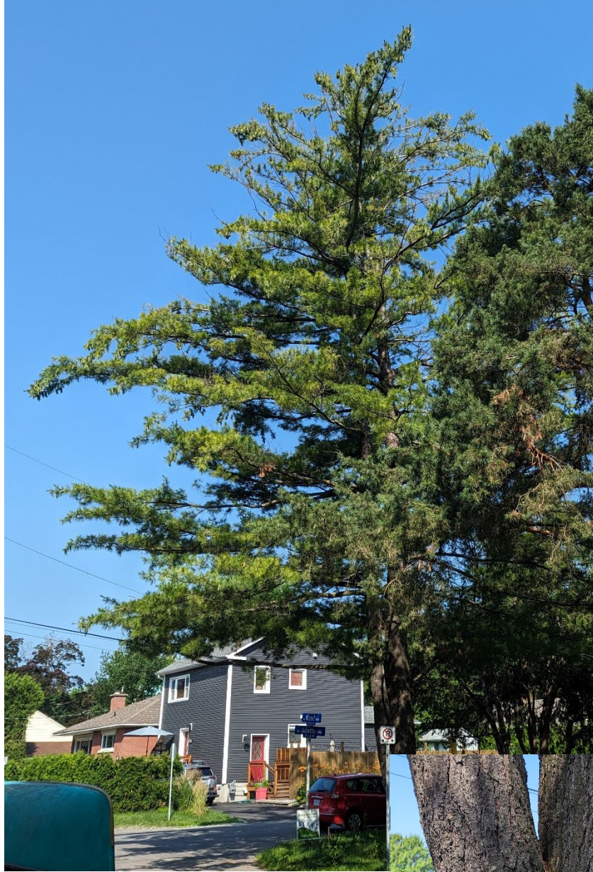
Above: Tree 3 - City pine to be retained.