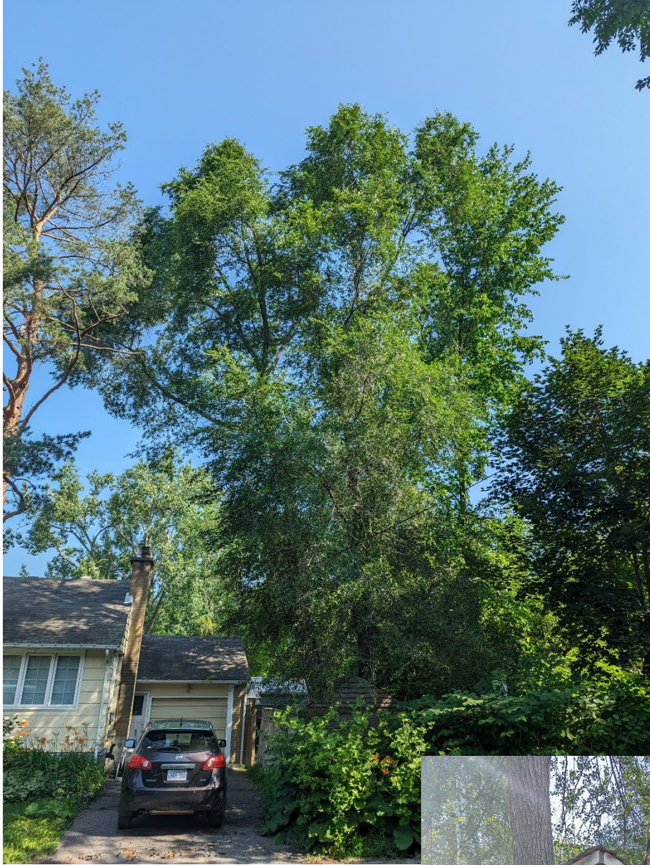
Above: Tree 5 and 6 - private Siberian elms to be retained.