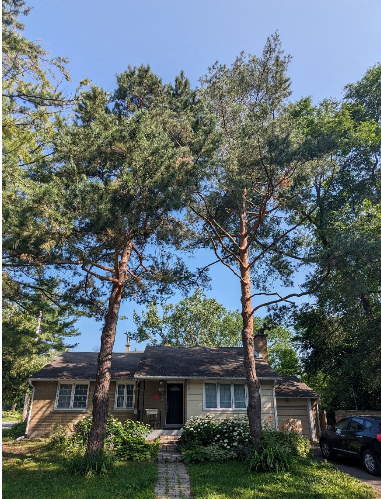
Tree 1 (right) and Tree 2 (right) - Private pines to be retained.