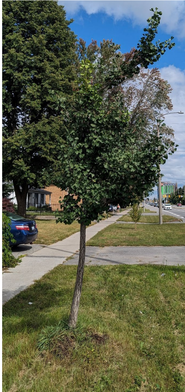
Tree 2 - City ginkgo to be retained.