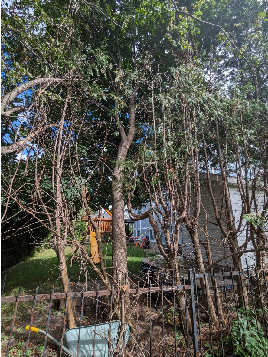
Tree 1 - Adjacent maple and cedar stems to be retained.