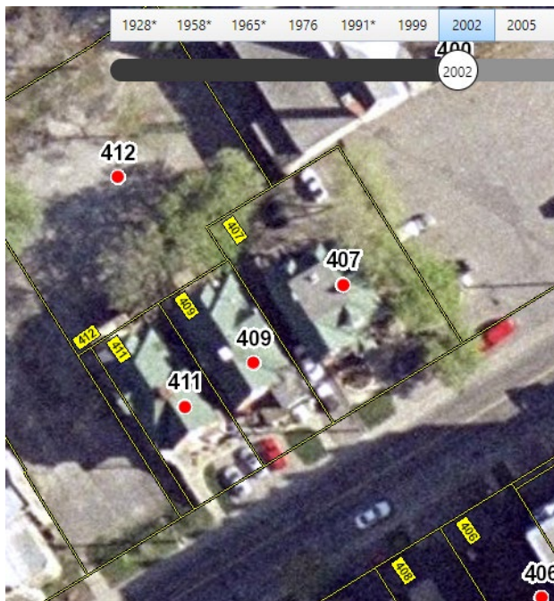
Figure 2: 2002 conditions (post conversion to low-rise apartments) demonstrating the front yards largely replaced with hard landscaping.

110 Laurier Avenue West, Ottawa ON K1P 1J1 110, av. Laurier Ouest, Ottawa (Ontario) K1P 1J1