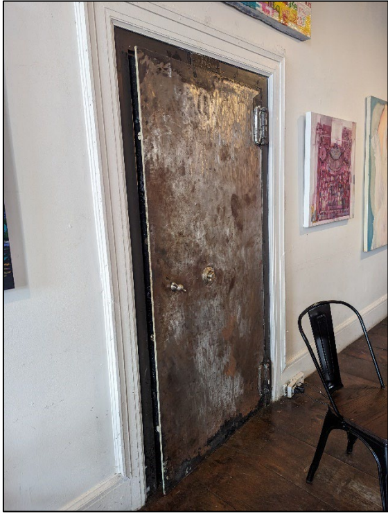
Top photo: Front elevation of 290 City Centre Avenue; bottom photos: Interior central hall plan and JJ Taylor vault.