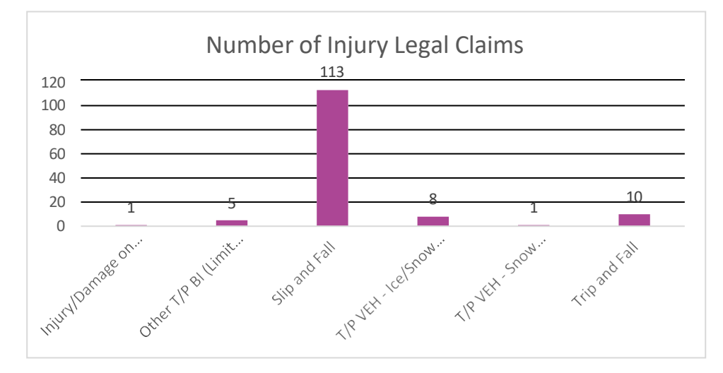
Figure 6: Number of Legal Claims

Ottawa, like many municipalities, spends a significant amount of resources dealing with legal claims. The majority of claims between 2016 and 2020 involved slip and fall accidents with a total of 113 (Figure 6: Number of Legal Claims). Similarly, the majority of the legal cost to the City is from these slip and fall accidents at over $2.2 million dollars (Figure 7: Legal Claim Costs).