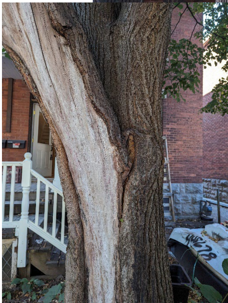
Above: Tree 1 (right) and Tree 2 (left) - City lindens to be retained.