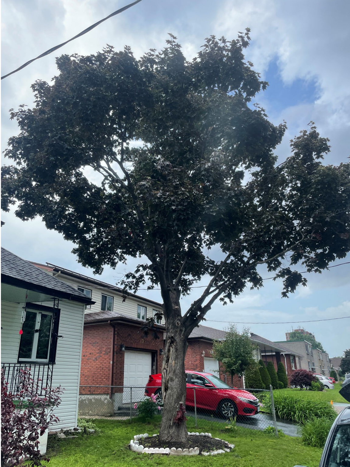
Figure 1: Tree 1, privately owned Norway maple to be removed