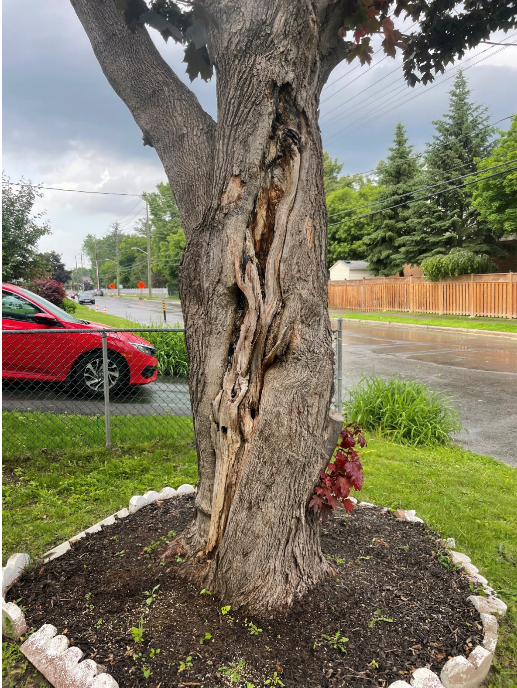
Figure 2: Tree 2, old branch attachment wound on trunk of tree 1 measuring 2 m high and 27 cm at widest point