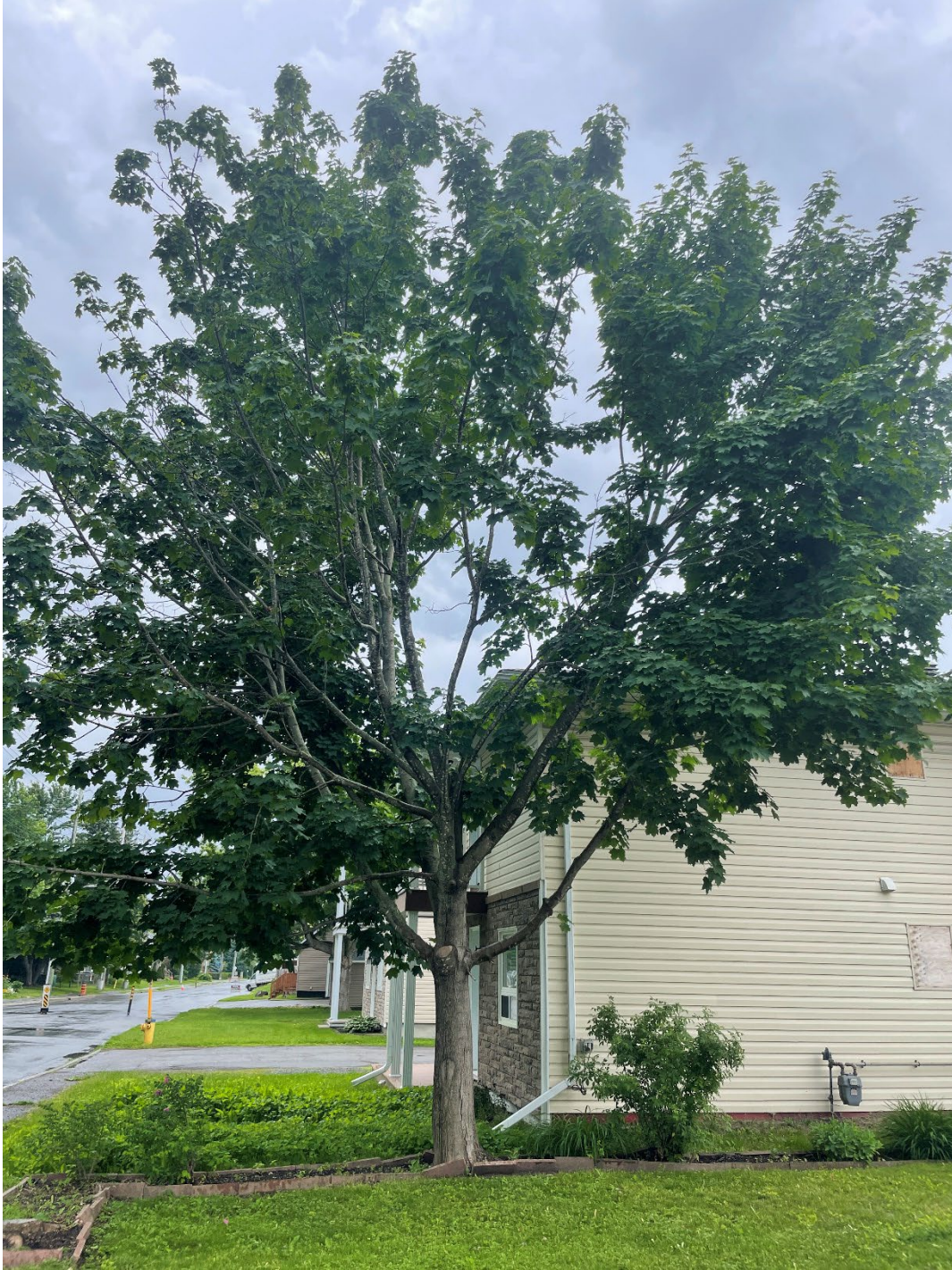
Figure 3: Tree 2, jointly owned Norway maple to be removed