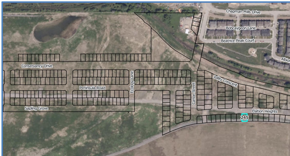
Figure 1: Location of lot 245 in the Conservancy Subdivision

The property is municipally known as 519 Elation Heights and is located in the Barrhaven West Ward of the City of Ottawa. The property is legally described as Lot 245 on Plan 4M-1736. The property is a rectangular shaped lot with a total area of 322.5 square metres and a frontage on Elation Heights. Figure 1 shows the location of the lot within The Conservancy Subdivision and is underlaid by 2022 aerial imagery from GeoOttawa.