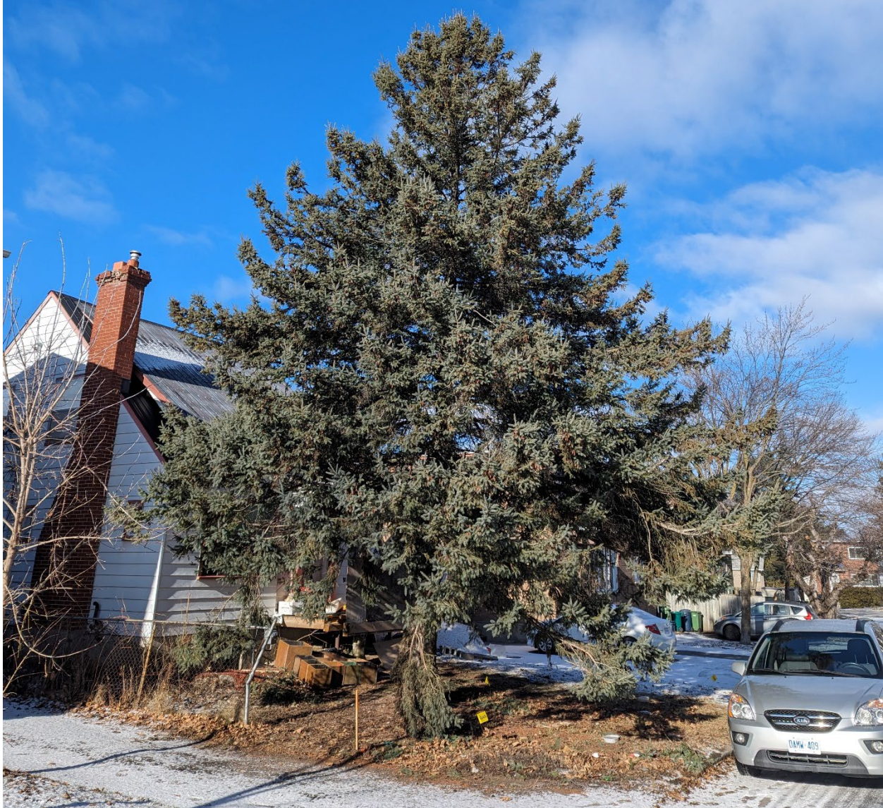
Tree 1 - private spruce to be removed