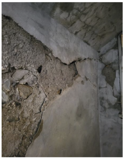
Foundation Wall Deterioration