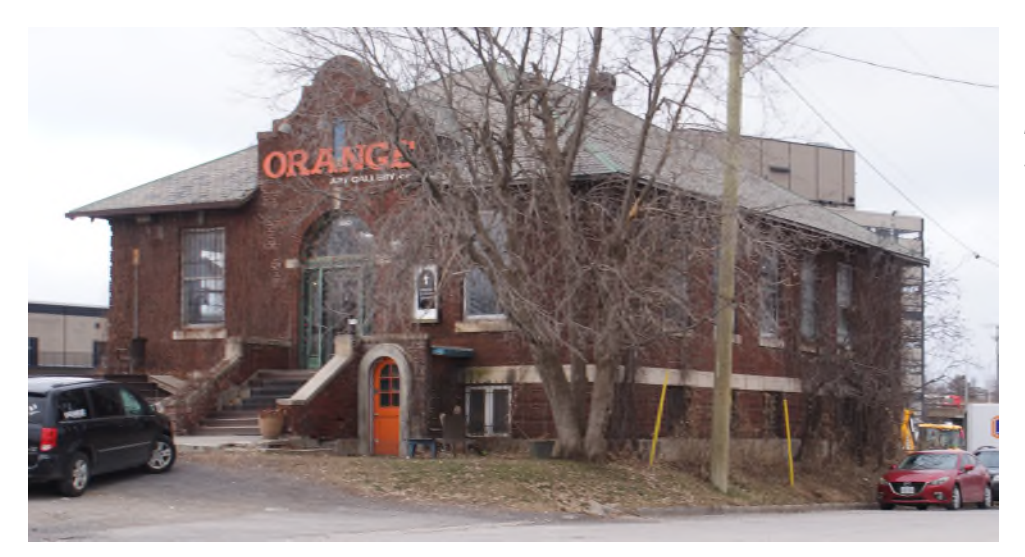
Figure 3: View looking north-west of the principal façades south and east elevations illustrating the landscape character surrounding the building.