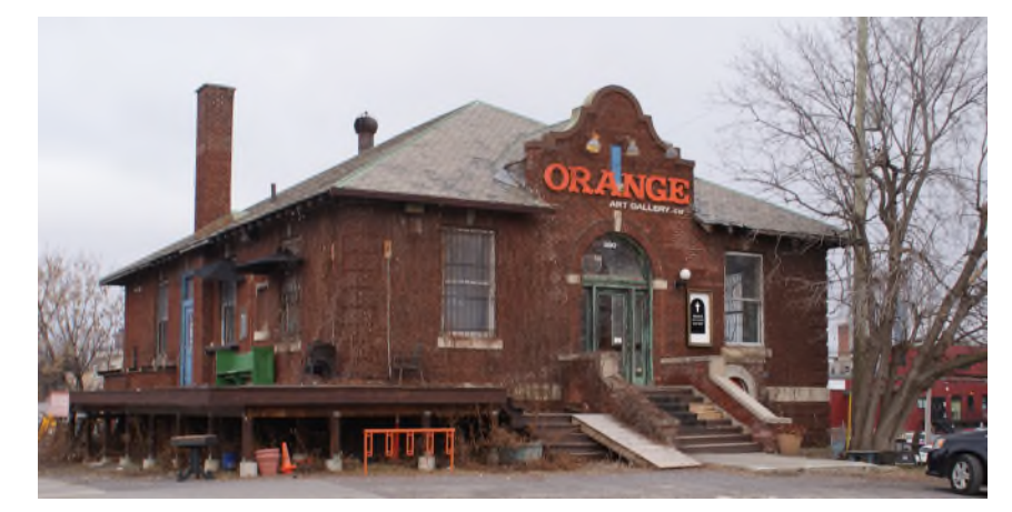
Figure 5: View looking north-east to the south and west elevations.