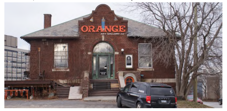
Figure 4: View of the principal façade / south elevation. The set of steps and wood deck to the left of the entrance steps were introduced within the last 10 years as part of an art gallery and event space.

The moderately pitched hipped roof is clad in slate, with exposed eaves and rafter tails. A hipped roofed dormer is located centrally on the north elevation. The entrance features a curvilinear brick Dutch gable pediment extending above the roof level, with architectural pre-cast stone caps. The entrance door features a semicircular transom with flanking sidelights. A small flat roofed brick basement access enclosure is set to the east of the entrance steps and features a semicircular architectural pre-cast stone lintel. The only alteration evident are a modern wood deck supported on wood piers set on sono-tube footings extending from the entrance steps on the south elevation and wrapping around the west elevation, and a window in the brick bump out on the west elevation has been bricked-in.