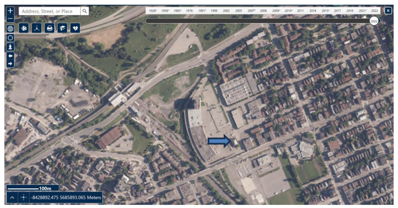
Figure 2: Aerial view of the City Centre site and surrounding context. 290 City Centre Avenue arrowed.

by a raised curb with a tubular metal railing. A mature Manitoba Maple is located at the southeast corner of the building and a shrub/tree at the north-west corner. Around the building there has been a series of grade changes, with fill material and retaining walls added, most likely in association with the bridge construction. With construction of the Somerset bridge, access shifted west of the bridge with a service lane. (see Figure 10). The address shifted to Champagne Street and with changes to the street names, it became 290 City Centre Avenue.