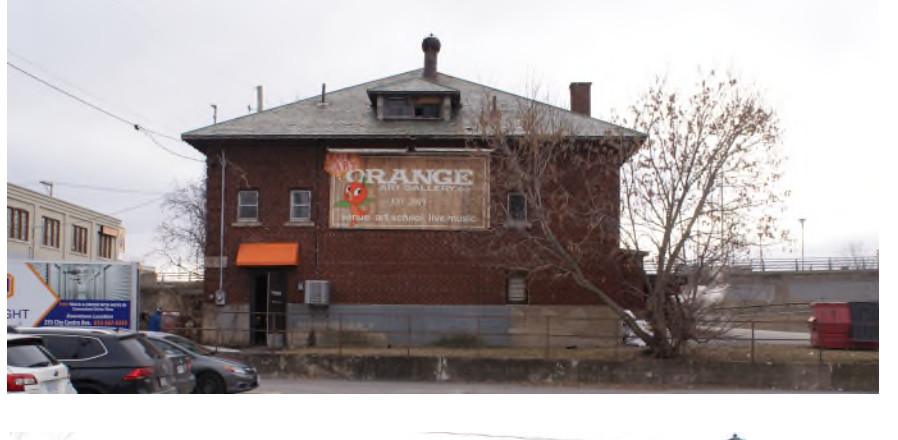
Figure 8: View of the north façade. Note the step cracking in the brickwork above the window at the north-east corner above the basement entrance. Note the grassed edge and tree.