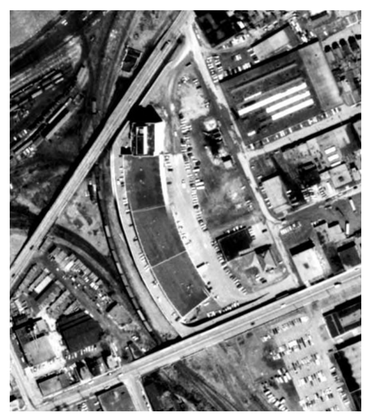
Figure 12: 1965 aerial view of the City Centre site after the site was redeveloped in 1963-64. The Somerset Bridge was completed in 1959.