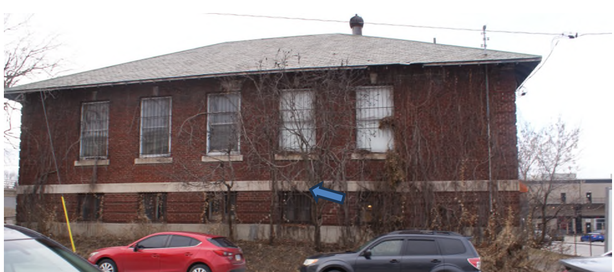
Figure 9: View of the east elevation. Note: The deflection/settlement in the string course extending from the second window from the right to the north-east corner (right corner). Stepped cracking is evident in the foundation, extending up to the windowsills through to the roof. The gauged brick forming the header above one window is missing, and brickwork at the north-east corner is displaced below the roof. Source: Commonwealth, December 2023.

Figure 8: View of the north façade. Note the step cracking in the brickwork above the window at the north-east corner above the basement entrance. Note the grassed edge and tree. Source: Commonwealth, December 2023.