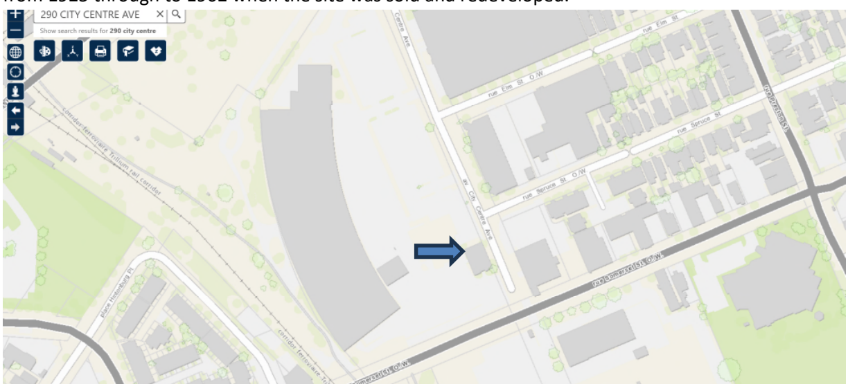
Figure 1: Block diagram of the City Centre site, with the building at 290 City Centre Avenue located at the southeast corner of the larger site identified as 250 City Centre Avenue (Arrowed).

The property at 290 City Centre Avenue is located in the Bayview neighbourhood in the block bound by City Centre Avenue (east), Somerset Street West Bridge (south), the Trillium Line (west) and Wellington Street (north). The building is located at the southeast corner of the City Centre site (250 City Centre Avenue) that was redeveloped in 1962-63. Historically, the original address was 991 Somerset Avenue, later it was Champagne Avenue, and today it is 290 City Centre Avenue. The building is the last structure remaining on the City Centre site that dates to the period when W. C. Edwards Co. operated a wholesale lumber, planing, and milling operation. The building was purpose-built as a sales and administrative office from 1925 through to 1962 when the site was sold and redeveloped.