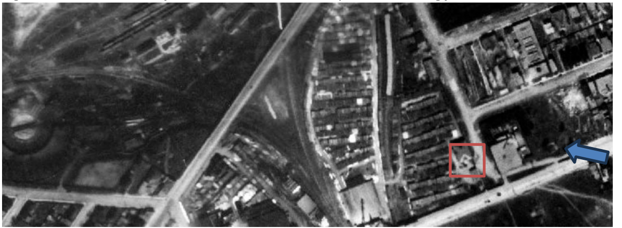
the original address of 991 Somerset Avenue. By 1928, the Somerset bridge blocked direct access from Somerset, with the entrance coming off a laneway that connected with City Centre Avenue. (arrowed). Note the piled lumber surrounding the building at 290 City Centre Avenue, formally 128 Champagne Avenue (Arrowed). The planing mill is to the west, Source: Geoottawa

The history of the site is outlined in the SCHV. The following aerial views and fire insurance plans provide a sense of the physical development of the City Centre site during the period when the W. C. Edwards Company operated a wholesale lumber and planing mill business on the site through to 1920-22 and subsequently under different ownership through to 1962. In 1962, the site was subdivided and a 6 acre parcel on the west side was sold, and the present City Centre building completed in 1964. Fire Insurance maps from 1901 document the earliest bridge. Over time, the bridge was extended, and the iron superstructure replaced with reinforced concrete. The Somerset Street Bridge was completed circa 1959. Figure 10: 1928 aerial view of the W. C. Edwards Co. lumberyard. The building fronted on to Somerset Street, with