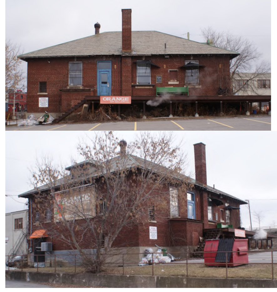
Figure 6: View of the west elevation. The architectural pre-cast stone string course and rusticated brick finish below extends to the small brick basement bump out. Source: Commonwealth, December 2023.

Figure 7: View looking southeast to the west and north façades. The retaining wall and tubular metal railing would appear to date to the early 1960s site development. Note the grassed area. Source: Commonwealth, December 2023.