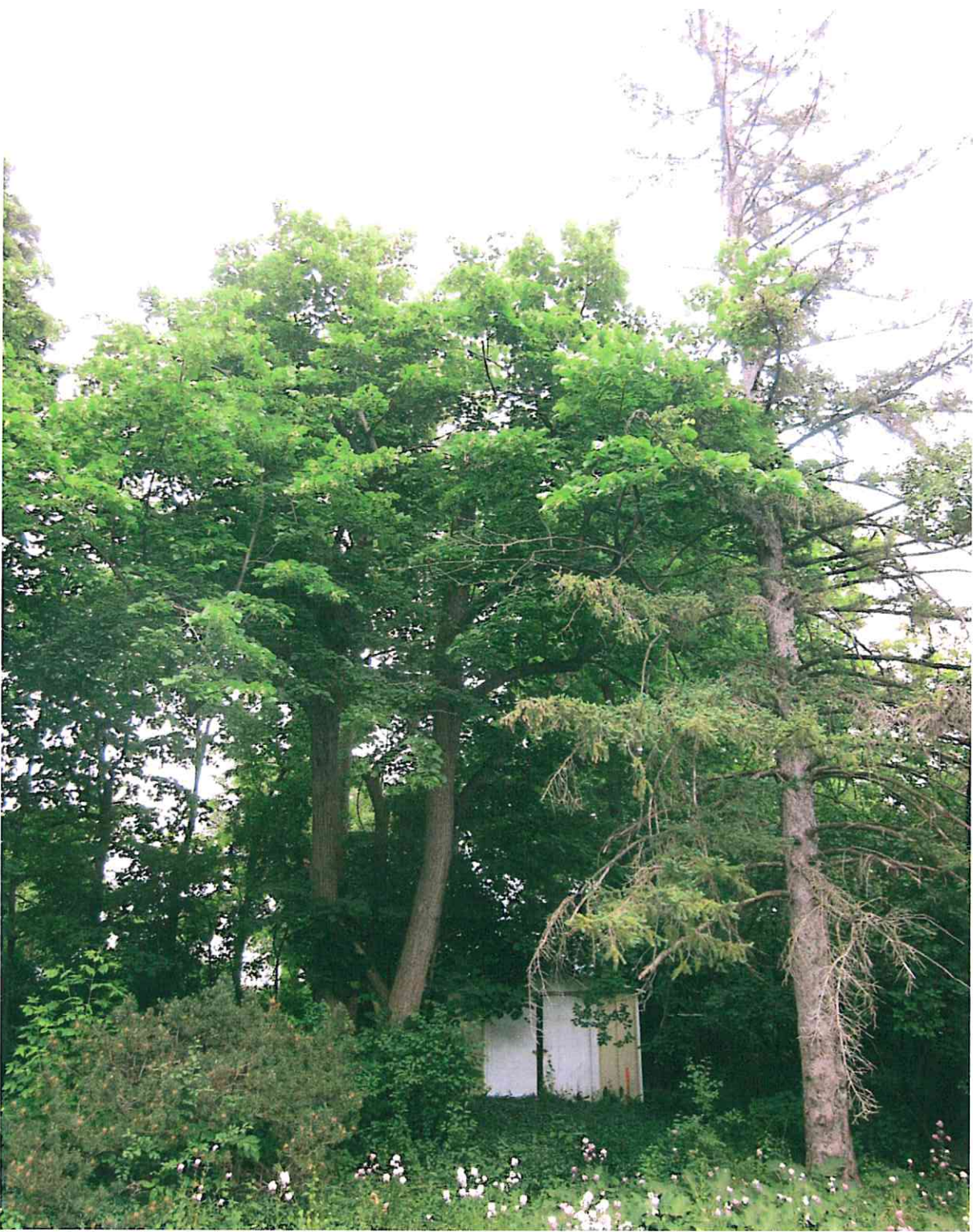
Picture 1. Trees #1 and 2 (right to left), private spruce and basswood trees at 113 Northwestern Avenue