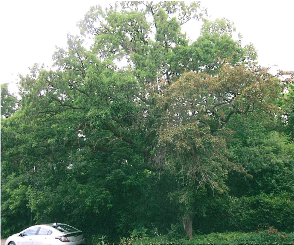
Picture 4. Tree #7, neighbouring bur oak at 113 Northwestern Avenue (crab apple in foreground is less than 30cm DBH so not distinctive)