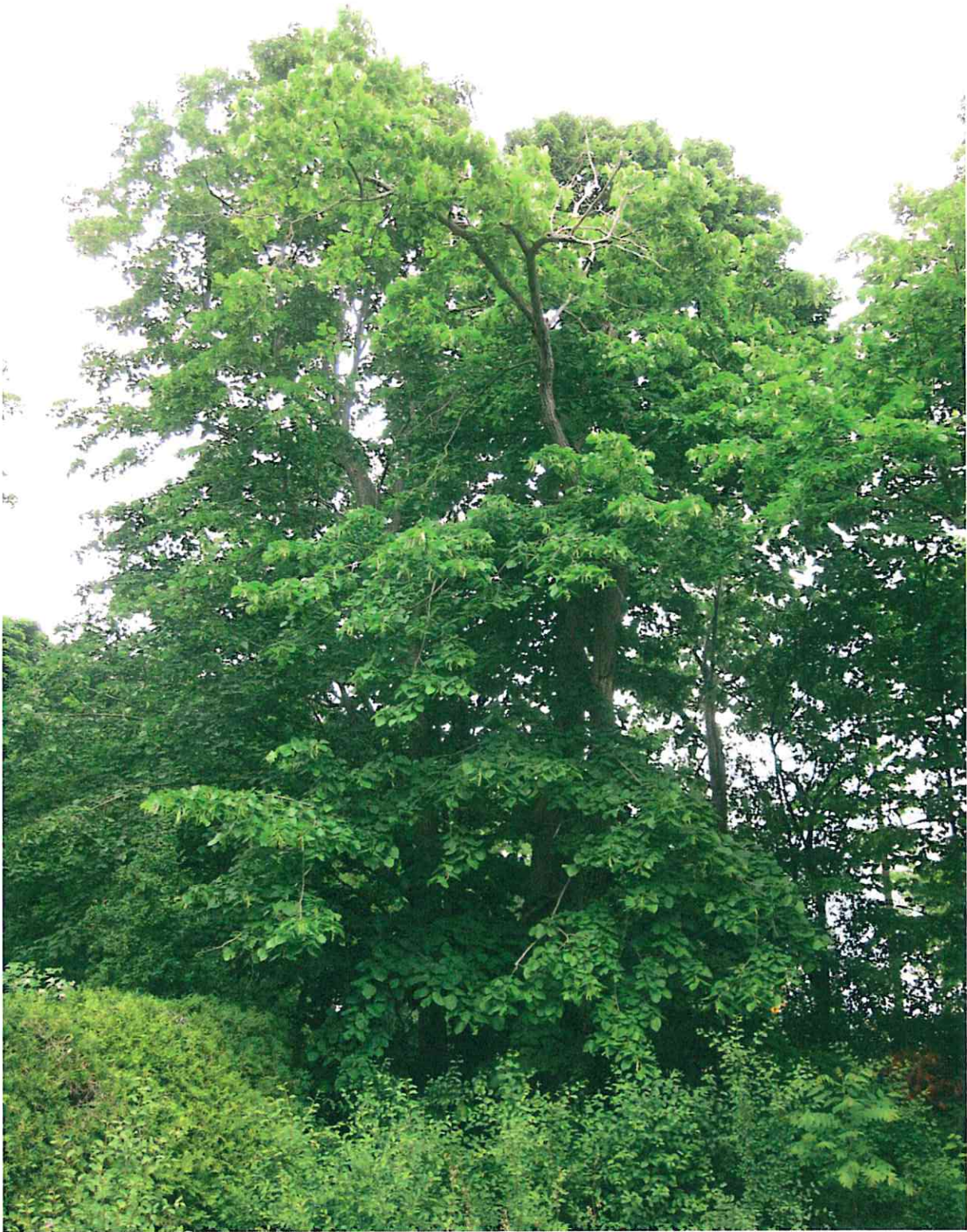
Picture 2. Trees #3 and 5 (right to left), private basswoods at 113 Northwestern Avenue