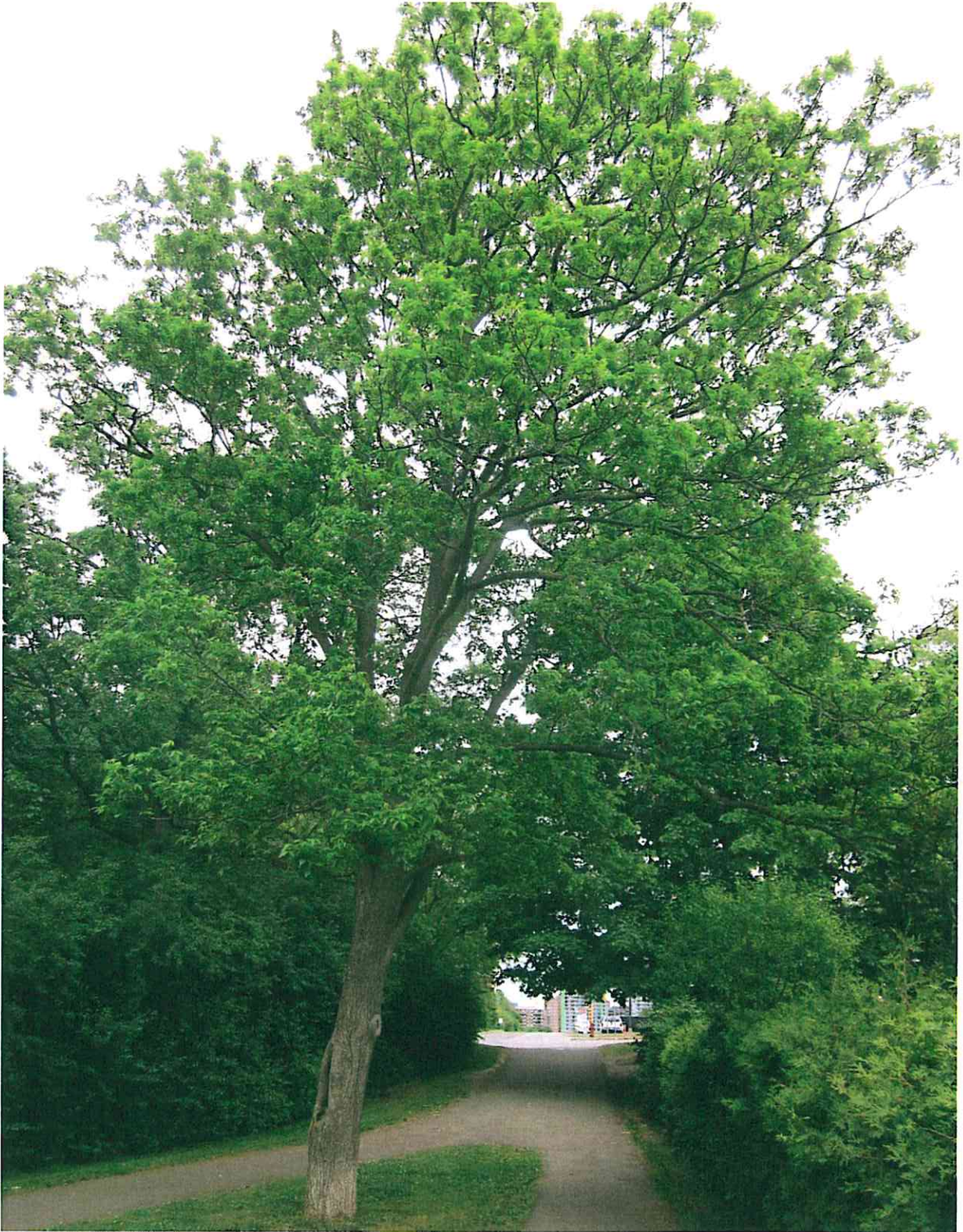
Picture 3. Tree #6, neighbouring bitternut hickory at 113 Northwestern Avenue (note asphalt pathway to right)