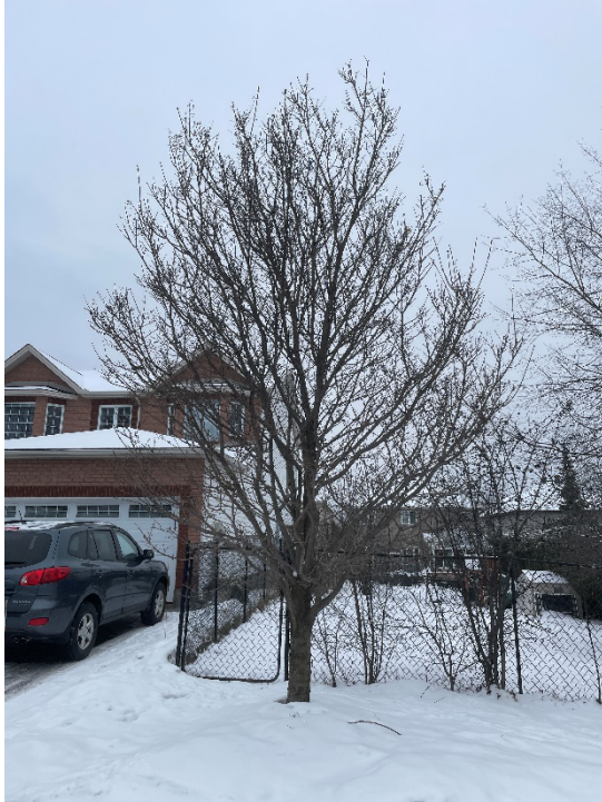
Figure 3: Tree 3, city Japanese lilac to be removed