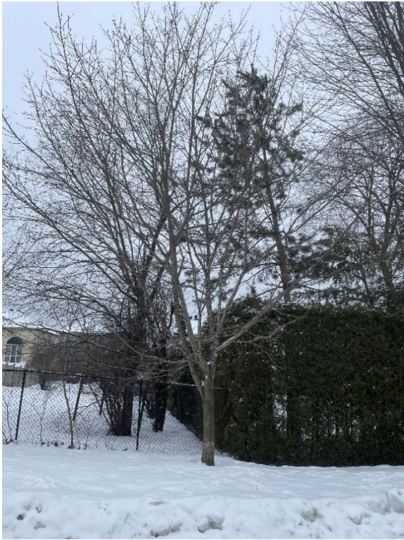
Figure 1: Tree 1, city Norway maple to be retained