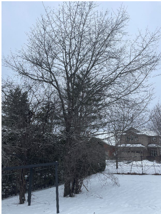
Figure 4: Tree 4, private black cherry tree to be removed