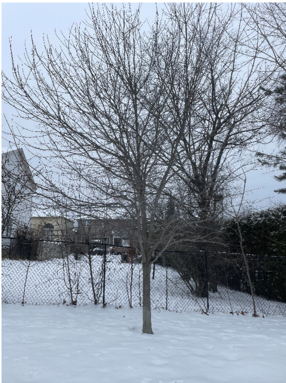
Figure 2: Tree 2, city Freeman maple to be removed