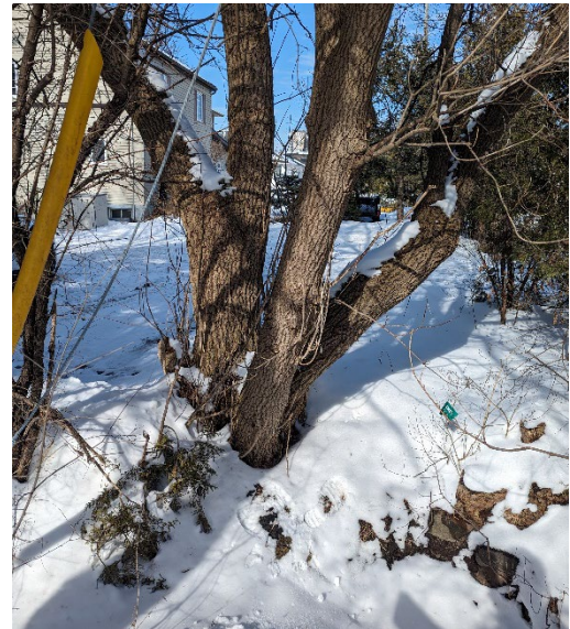
Clockwise from above: clump of lilacs and Tree 10 and 11 - city trees to be removed.