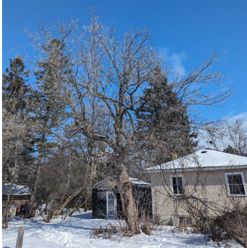
Clockwise from above: Tree 9 - private Manitoba maple in poor condition to be removed.