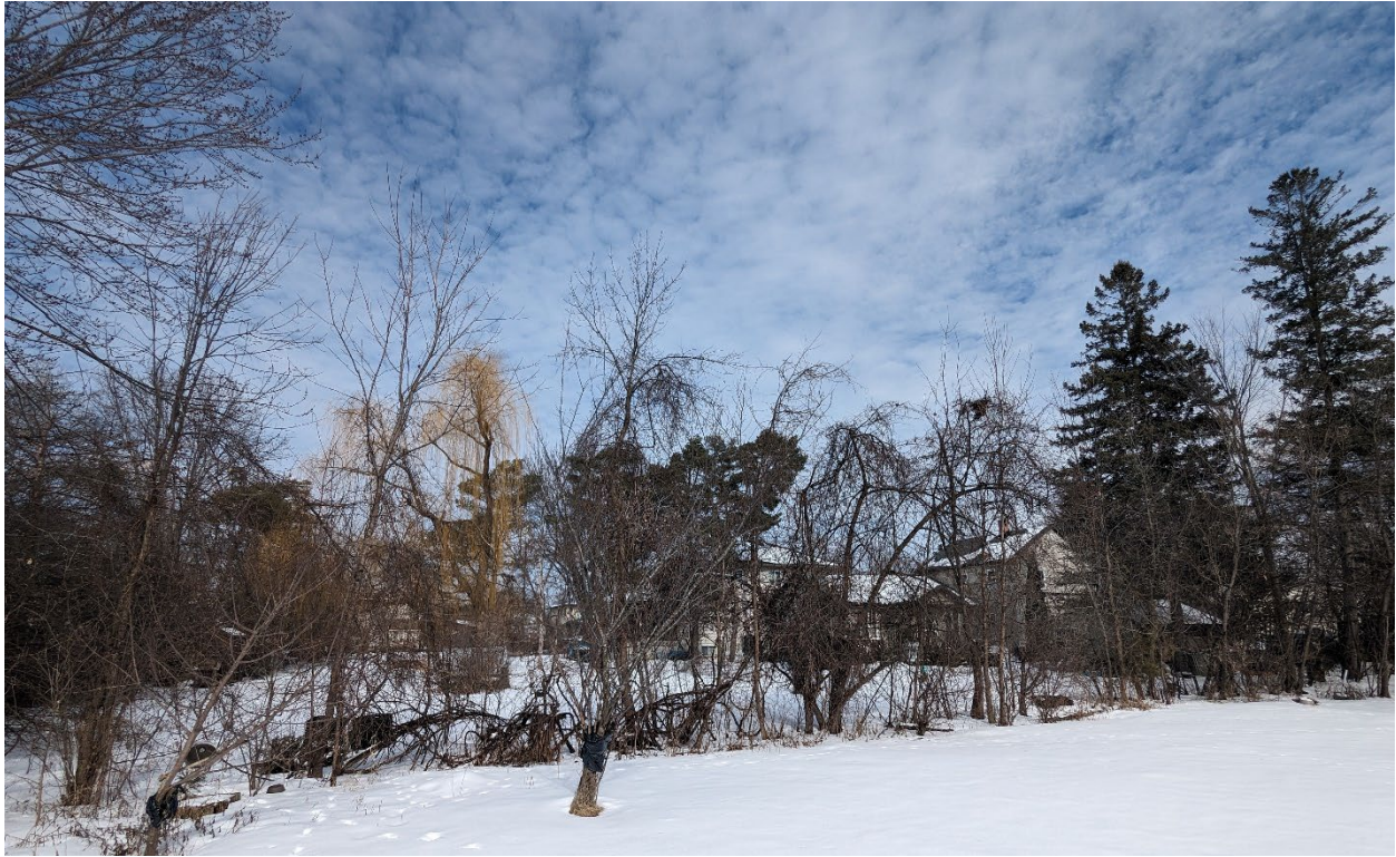
Above: Trees along the south property line - largely unmaintained and in poor condition.