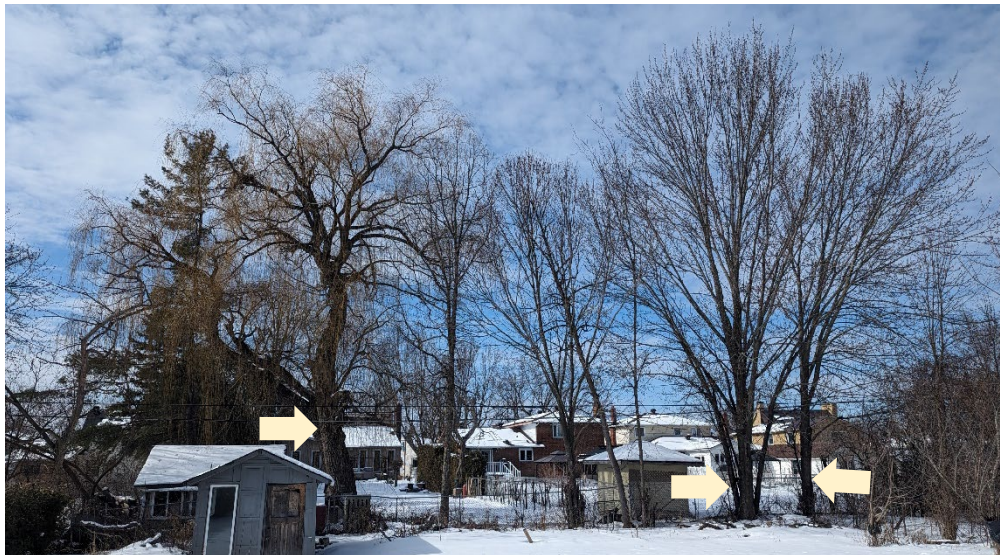
Trees along the rear property line. Tree 3 (left) - adjacent willow to be retained. Trees 4 and 5 (right) - private red maples to be removed.