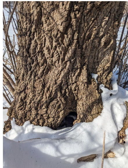
Decay on the stem of Tree 9.