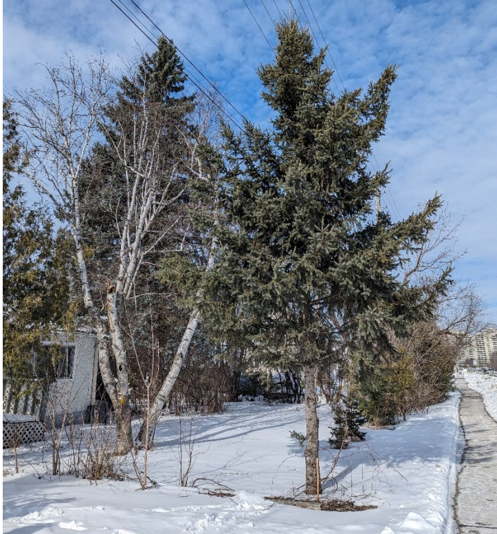
Tree 1 (right) - city spruce to be retained, and Tree 2 (left) - private birch to be removed.