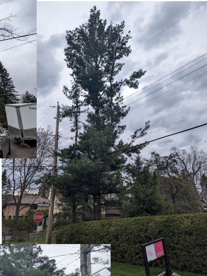
Below: (right to left) Trees 2-5 - city trees to be retained.