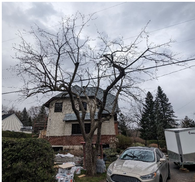
Above: Tree 1 - City crab apple to be retained.