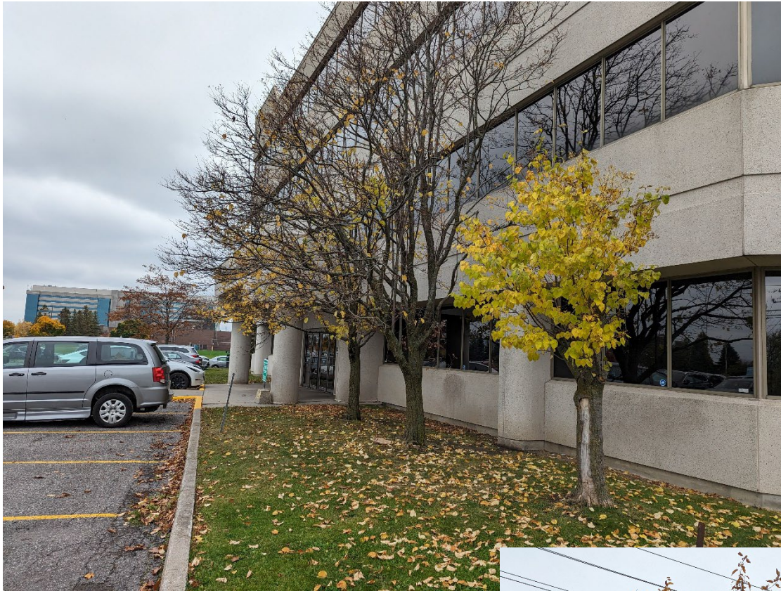
Above: (right to left) Trees 30-32 - private tree lilacs.