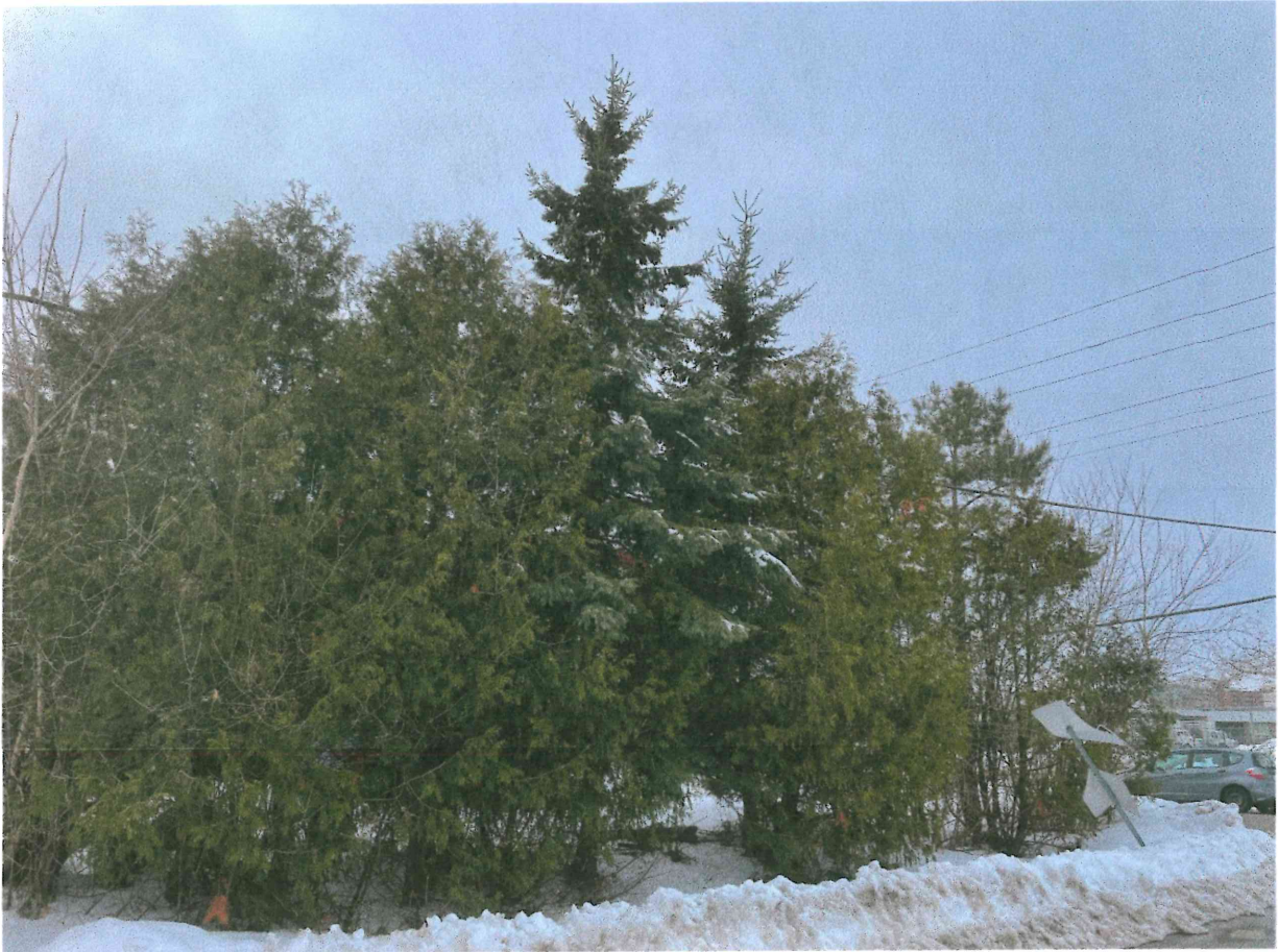
Figure 1: Tree 1 and 2, city white spruce (between cedar hedges) to be retained