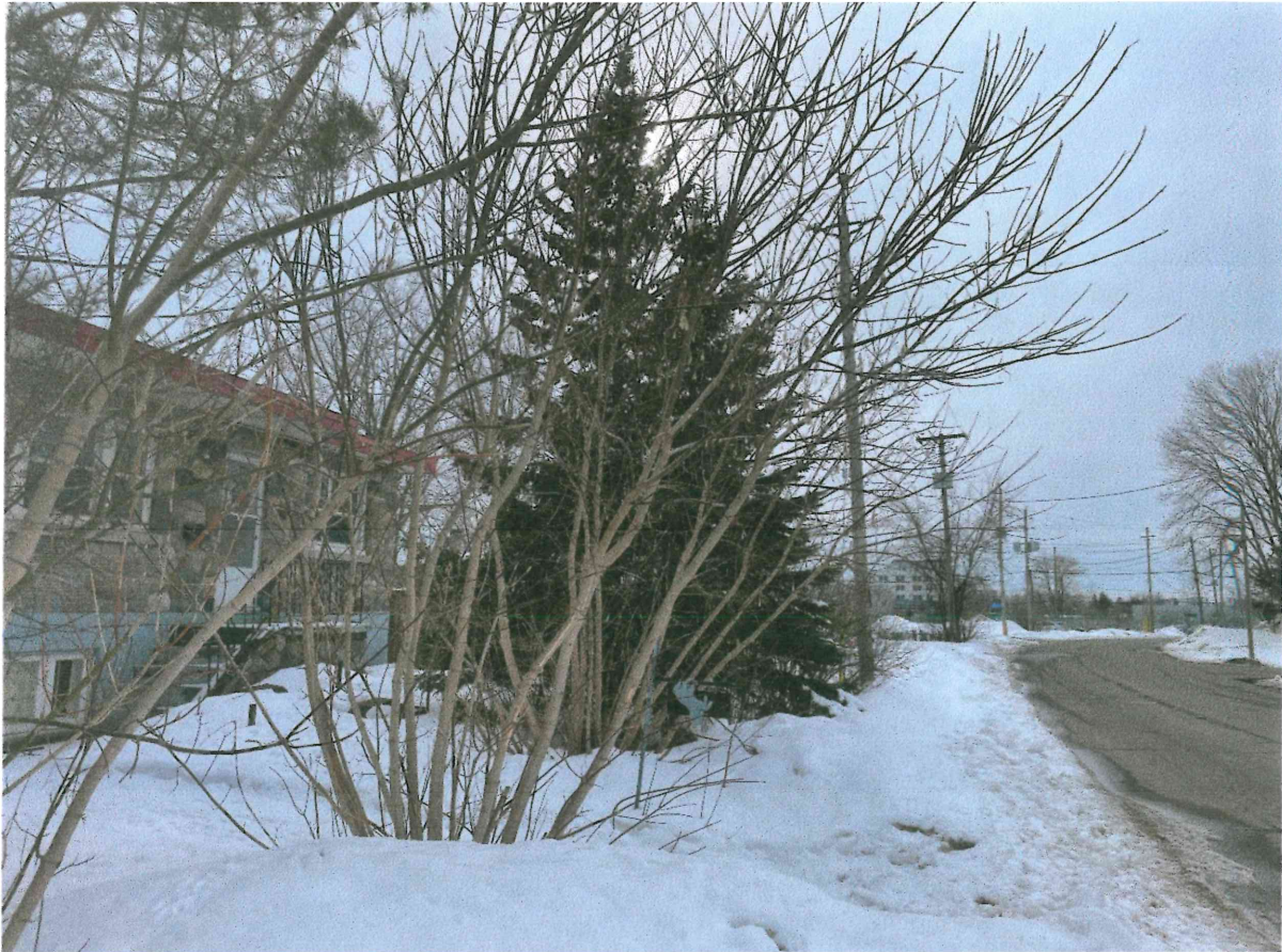
Figure 2: Example of clump of Norway maples found along the city boundary