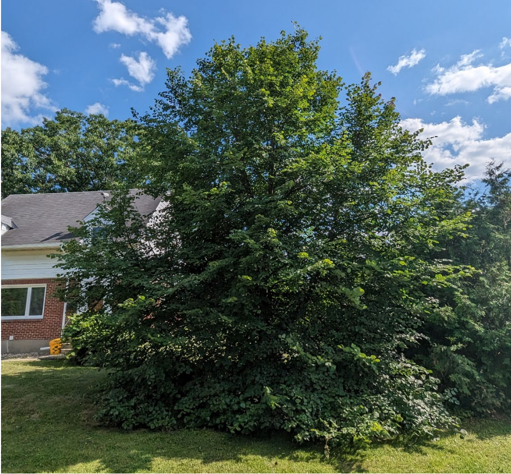
Tree 4 - private linden to be retained.