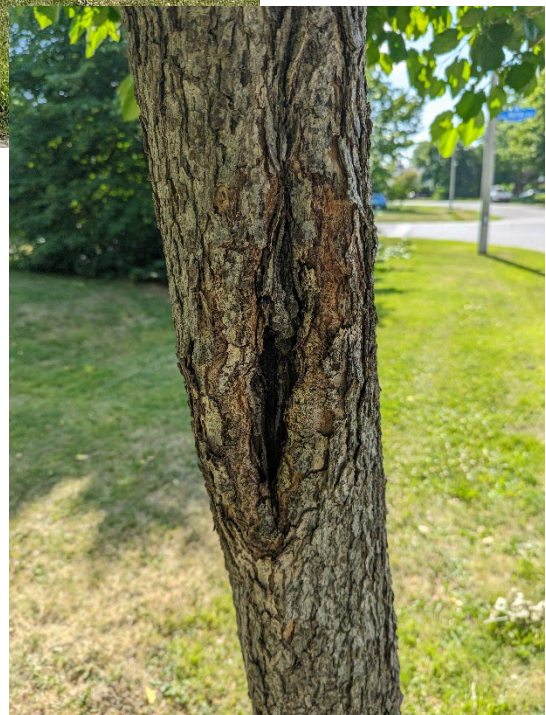
Right: wound with decay on stem of Tree 1