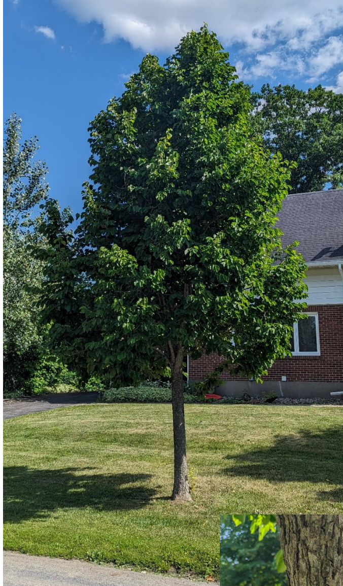
Above: Tree 1 - City Turkish hazel to be retained