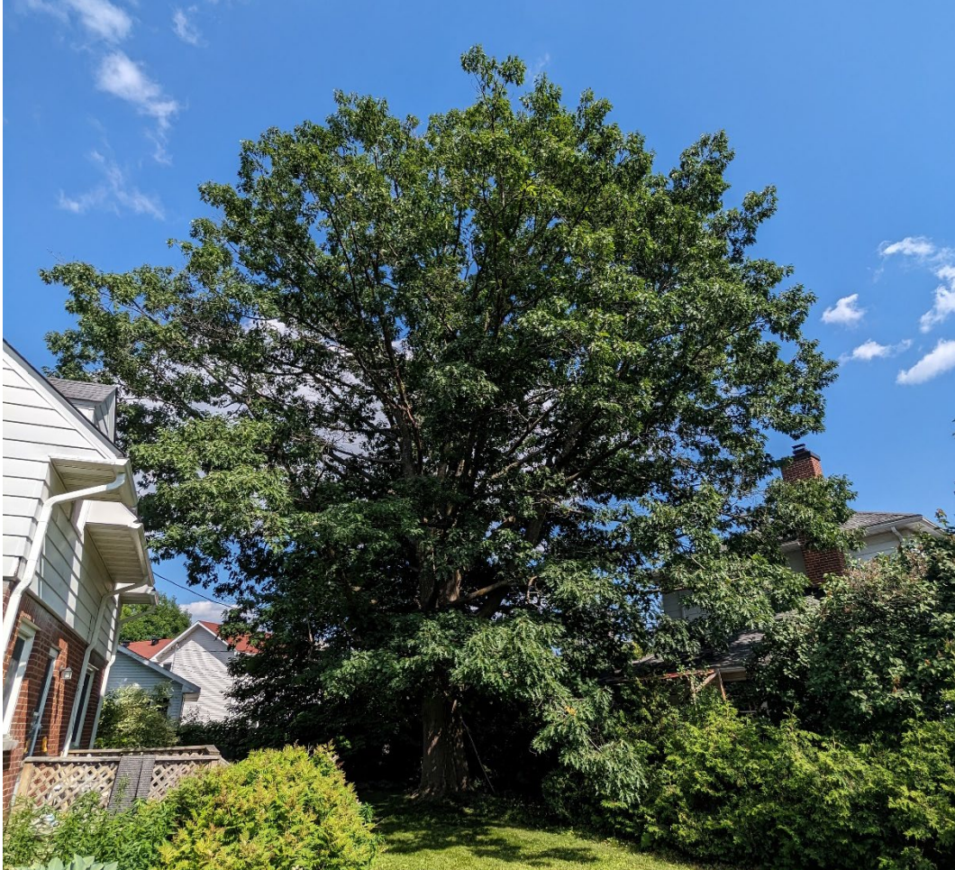
Tree 2 - private red oak to be retained.