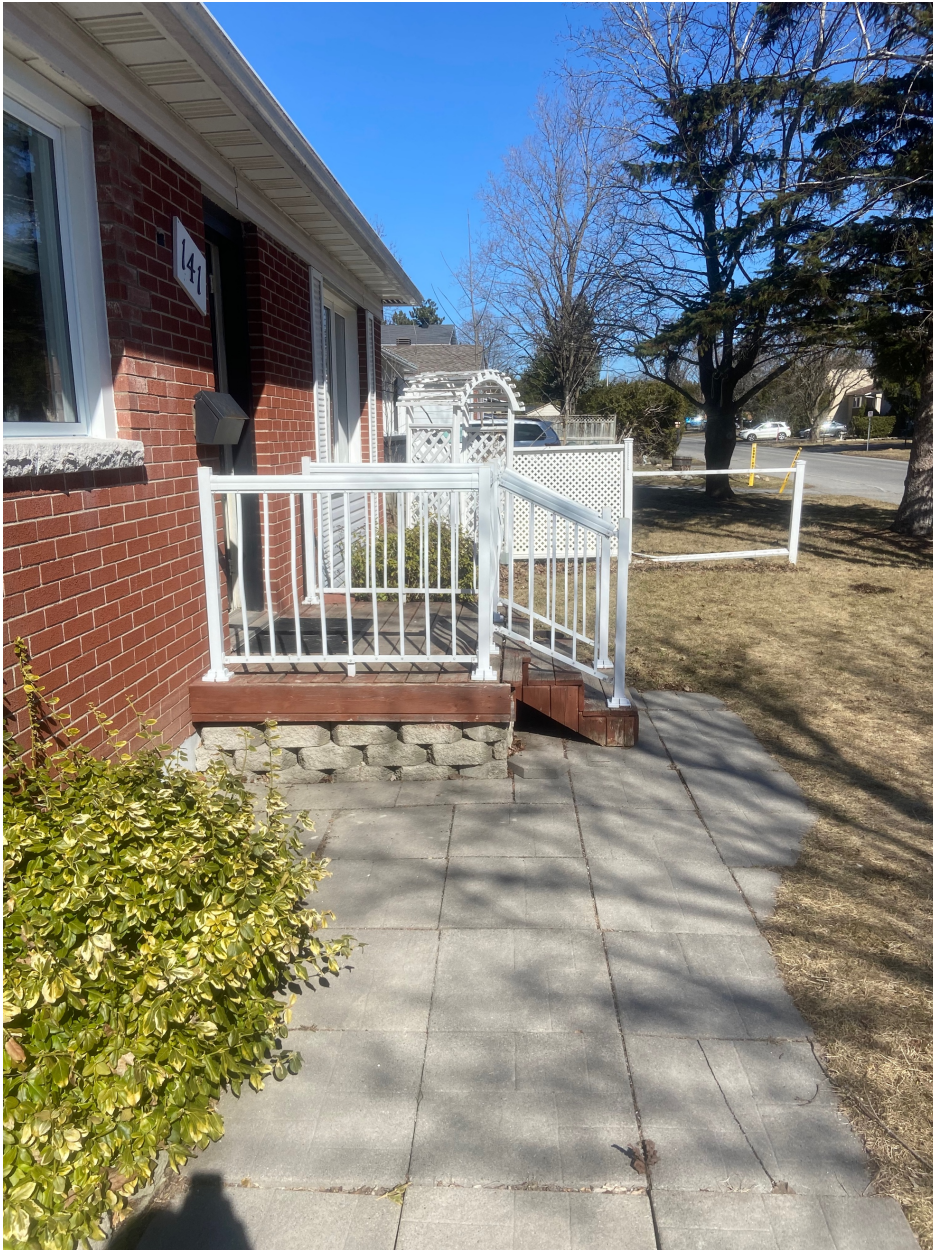
Image 1. Existing front steps.