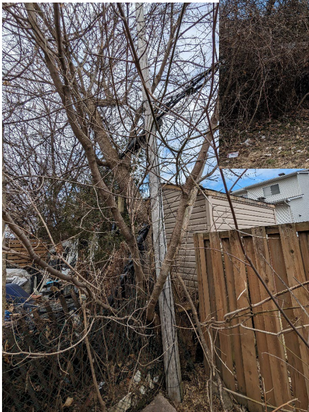
Above left: Tree 2 - adjacent red maple to be retained.