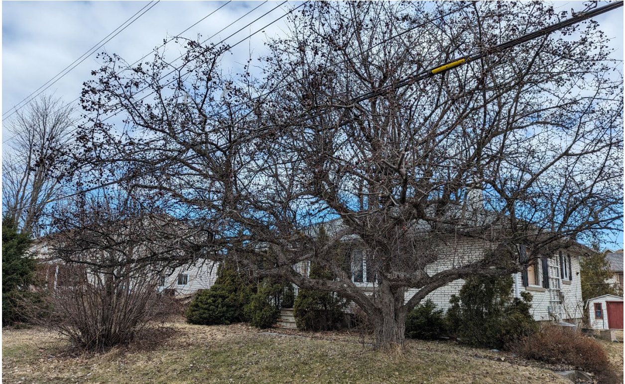
Tree 1 - private crab apple to be retained.