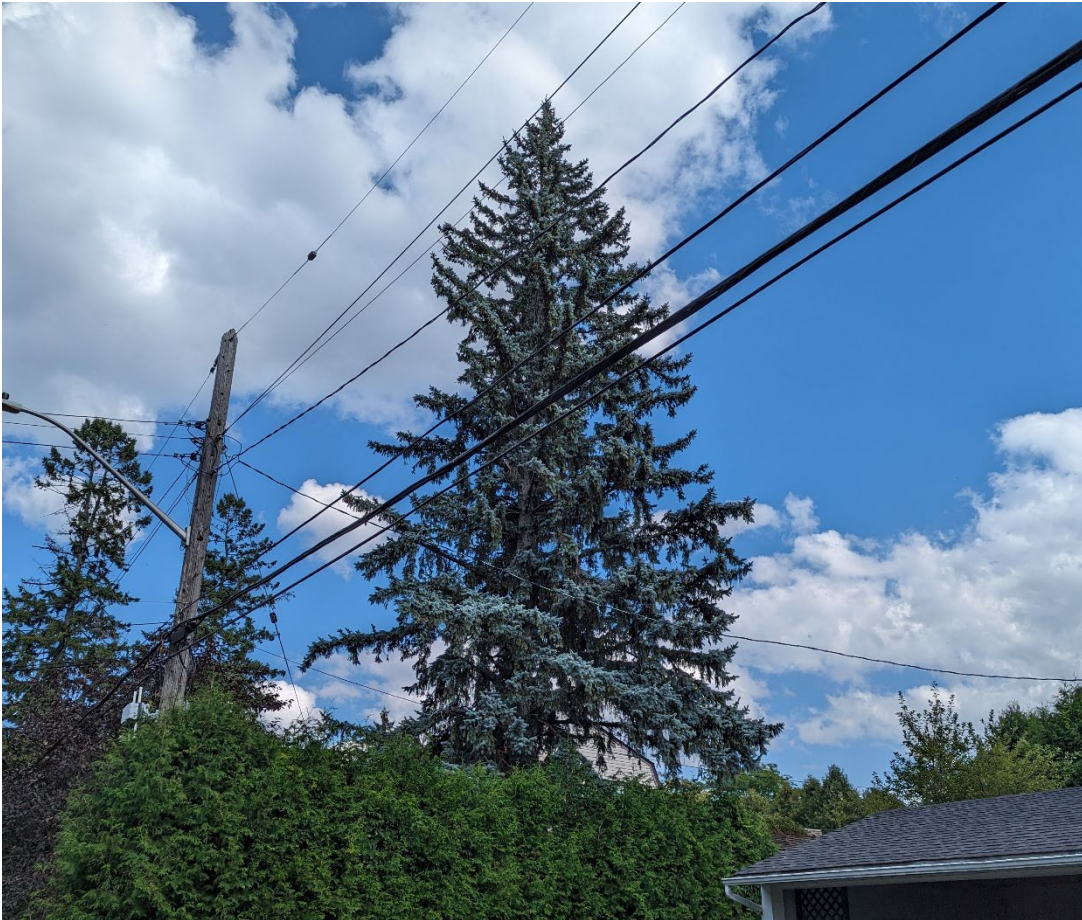
Tree 1 - Adjacent spruce to be retained.