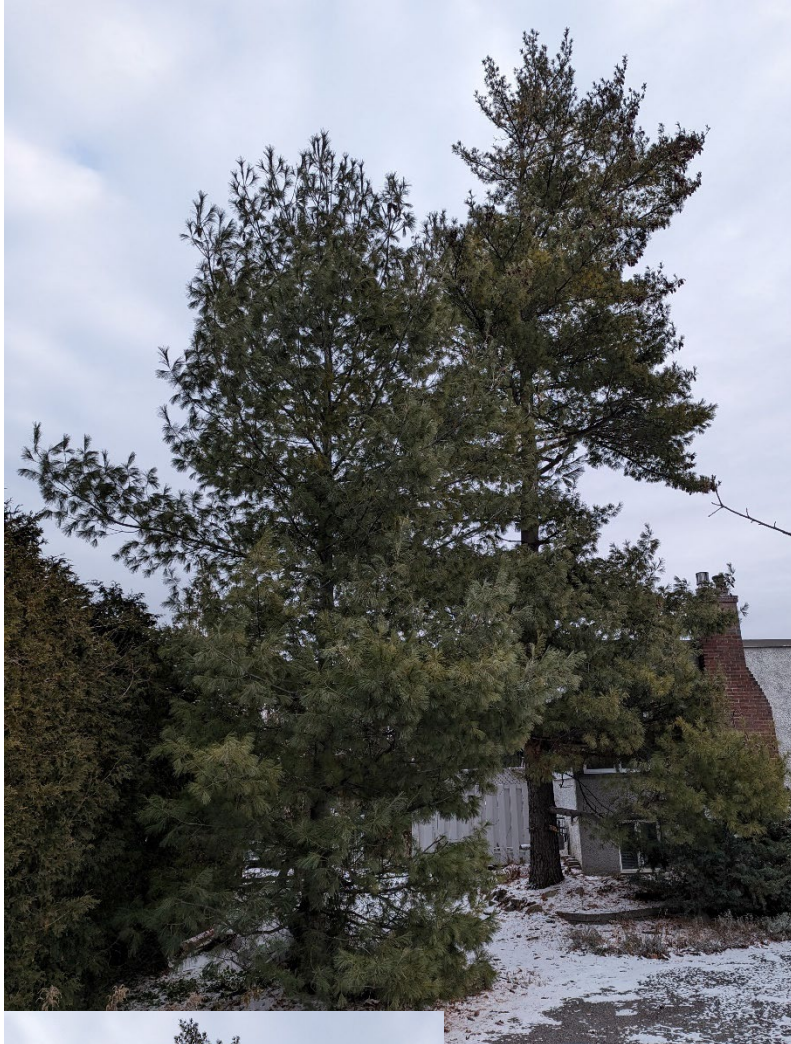
Left: Tree 1 and a private white pine below the threshold for protection - view from the west.