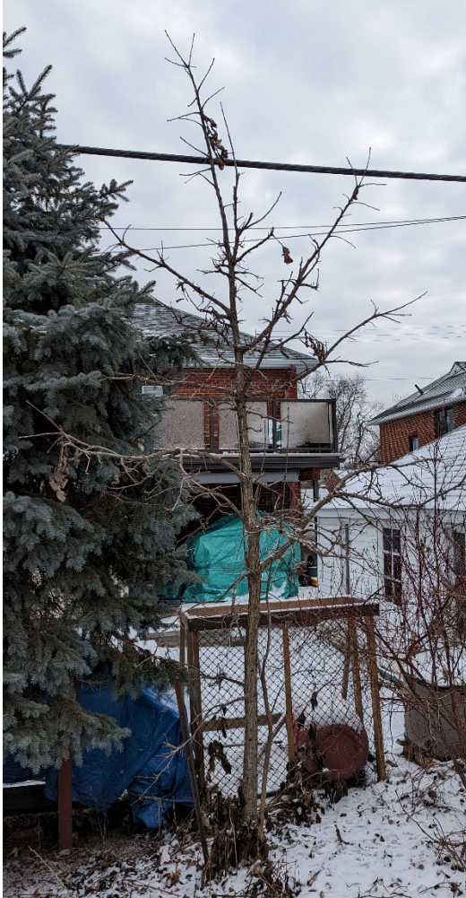
Above: private bur oak below the threshold for protection, but good candidate for protection.