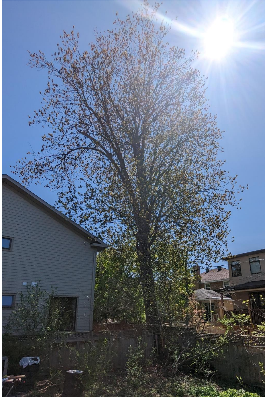
Figure 2 - Tree 2: Adjacent silver maple to be retained.