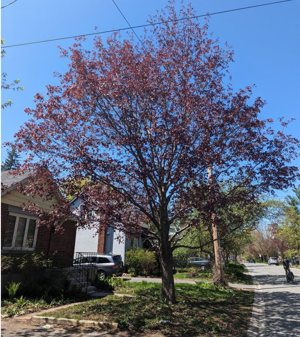
Figure 1 - Tree 1: City Norway maple to be retained.