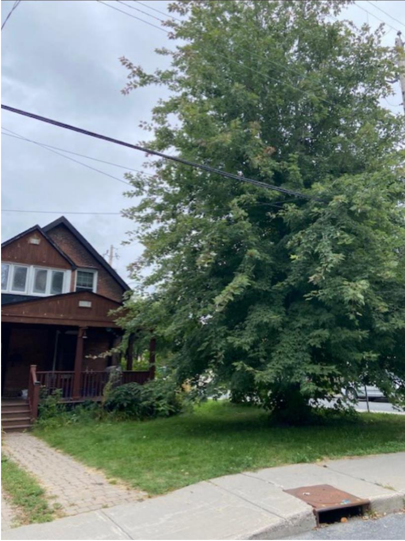
Tree 1, Silver maple, 37cm DBH, to be protected and retained.