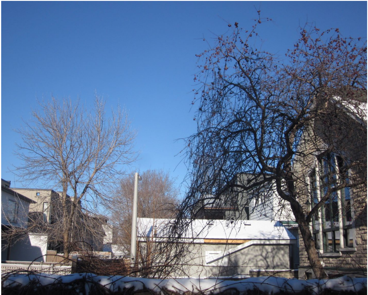
Picture 3. Trees #8 (private crab apple on right) and #9 (neighbouring Manitoba maple on left background), at 398 - 406 Roosevelt Avenue