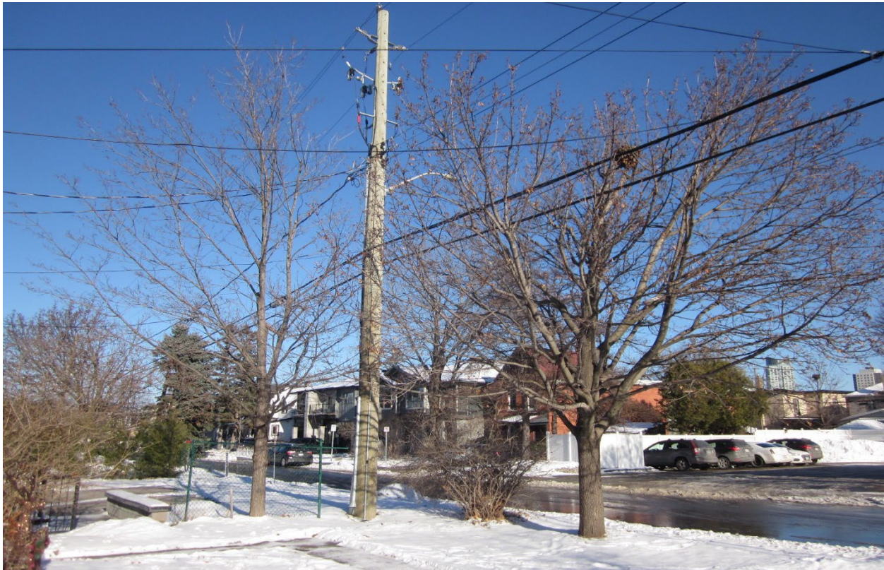
Picture 1. Trees #1 and 2 (left to right), maples on City property adjacent to 398 - 406 Roosevelt Avenue