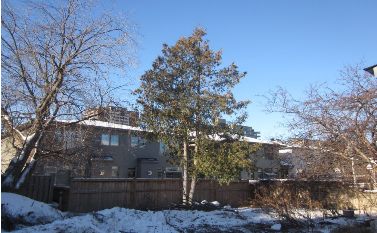
Picture 2. Trees #5, 6 and 7 (left to right), private Manitoba maple, white cedar and crab apple at 398 - 406 Roosevelt Avenue