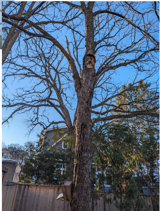
Below: crack on stem of Tree 3 – crack continues along entire stem