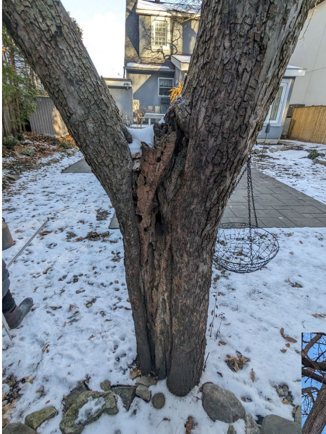
Above: Trunk of Tree 4 with decay.