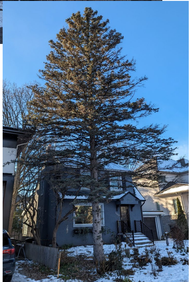
Right: Tree 1 - private spruce to be retained.