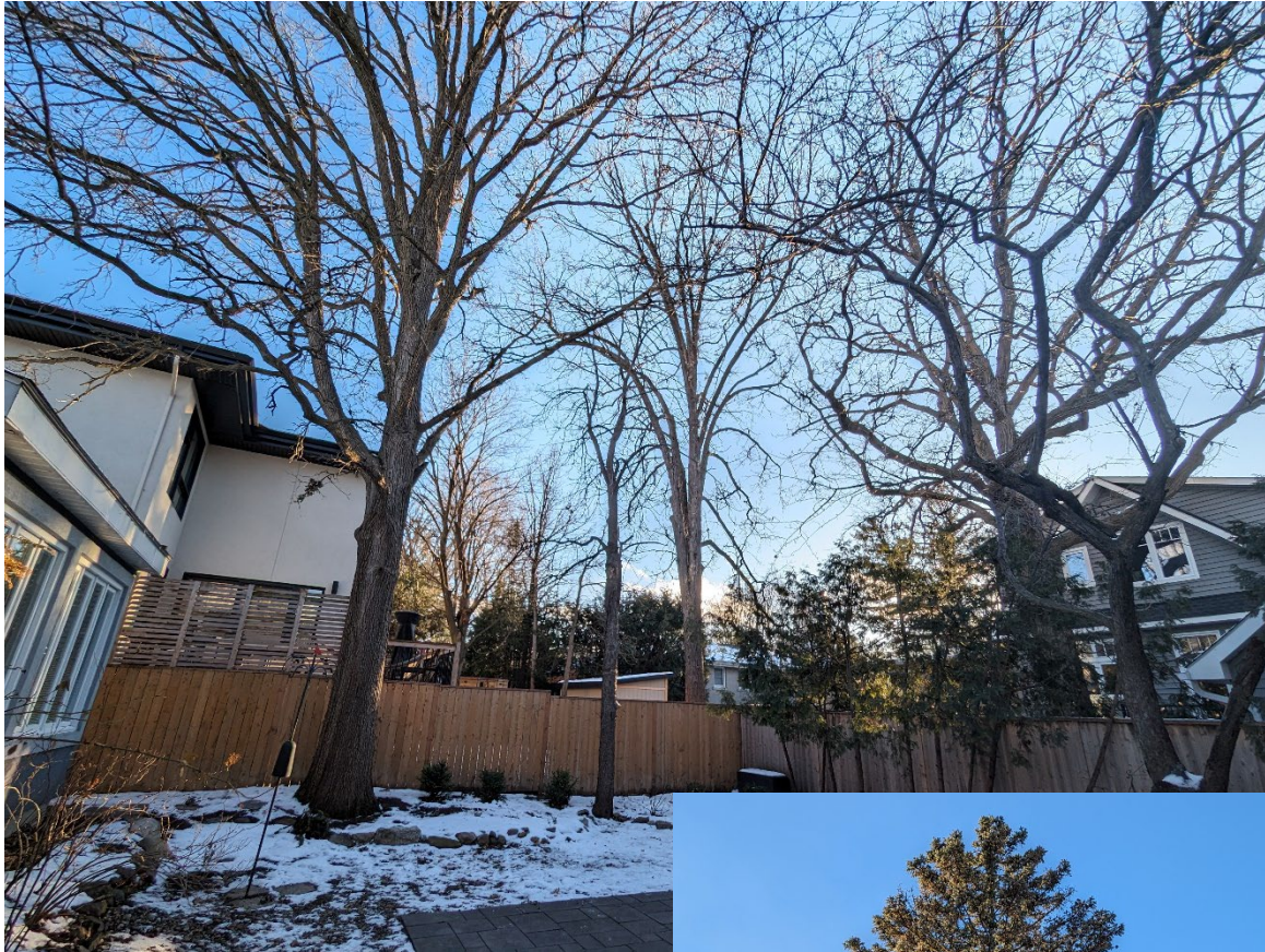
Above (left to right): Trees 2, 3, 5, 6, 4.