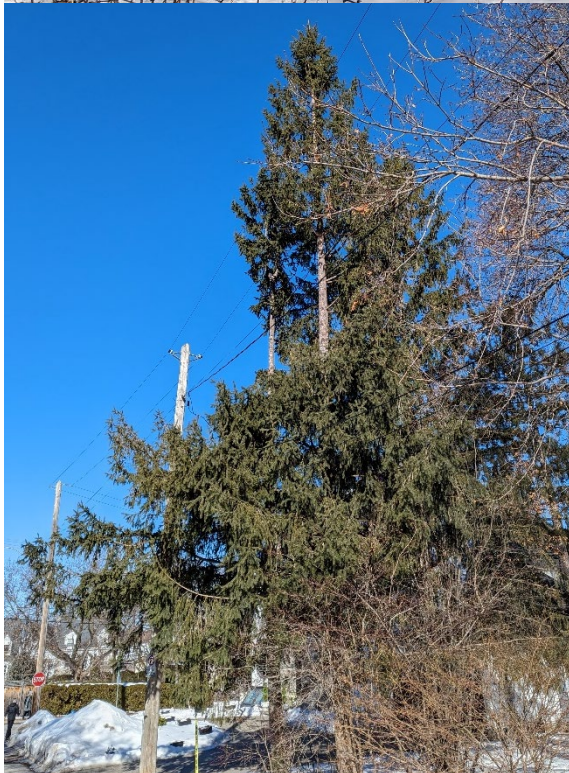
Left: missing canopy segments of Tree 5 and 6