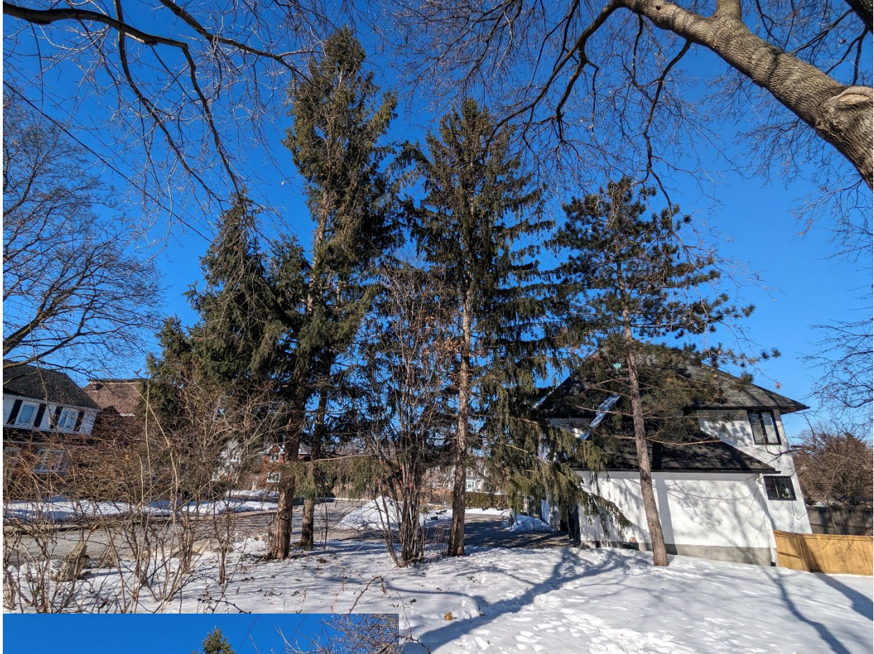
Above: (Right to left) Tree 3 - red pine, 4, 5 and 6 - Norway spruce to be retained.