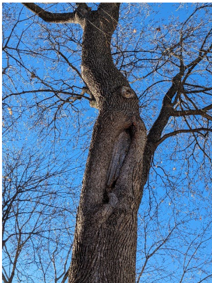
Above: Trees 7-11 - Norway maples to be retained.