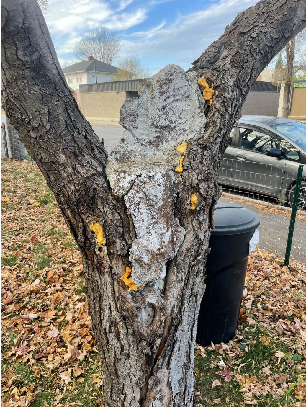
Figure 3: Cherry tree at front of property with large wound at junction of main branch, to be removed