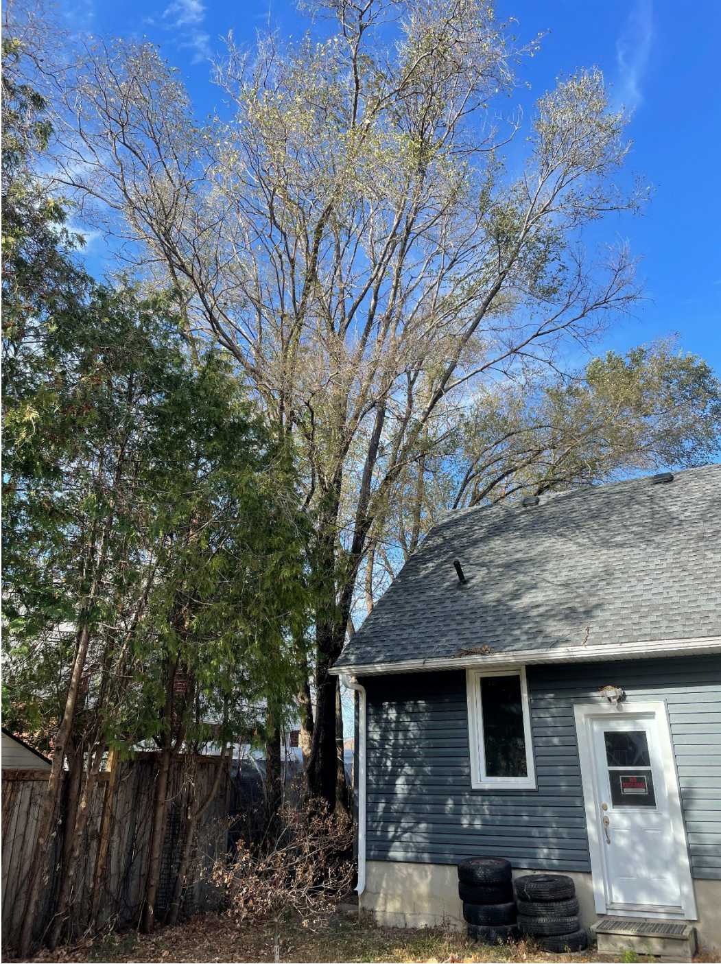
Figure 1: View from the rear of the property showing the Siberian elm along the eastern property line