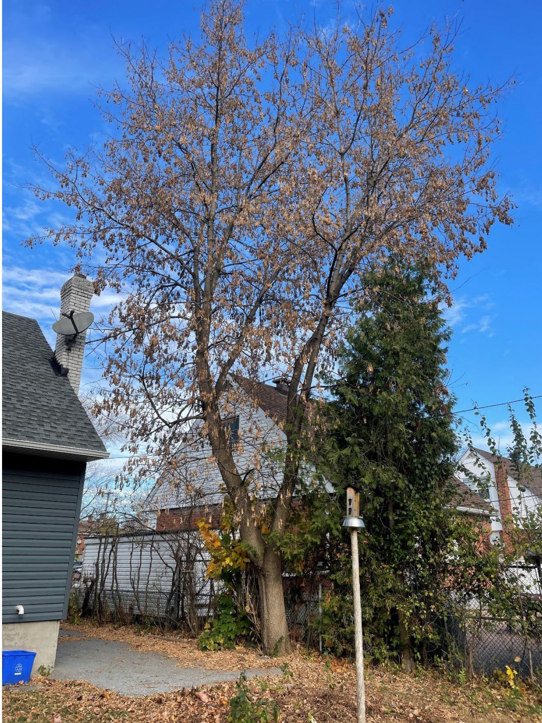
Figure 2: Manitoba maple (tree 5) to be removed