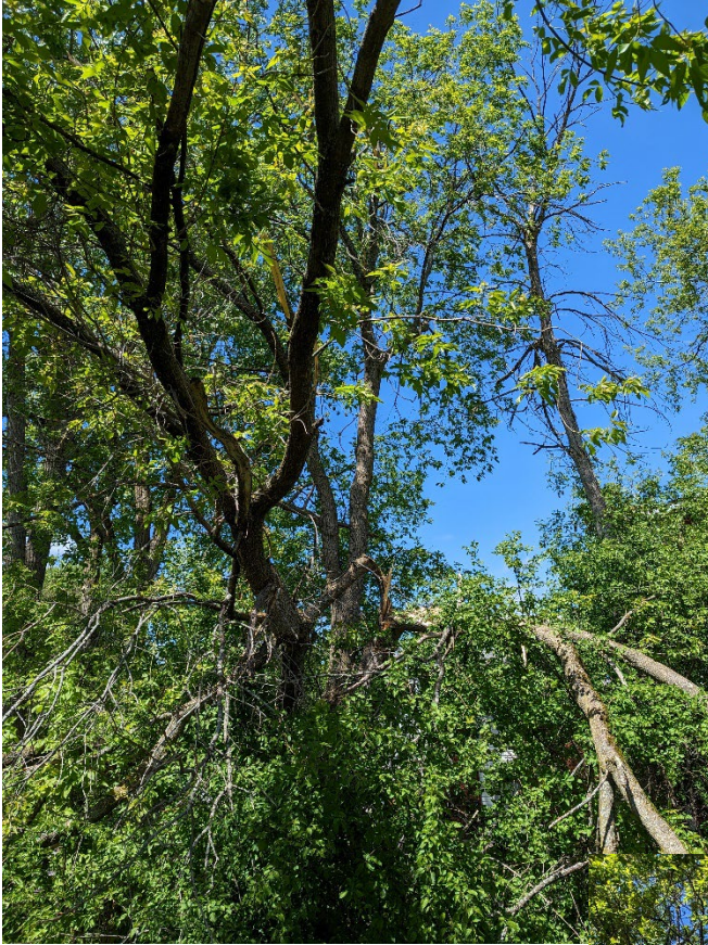
Above: broken branch on Tree 3.