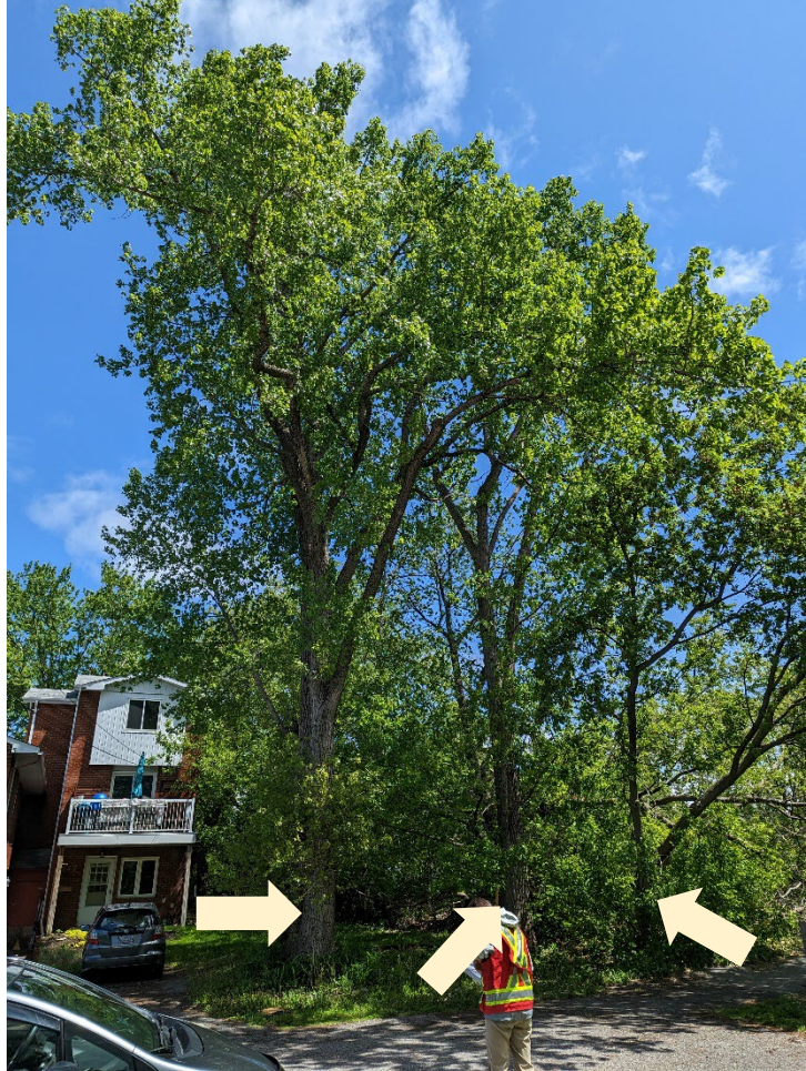
From left to right: Tree 1-3