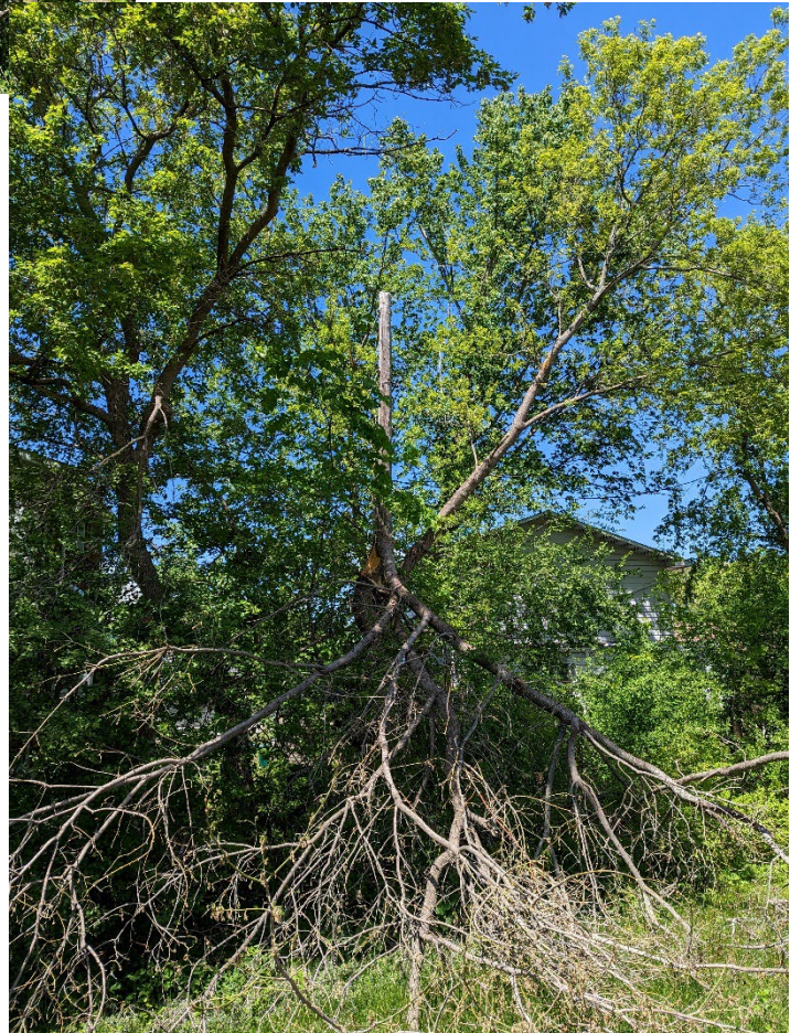
Right: Broken top of Tree 8. Tree 7 at left of image.