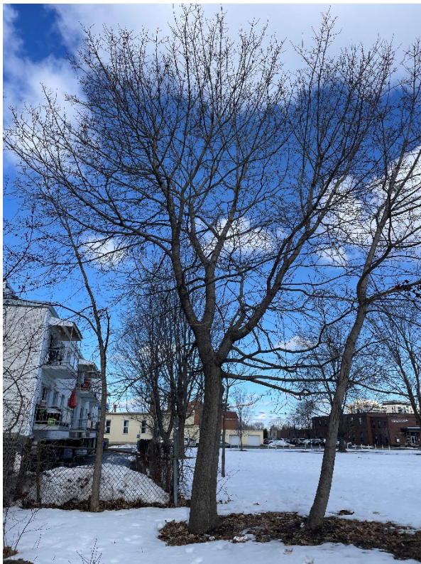
Figure 3: Trees 3 and 4, city Norway maples to be retained