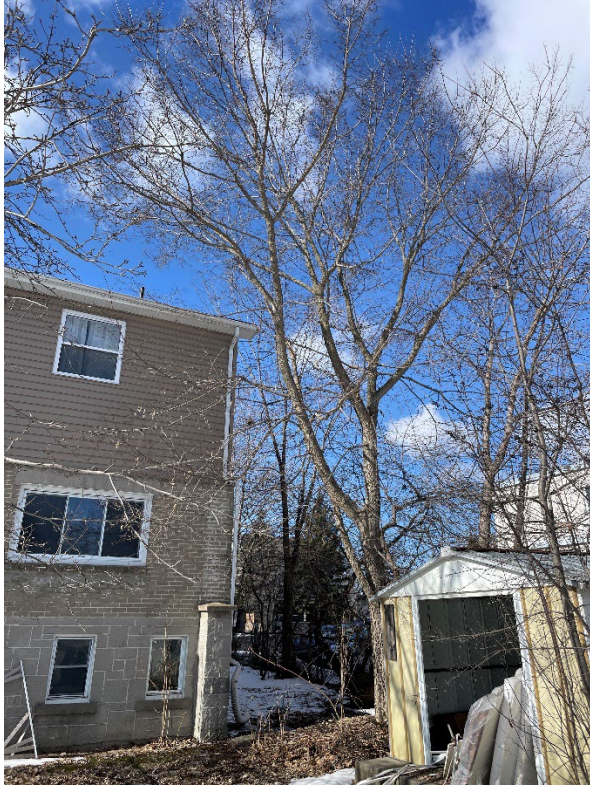
Figure 2: Tree 2: Hackberry to be removed