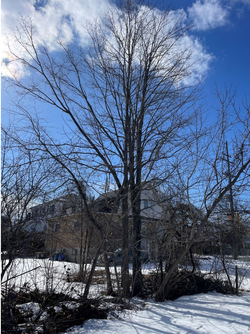
Figure 4: Trees 6 and 7 along the southern property line