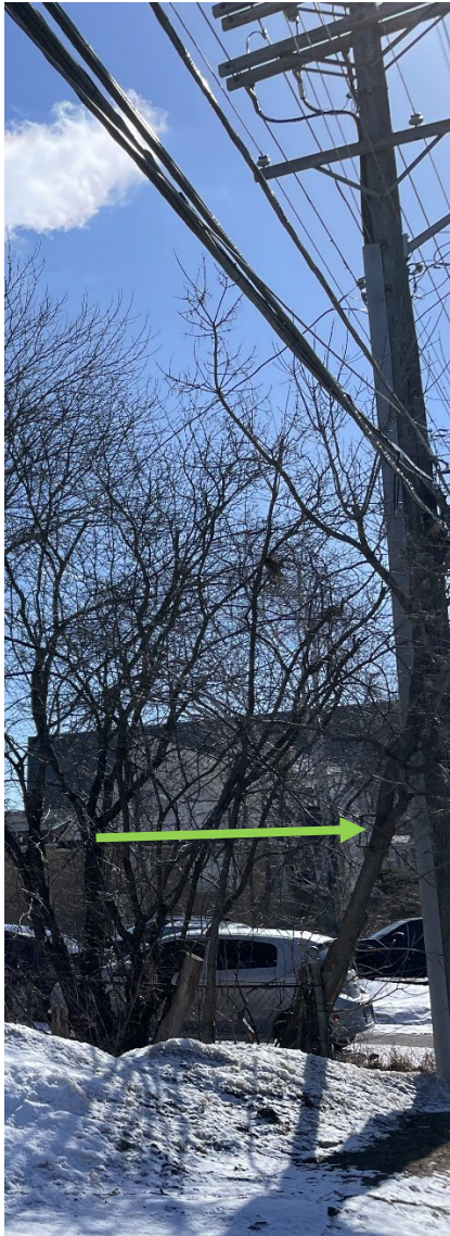
Figure 1: Tree 1, Manitoba maple with heavy lean to be removed

Principal, Dendron Forestry Services Astrid.nielsen@dendronforestry.ca