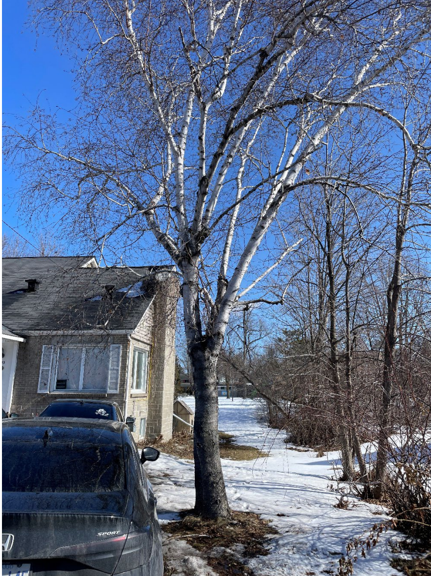
Figure 5: Tree 8, birch tree to be removed