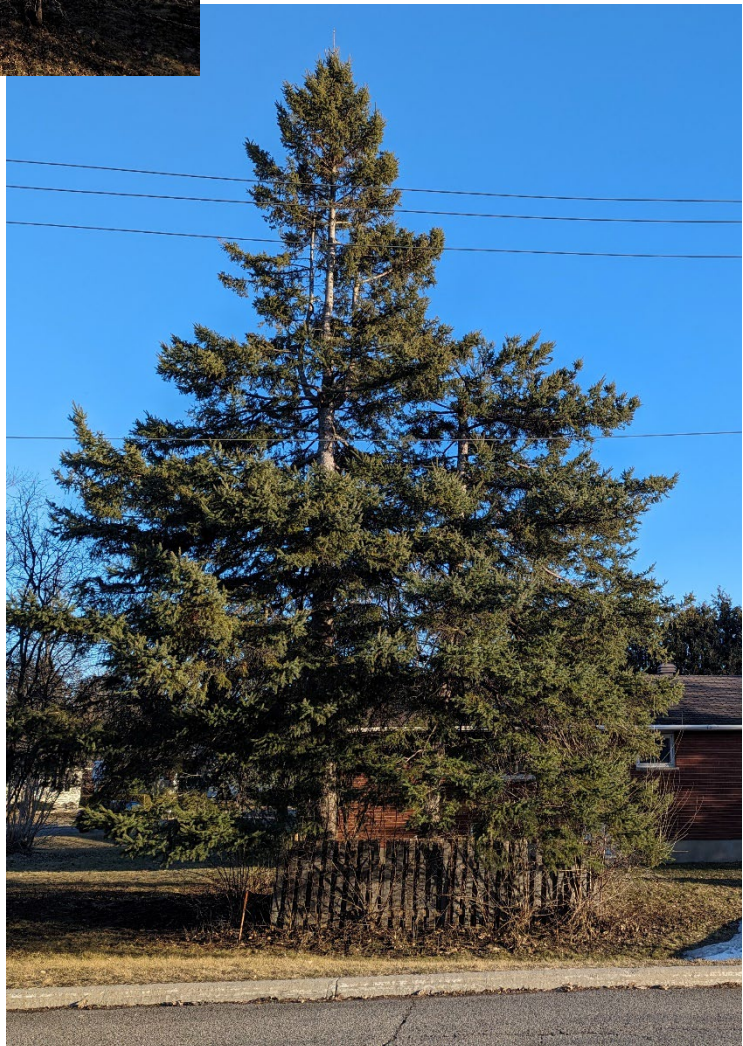
Right: Tree 2 and 3 - private spruces to be retained.