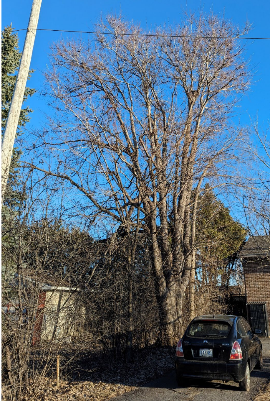
Tree 4 - adjacent maple to be retained (view from the west on Eugene street).