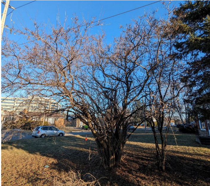
Above: Tree 1 - city Amur maple to be retained.