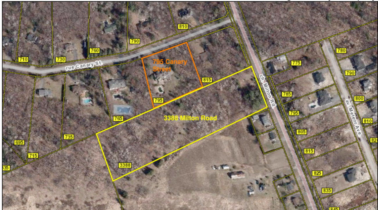
Figure 1. Subject Property

3388 Milton Road is located in the Orleans South-Navan Ward (Ward 19) of the City of Ottawa south of the intersection of Milton Road and Canary Street (see Figure 1). The Subject Property has approximately 82 metres of frontage along Milton Road, and an approximate area of 6.9 acres (2.8 hectares).