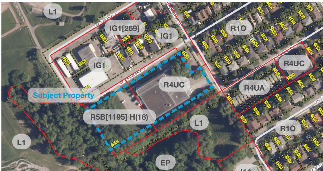
Figure 6: Zoning Map

The subject property is split zoned. The front portion of the subject property is zoned “Residential Fourth Density, Subzone UC – R4UC”. The rear portion of the subject property is zoned “Residential Fifth Density, Subzone B Exception 1195, height 18 metres – R5B[1195] H(18)”. The current zoning on the subject property is a result of a Zoning By-law Amendment approved by Council in 1995 to accommodate the redevelopment of the property with residential land uses. Since the Zoning By-law was approved, redevelopment of the property has been abandoned, resulting in the existing legal non-conforming land uses.