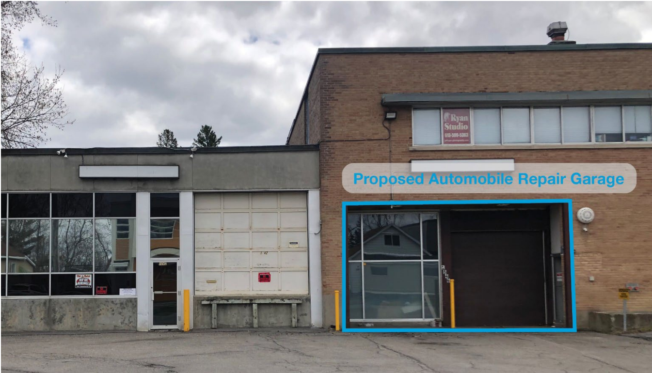
Figure 4: Photo of the subject property showing the proposed location of the automobile repair garage