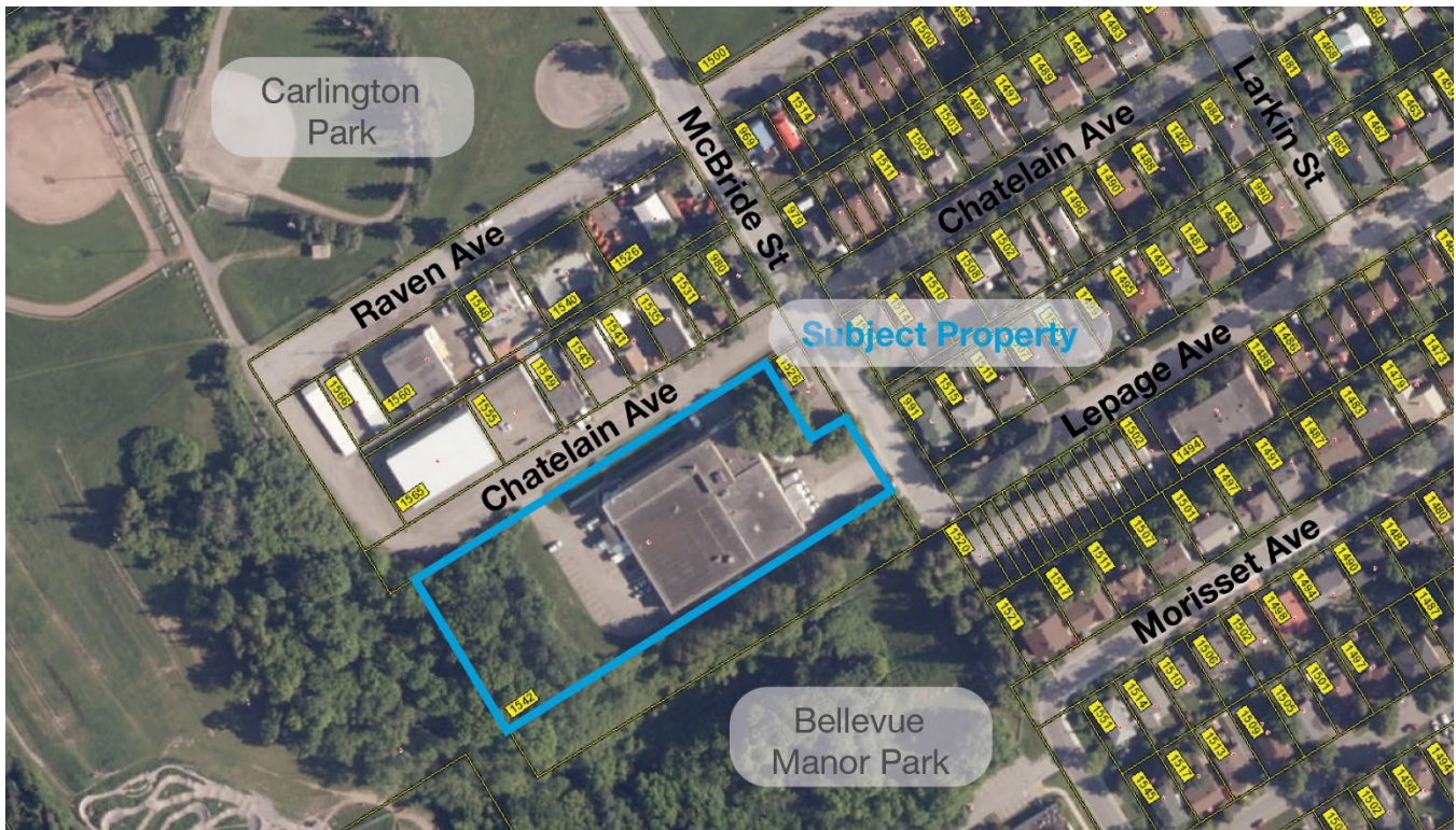
Figure 1: Subject Property and Surrounding Context

The subject property, municipally known as 1542 Chatelain Avenue, has a frontage on Chatelain Avenue of 152.4 metres and a frontage on McBride Street of 32.6 metres. The subject property has a total area of 1.04 hectares (10,414.76 square metres).