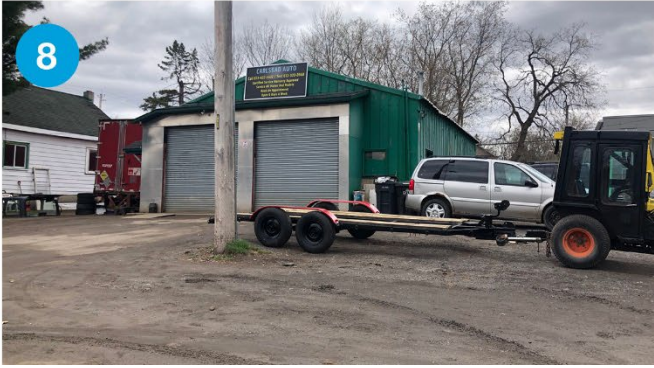
Figure 2: Photos of the subject Property and Surrounding Context