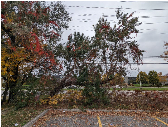
Below right: Tree 29 - private crab apple