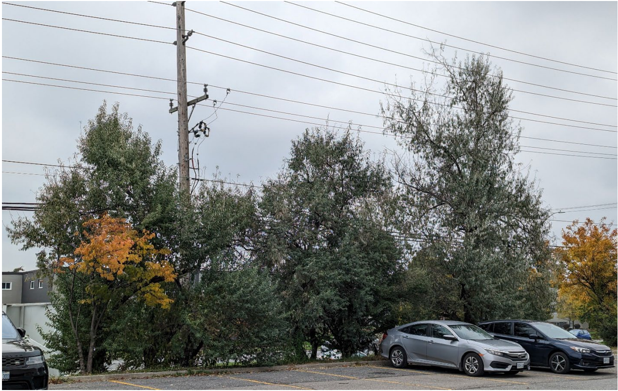
Above: Trees 20-23 – private Russian olives and hawthorn (at far right of image). Below: (left to right) Trees 15, 16 and 17 – city honey locusts