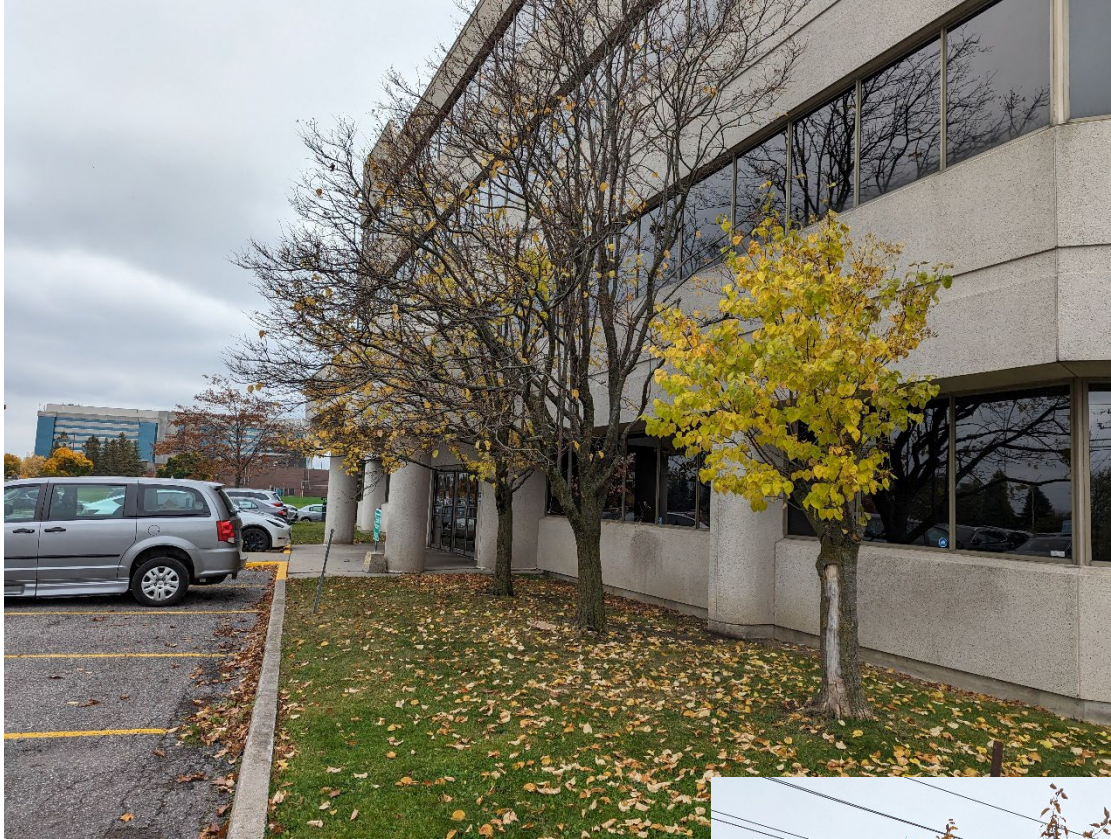
Above: (right to left) Trees 30-32 - private tree lilacs.