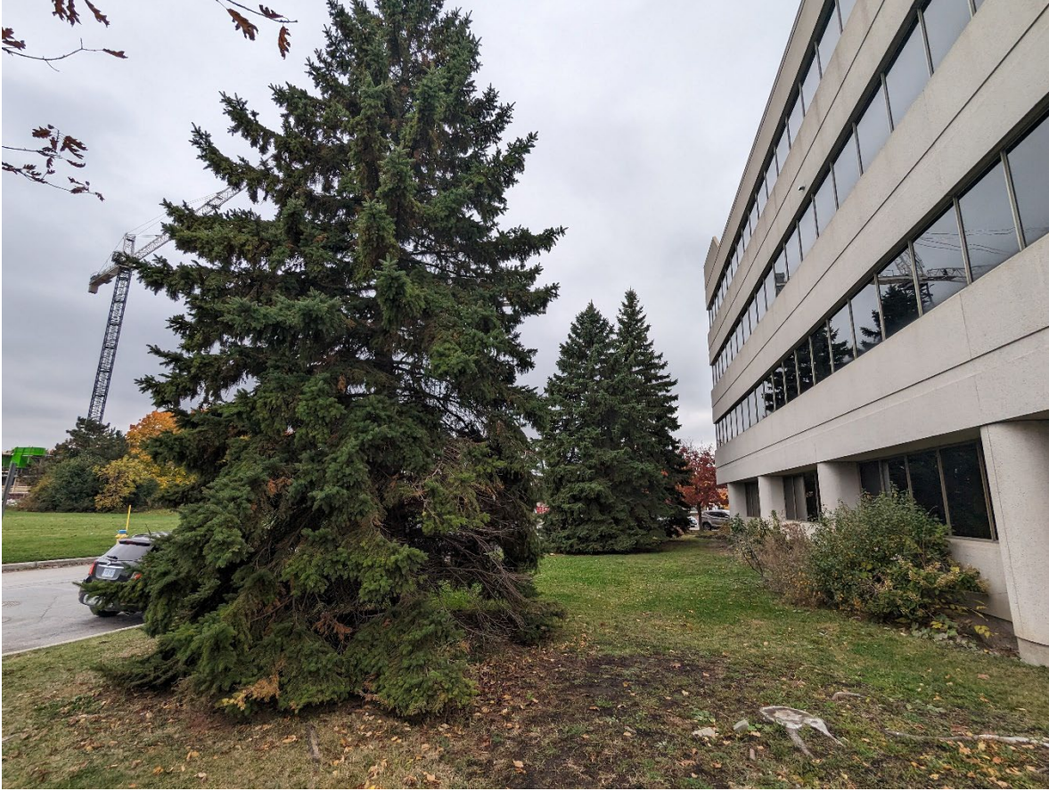
Above: (left to right) Trees 5-7 - private spruces. Below: (left) Tree 8, (right) Tree 9 - private maples