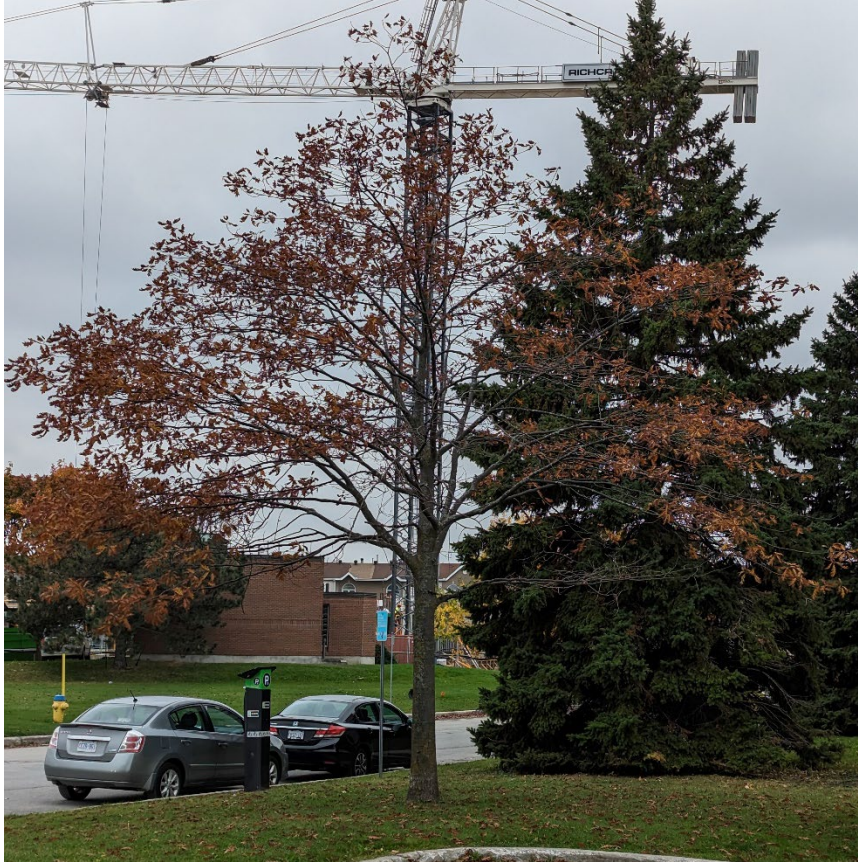
Above: Tree 4 - private oak (Tree 5 in background). Below left: Tree 2 - private white oak. Below right: Tree 3 - private red oak.