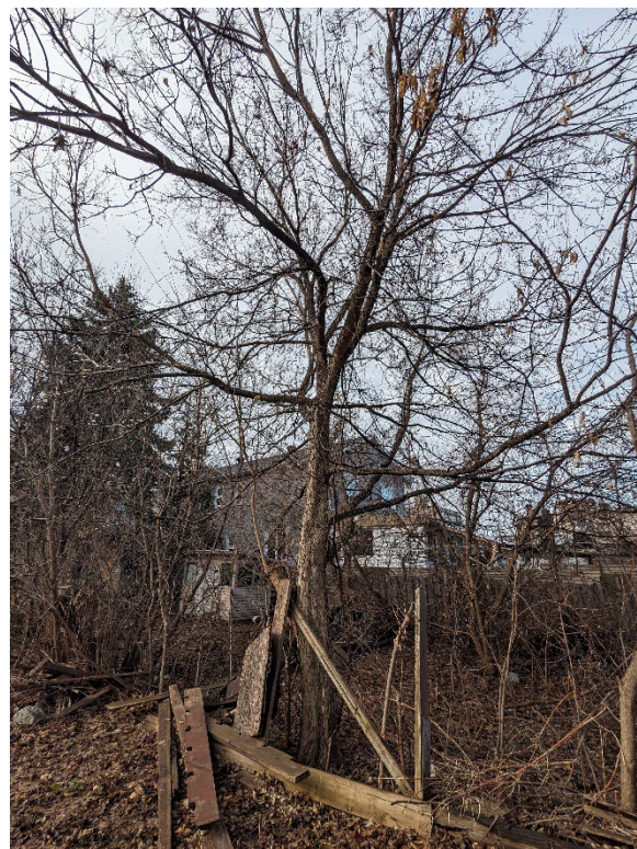
Above: Tree 5 - private hackberry to be retained.