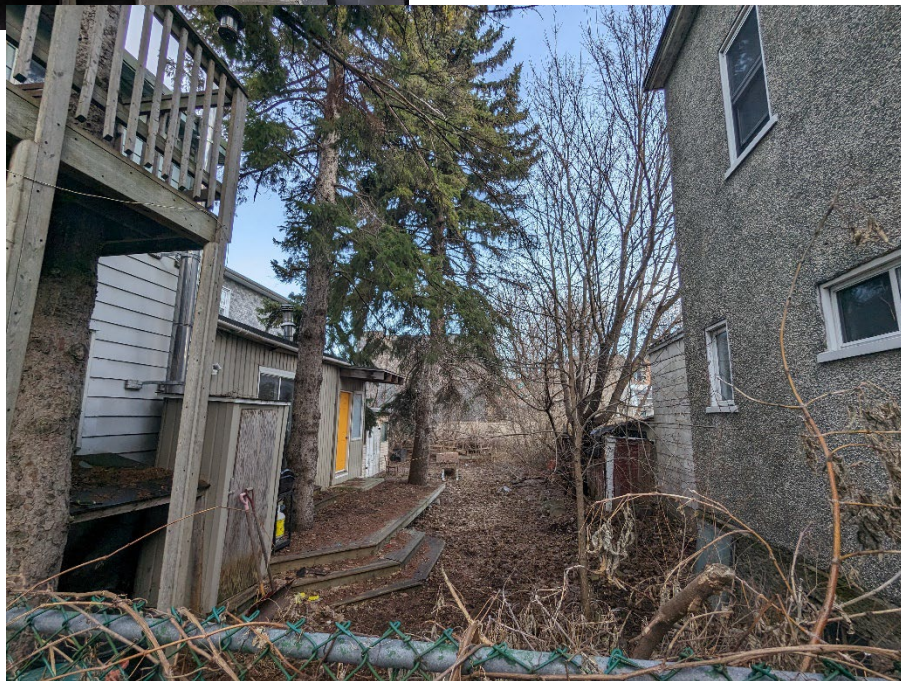
Trunks of Tree 2 (just visible at left), 3 and 4.