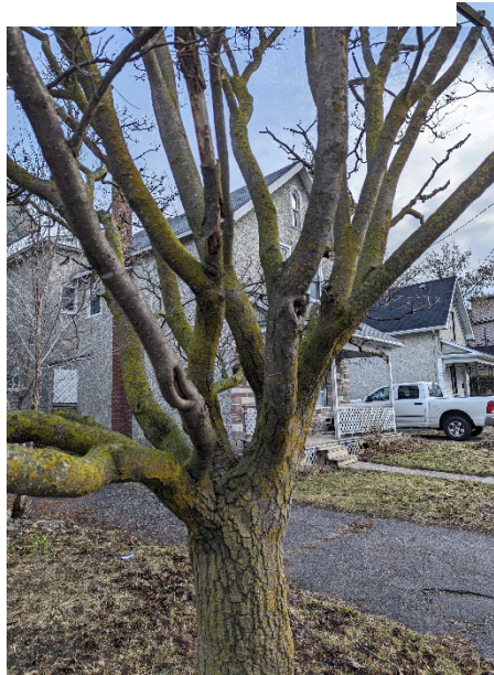
Above: main union of Tree 1 - view from the west.