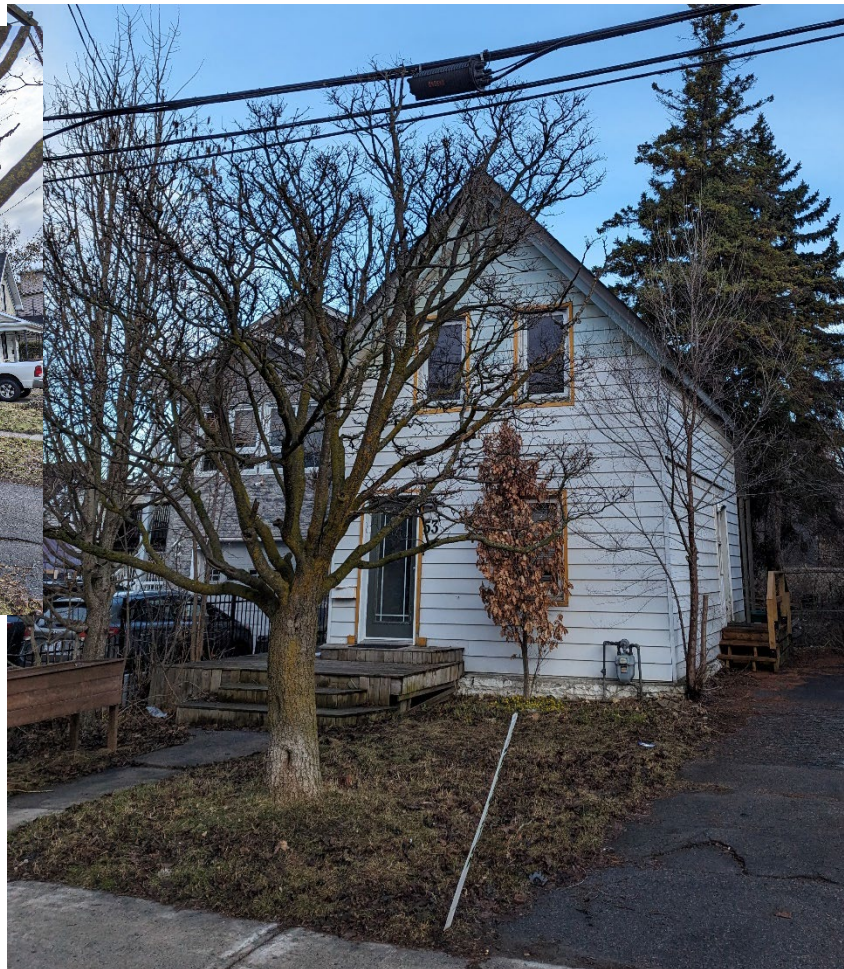
Right: Tree 1 - City lilac to be removed.