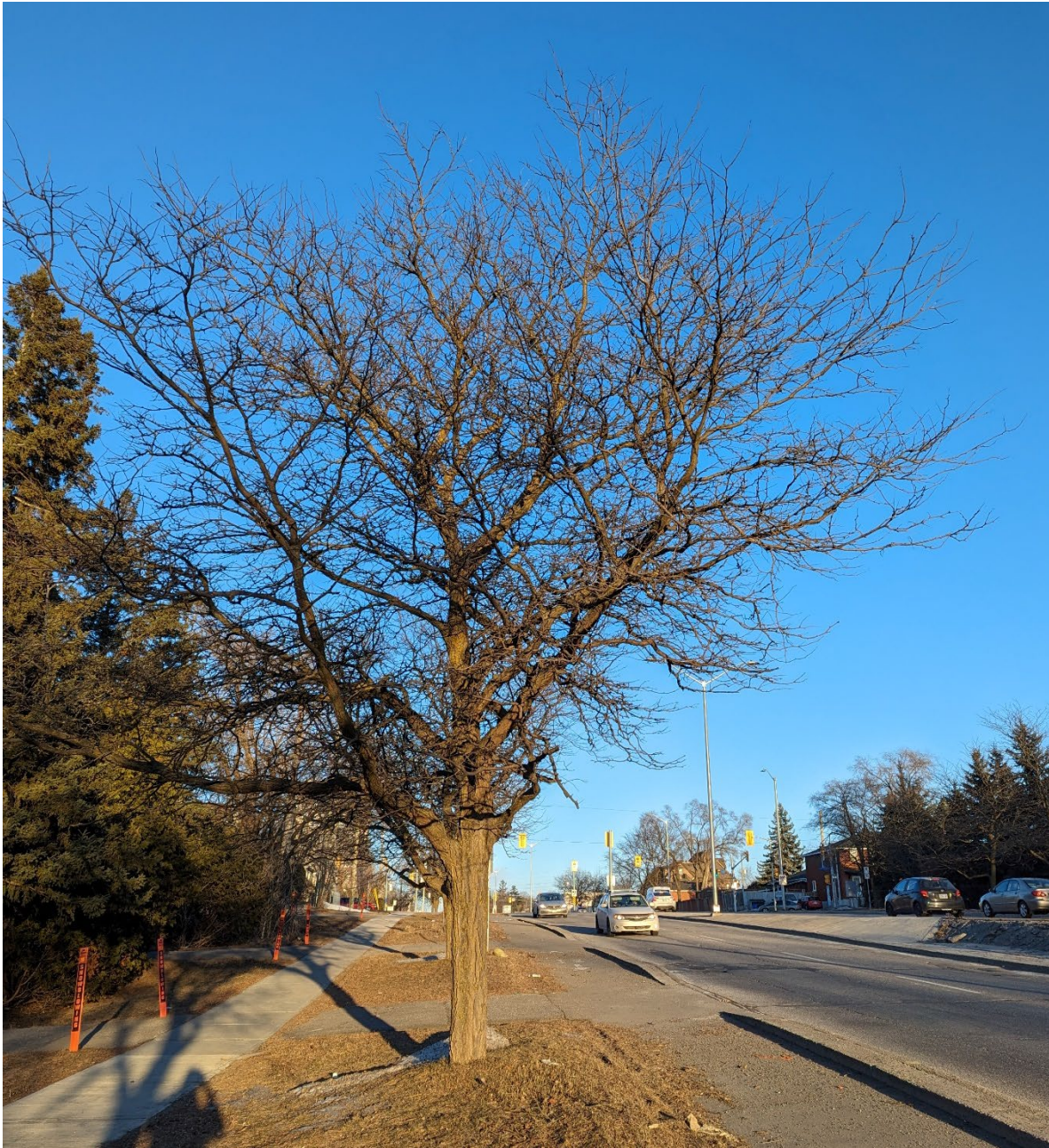
Tree 1 - City Honey locust to be removed