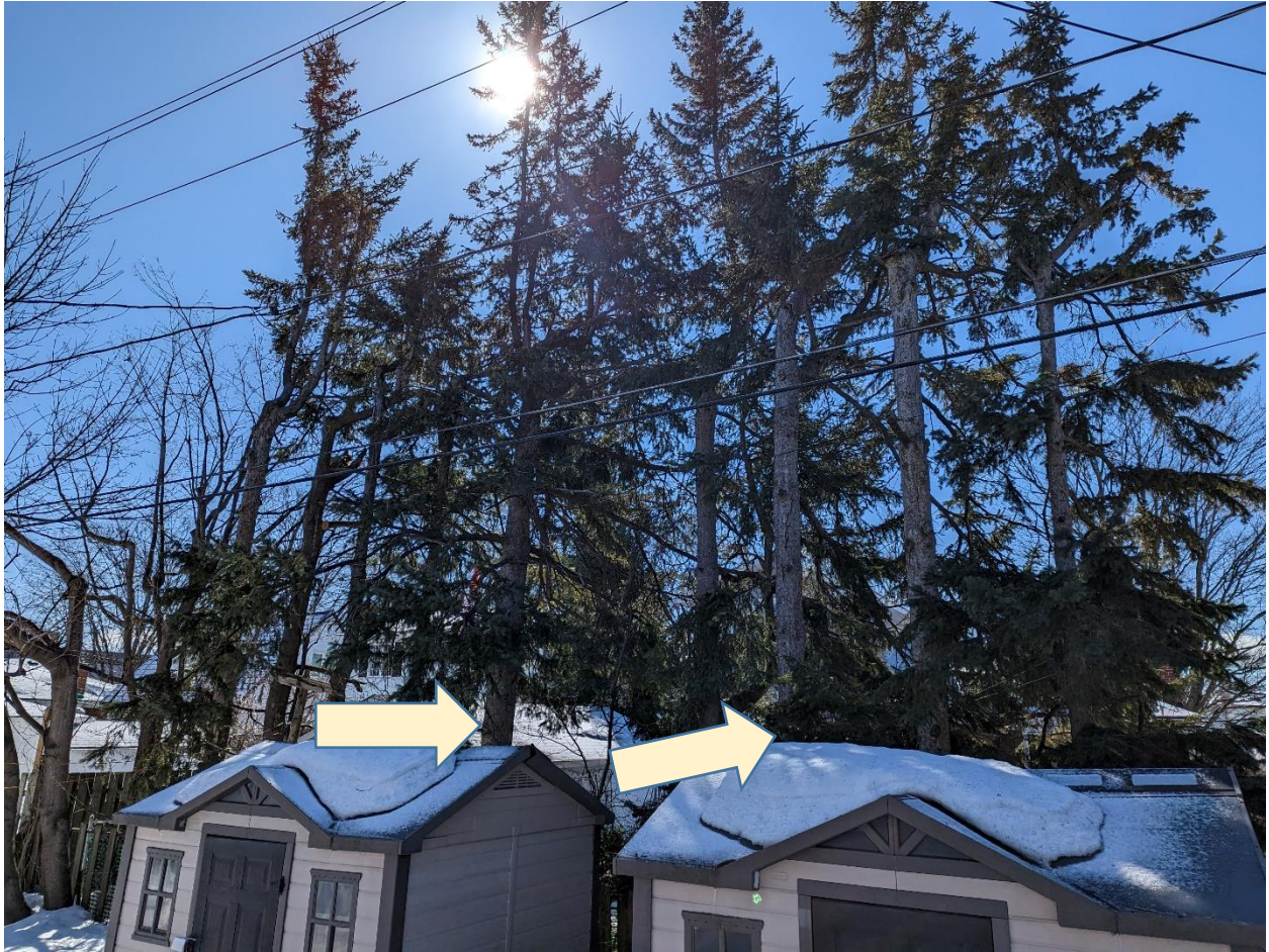
Figure 3 - Tree 8 (left) and Tree 9 (right): adjacent spruces to be retained.