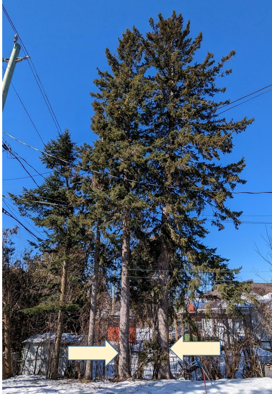
Figure 1 - Trees 4 (on right) and 5 (on left): private spruces to be removed.