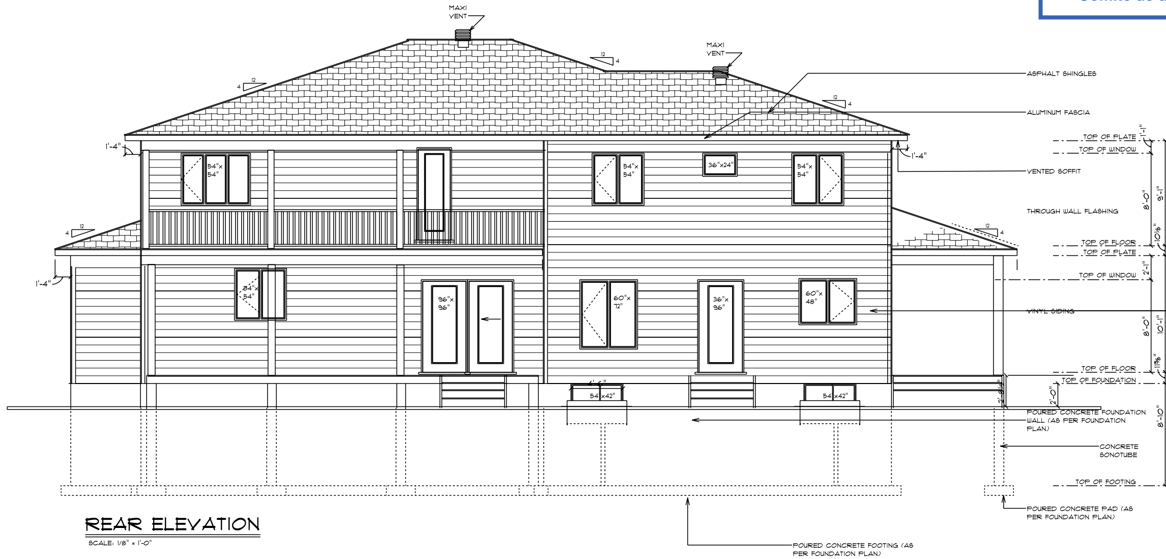
REAR ELEVATION SCALE: 1/8" = 1'-0"

Committee of Adjustment Received | Reçu le 2024-05-28 City of Ottawa | Ville d'Ottawa Comité de dérogation