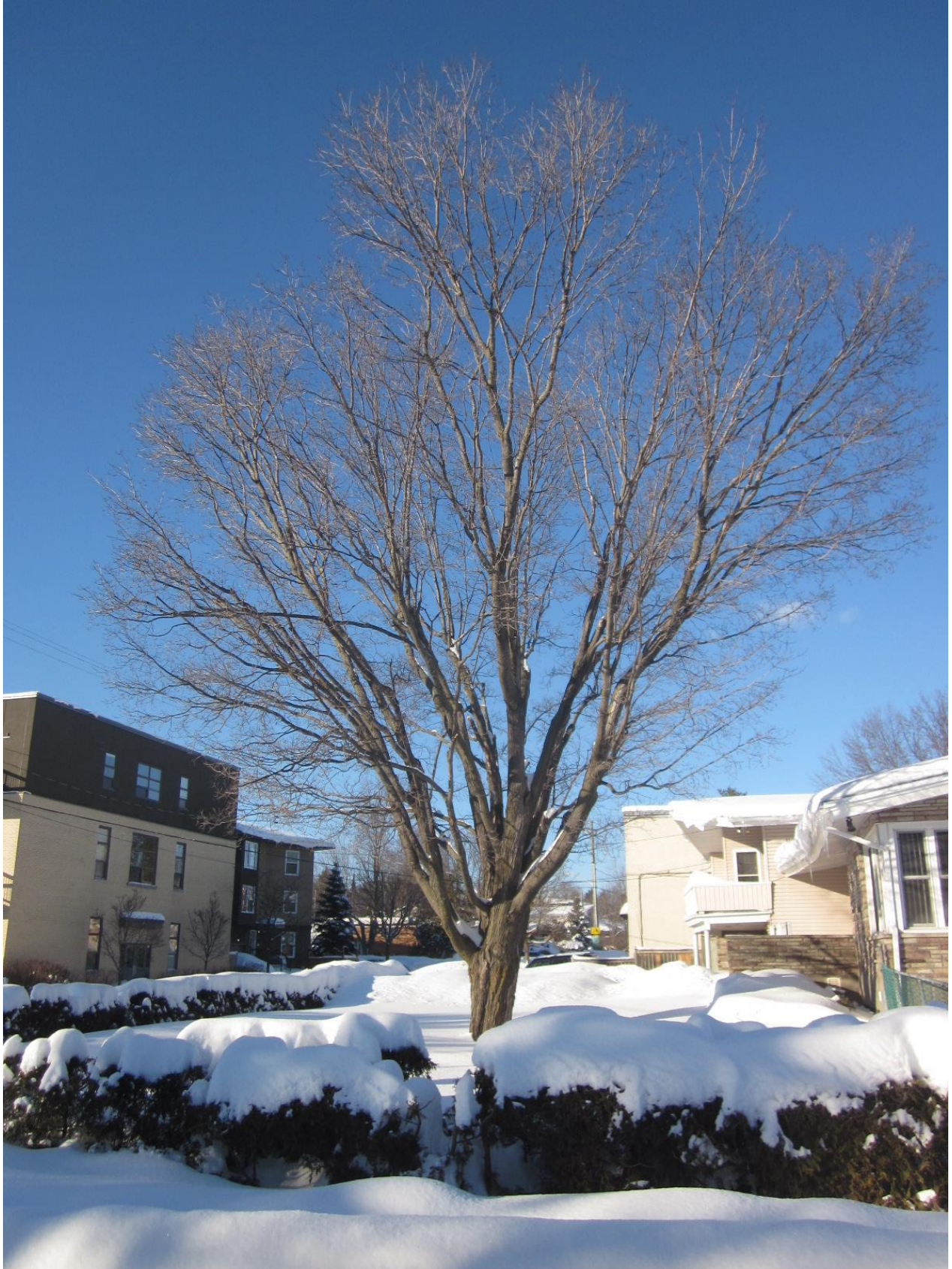
Picture 1. Trees #1 (maple) and #2 (cedar hedge) at 191 Granville Avenue & 351-355 St. Denis Street, Ottawa