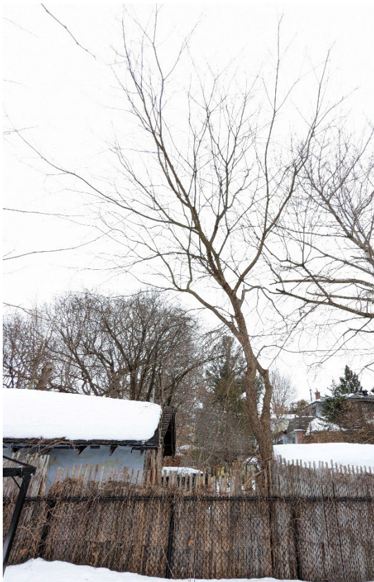
Above: Tree 4 - boundary elm to be removed.