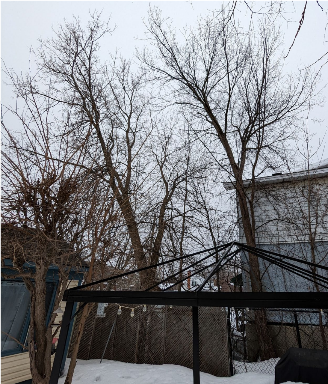
Tree 2 (left) and Tree 3 (right) - adjacent maple and elm to be retained.