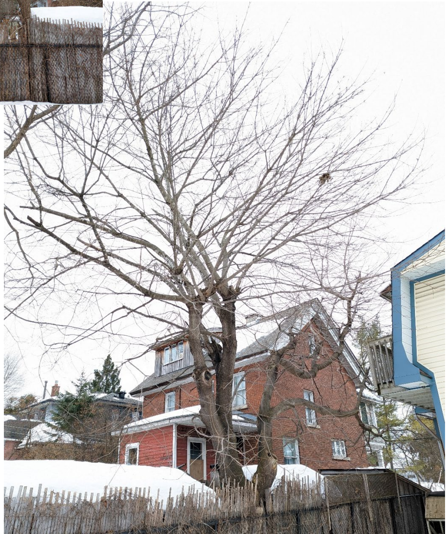
Right: Tree 5 - boundary Norway maple to be removed.