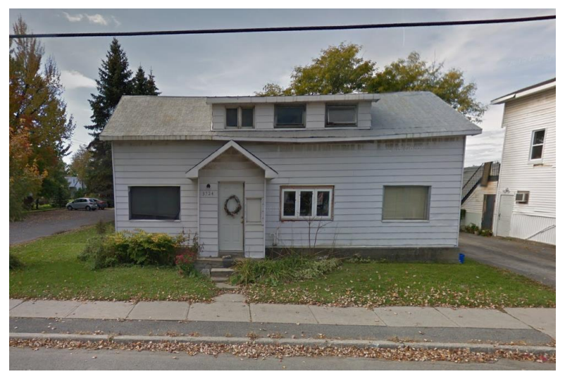
3524 McBean Street. Source: Google Street View, October 2012.