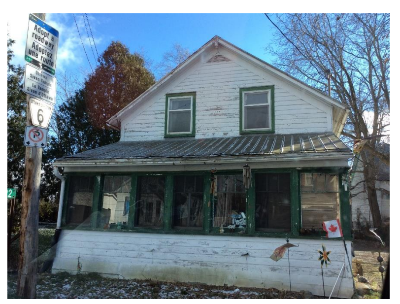
2322 Roger Stevens Drive.