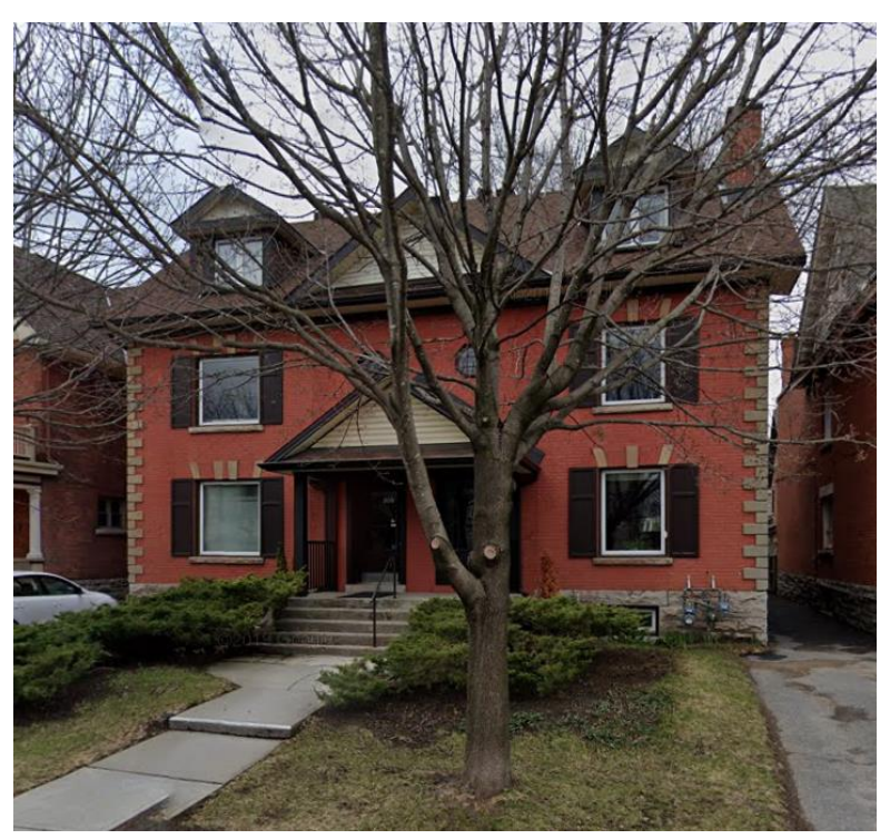
309 Stewart Avenue.