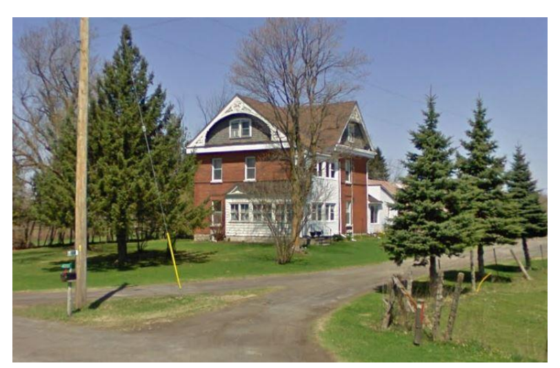
4055 Russell Road.