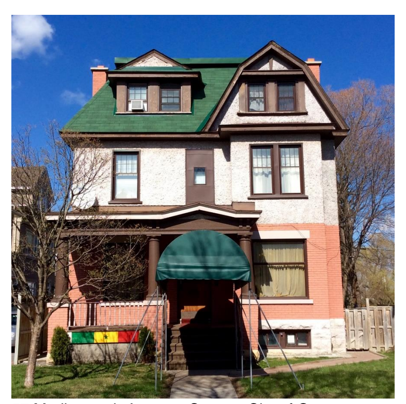
57 Marlborough Avenue.