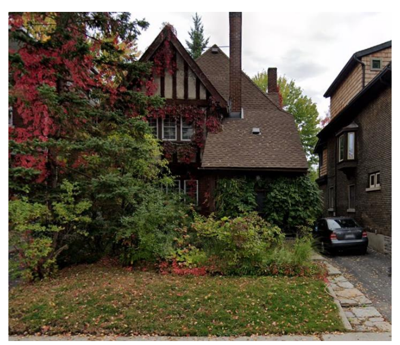
5 Cobalt Avenue.