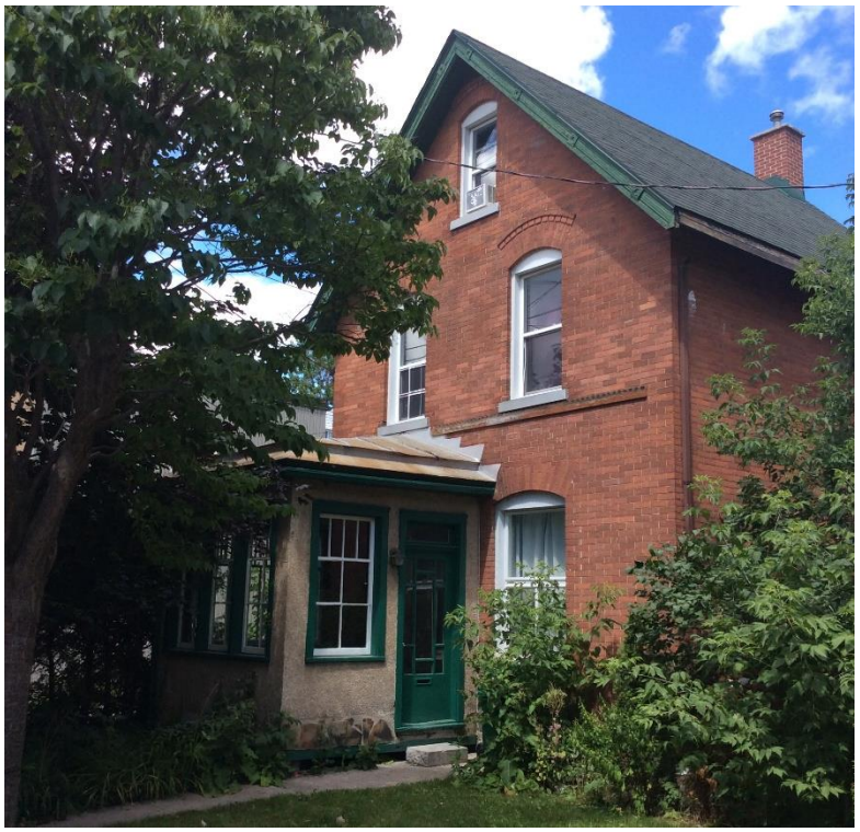
95 Henderson Avenue.