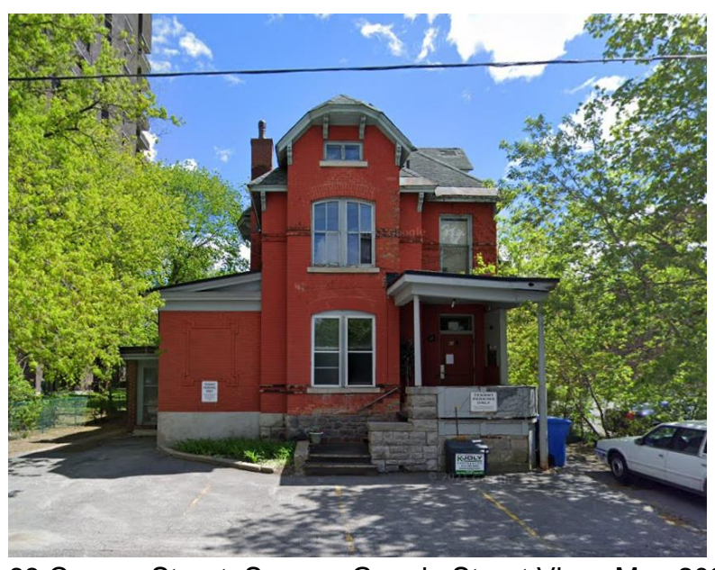
68 Cooper Street.