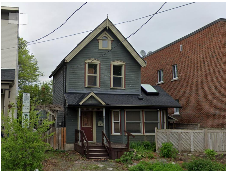
23 Strathcona Avenue.