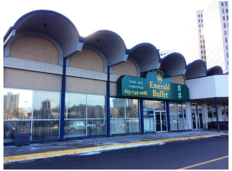
3 Selkirk Street.