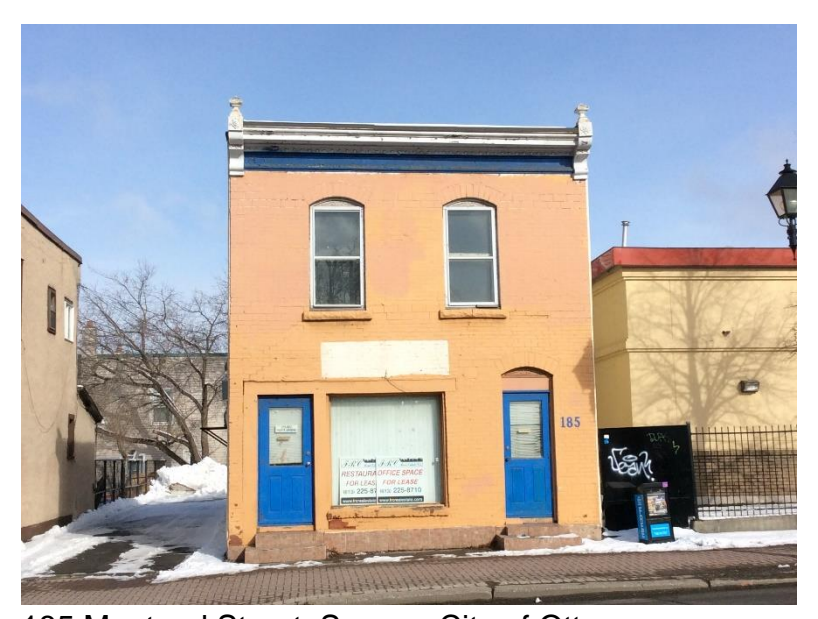
185 Montreal Street.