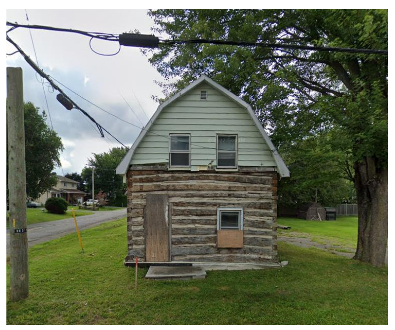
74 Martin Street. Source: Google Street View, July 2022.