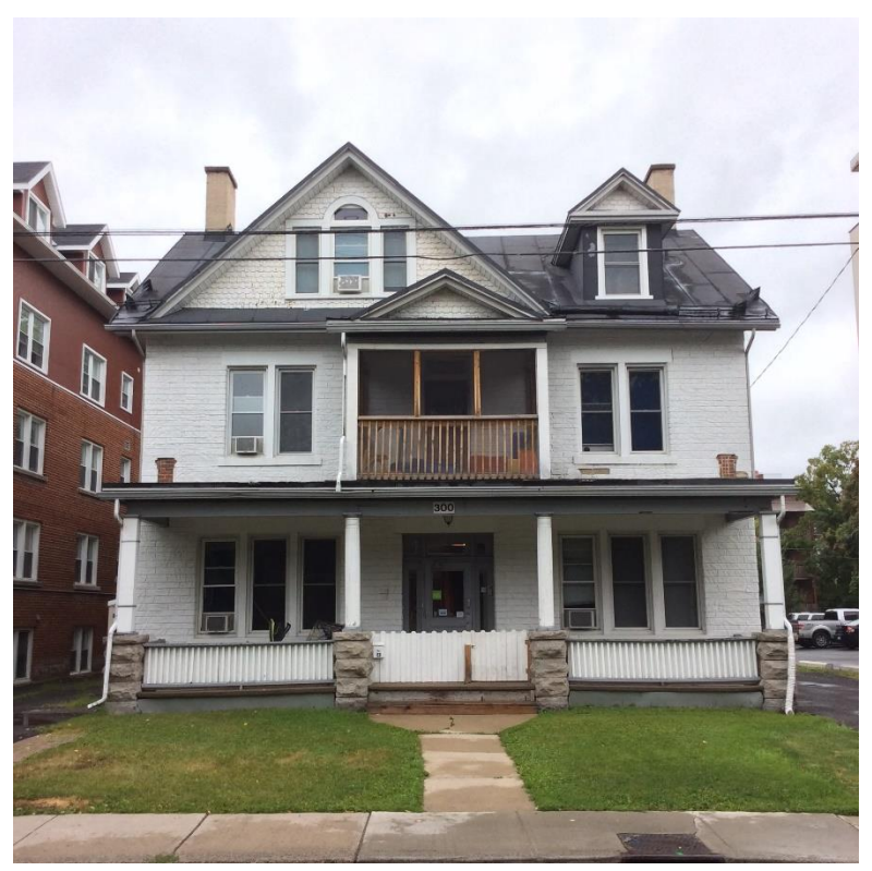
300 Wilbrod Street.