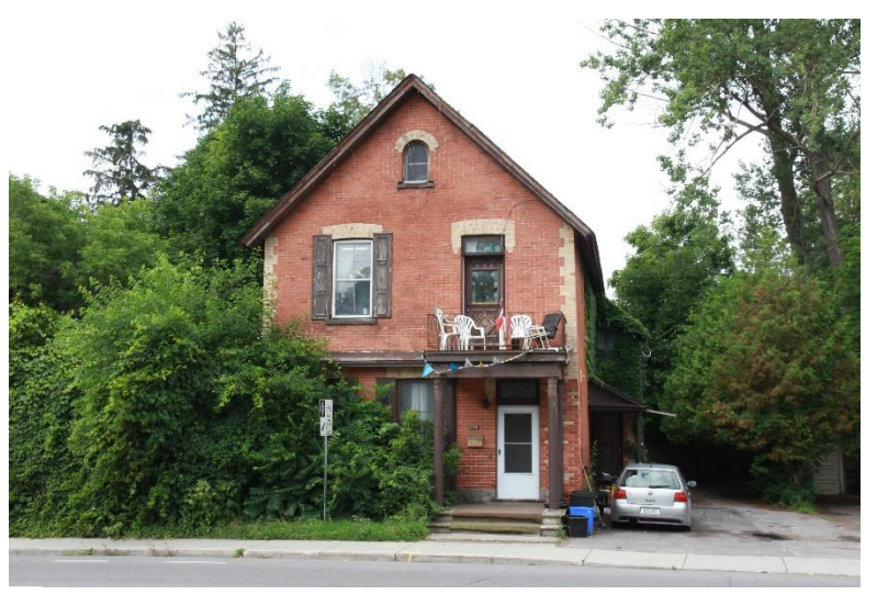
994 Bronson Avenue.