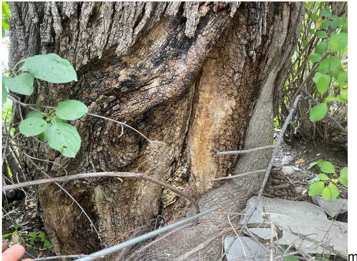
Figure 4: Tree 2, large wound (possibly canker) at base of tree on underside of lean