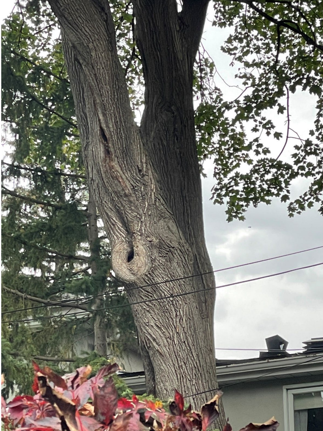
Figure 6: Tree 3 taken from end of driveway of 633 Edison, facing north; note the old branch wound, likely with significant decay extending up along the stem