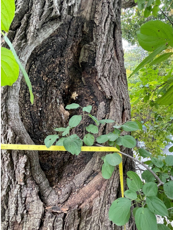
Figure 3: Tree 2, large wound on trunk, tree has attempted to seal it off, but has been unsuccessful as decay extends 20 cm into trunk