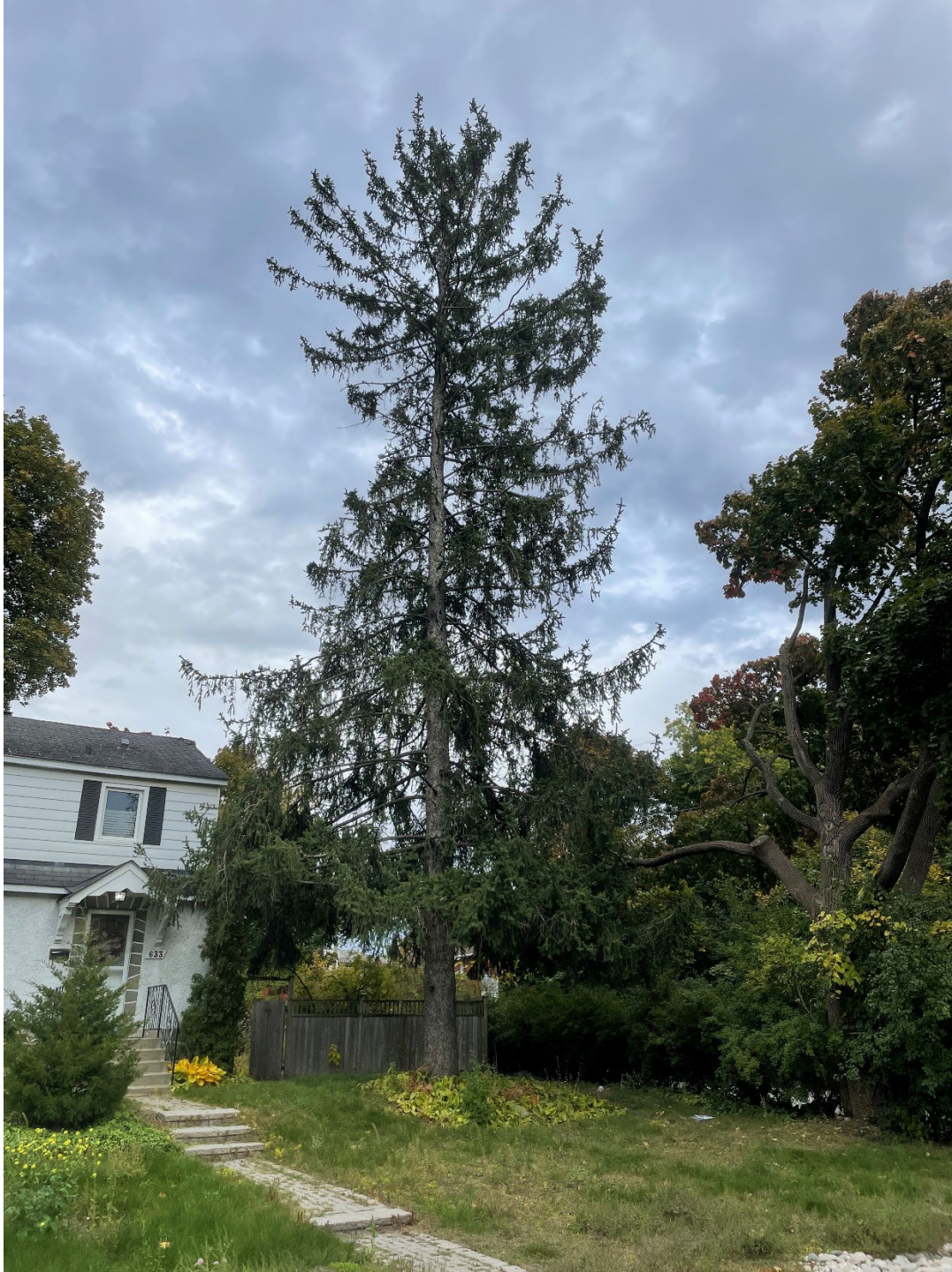
Figure 1: Tree 1, Privately owned Norway spruce