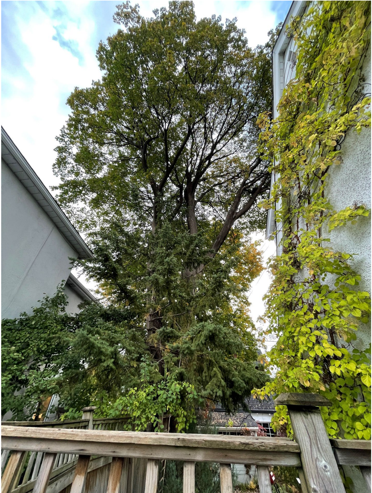
Figure 5: Tree 3, appears to be jointly owned with neighbour at 631 Edison (taken from Edison looking east)