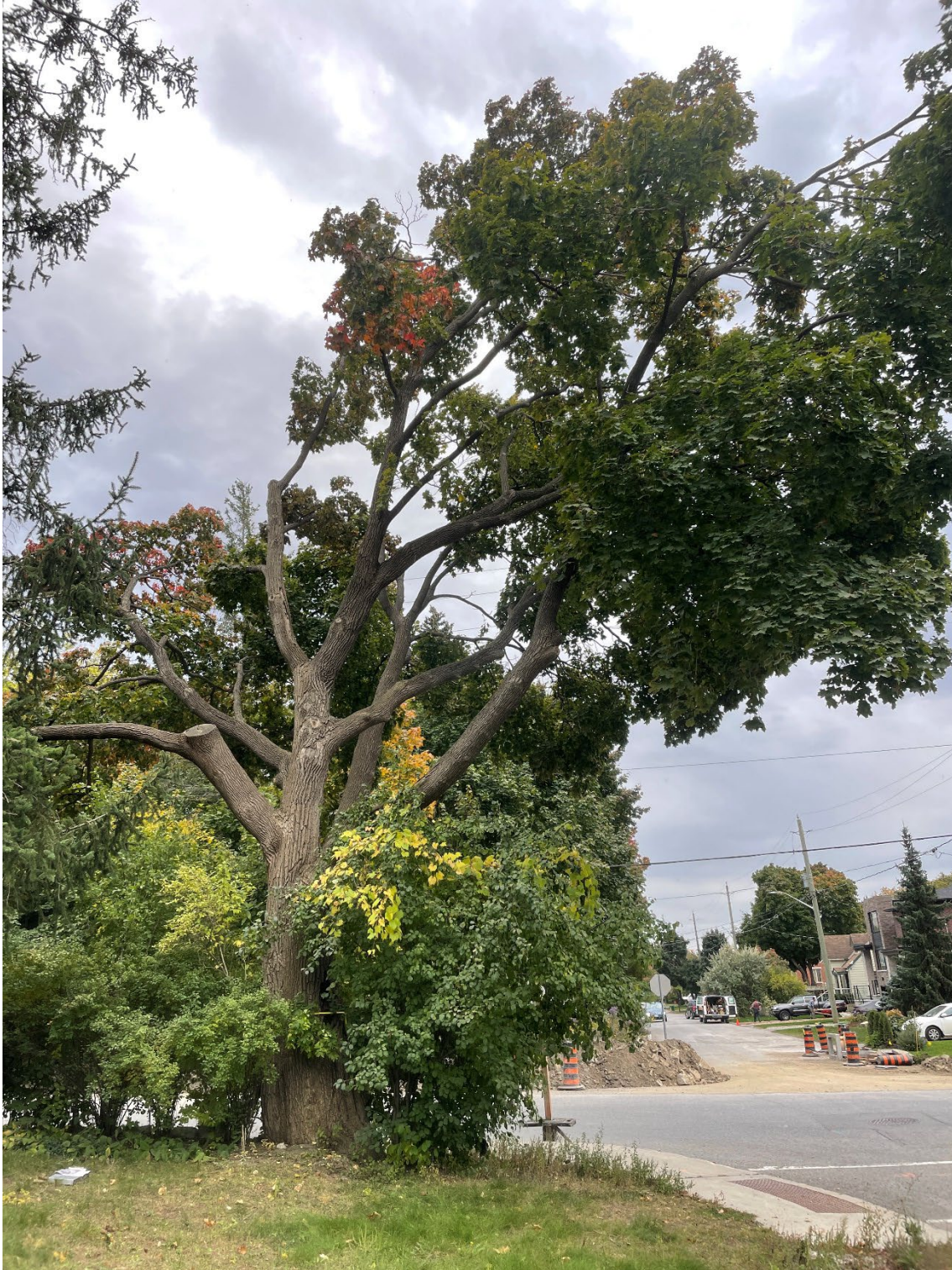
Figure 2: Tree 2, Norway maple in fair/poor condition, ownership undetermined