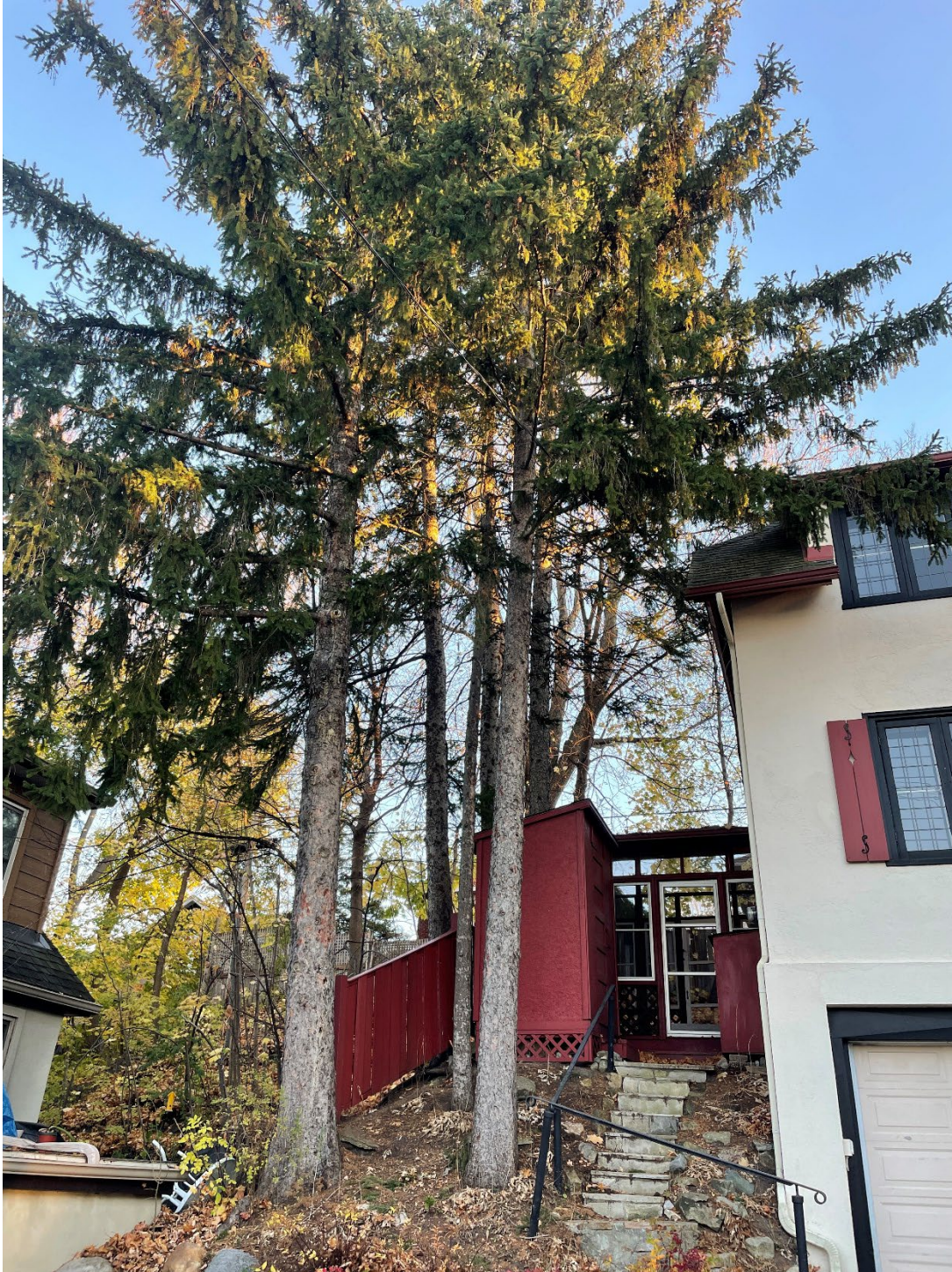
Figure 4: Spruce trees along the eastern property line, trees 17-22. Note the limited rooting space and steep slope.