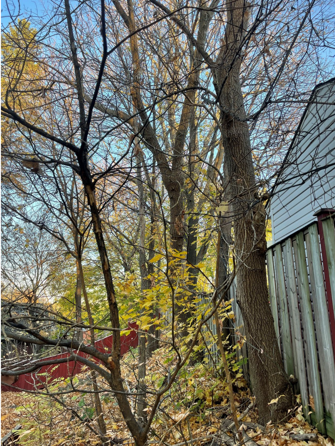
Figure 2: Side view of trees along the rear property line