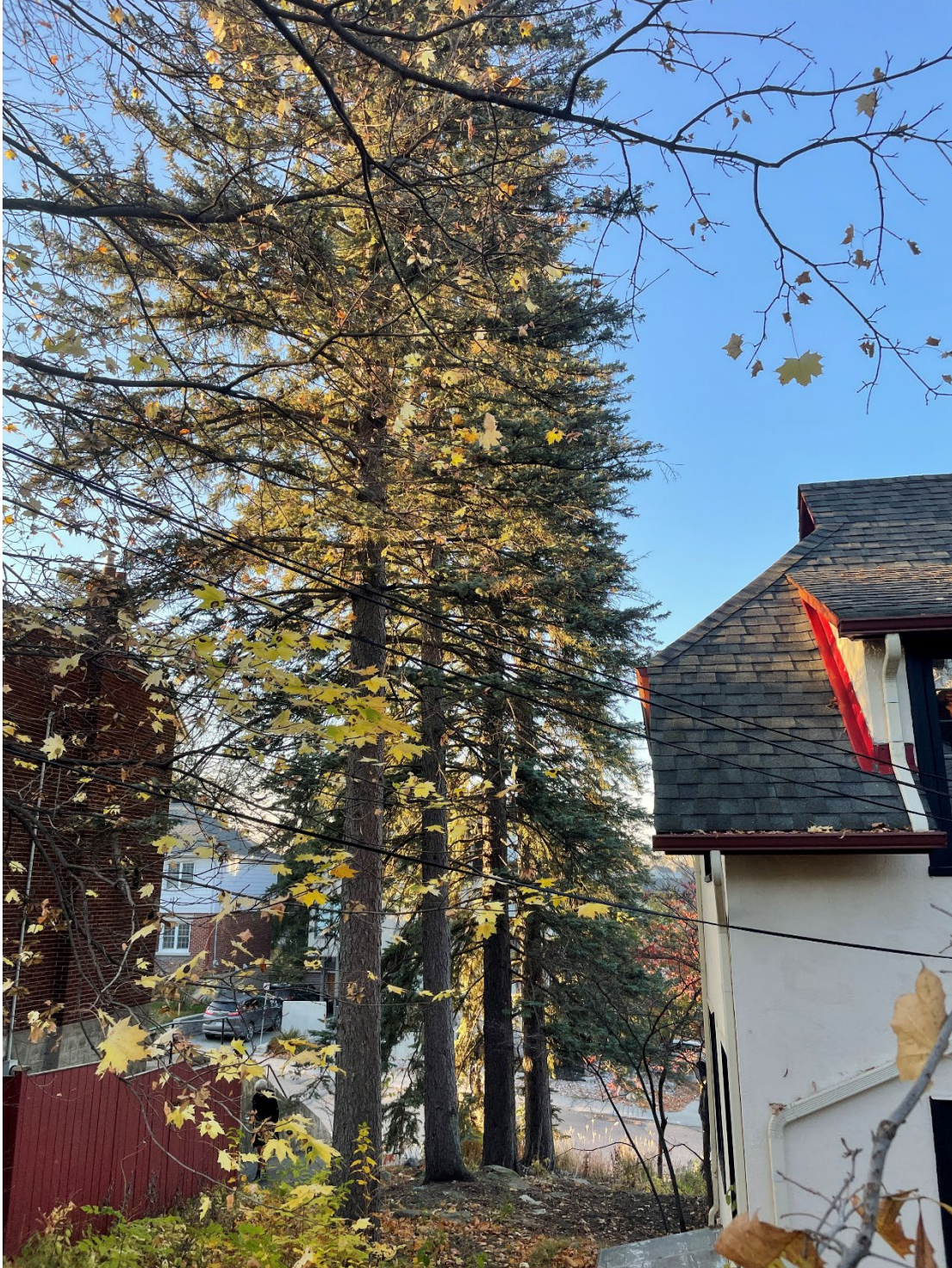
Figure 1: Photo taken from rear of property, Colorado spruce along the west property line, trees 1-4