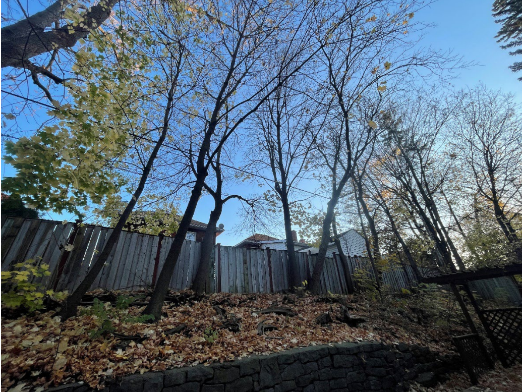
Figure 3: Trees along the rear property line