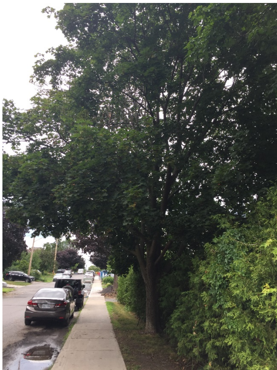
Figure 1: Tree no. 1 - City-owned Norway maple along Dovercourt

Astrid Nielsen, MFC, RPF (Registered Professional Forester) ISA Certified Arborist ® , ON-1976 ISA Tree Risk Assessment Qualified Principal, Dendron Forestry Services Astrid.nielsen@dendronforestry.ca (613) 805-9663 (WOOD)