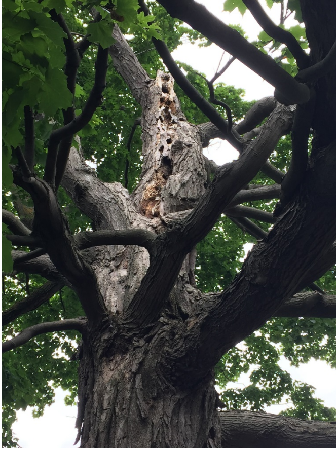
Figure 4: Decay in main stem in the upper canopy of tree no. 3