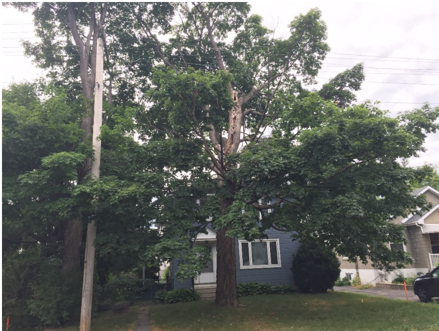
Figure 3: Large, privately-owned sugar maple in poor health that is not retainable