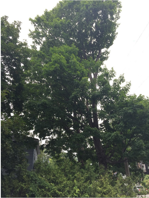
Figure 2: Tree no. 2 - retainable sugar maple in the corner of the property